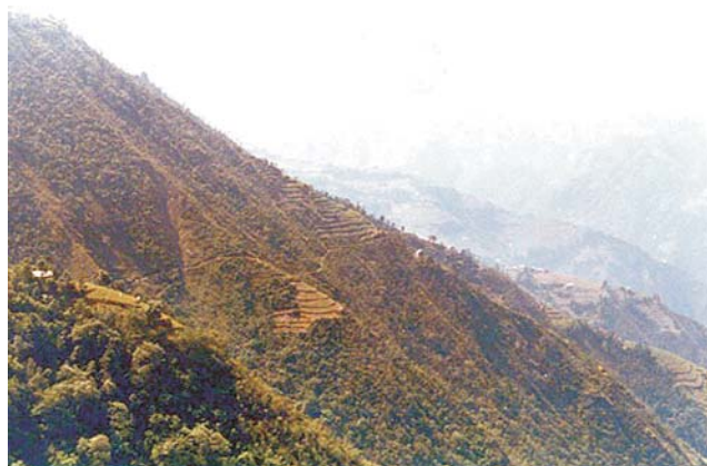
Secondary Growth Trees

Economic (agricultural) density measures the ratio between the share of total population and the share of total agricultural production by weight. Table 3.1 shows that the economic density (ED) is highest for the Mountains and lowest for the Terai.