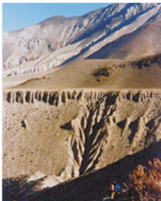
Bare Land Exposed to Erosion, Mustang