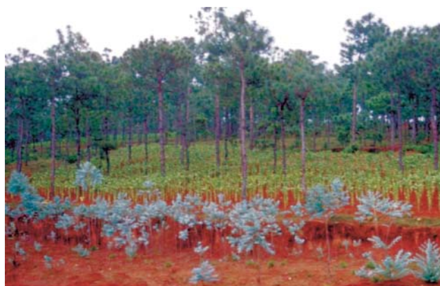
Intercropping between Trees

Land degradation generally refers to loss of utility or potential utility of land or to the reduction, loss, or change of features of land or organisms that cannot be replaced (Barrow 1991). Land is degraded when it suffers a loss of intrinsic qualities or a decline in its capabilities.