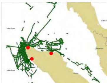
Figure 2 vessel tracks (10Aug. 08)

During the first two months of the project, CBBS collected over four million depth readings;. The tracks of these fishing vessels are given in Figure 1. In exchange for receiving the sounding equipment and the navigation training the fishermen have agreed to provide daily catch data from each of the boats participating in the project