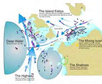
Figure 4. Draft data of ocean currents and fishing locations