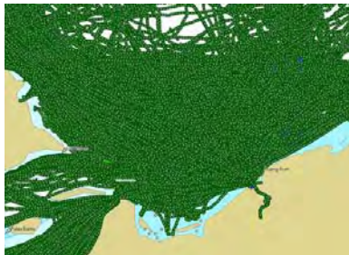
Figure 3 Banda Aceh data