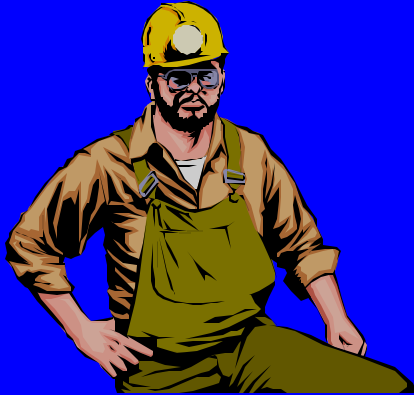
Trade Union Level