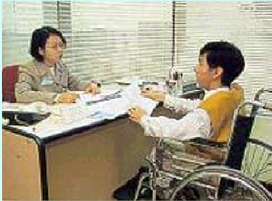
Selective Placement Service, Hong Kong