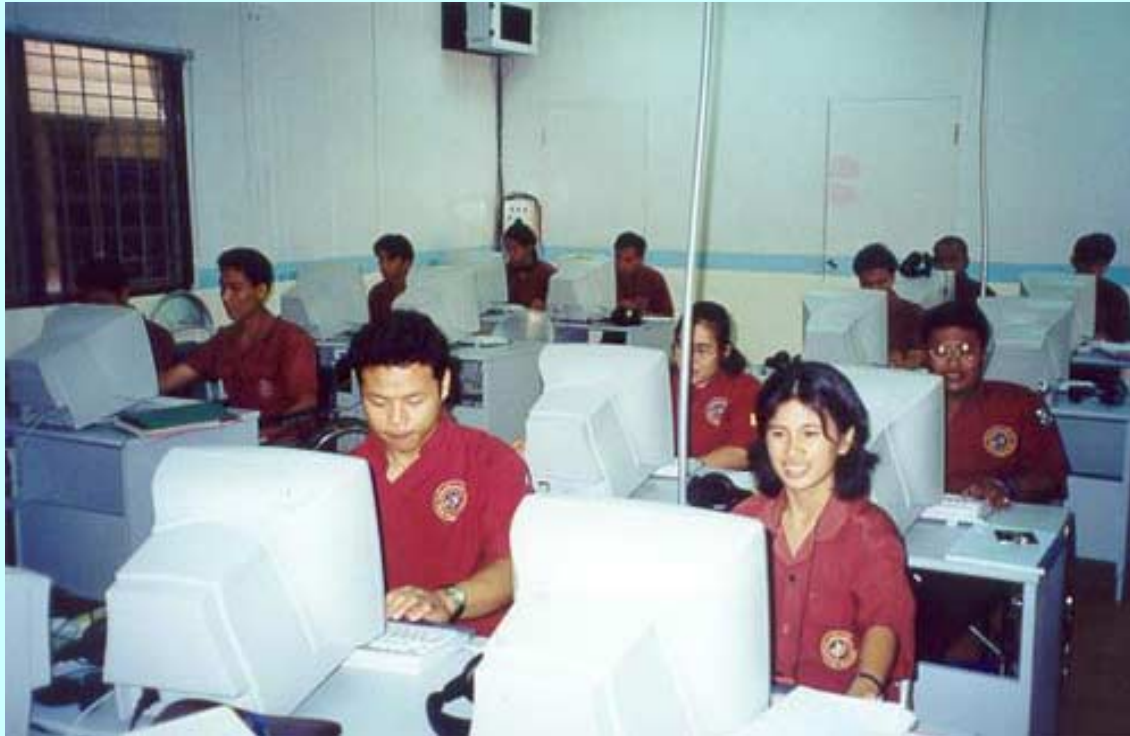
Redemptorist Training Centre for Disabled, Thailand