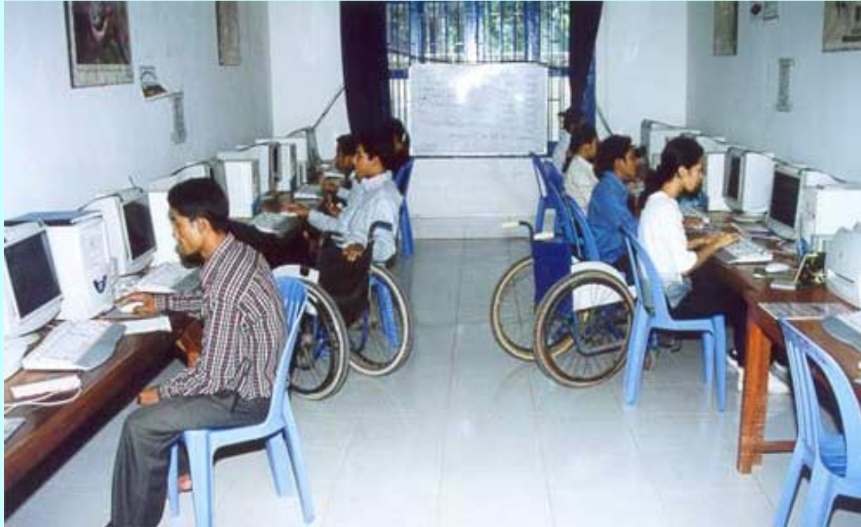
Maryknoll Wat Than Training Centre, Cambodia