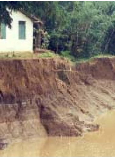
Precarity of human settlements along the banks of alluvial rivers. (Indonesia 1996)