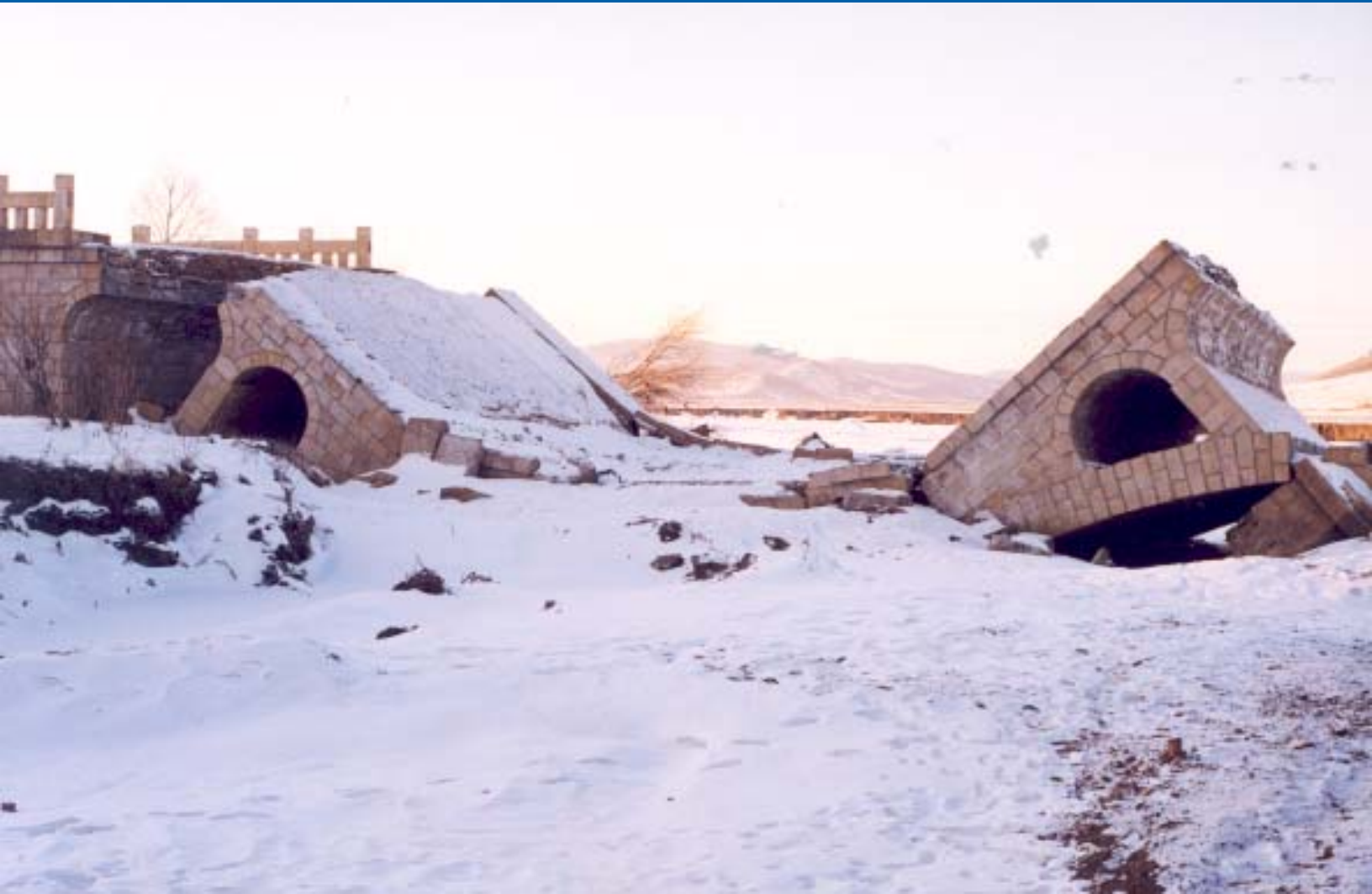
Bridge destroyed by flash flood in inner Mongolia (1998)