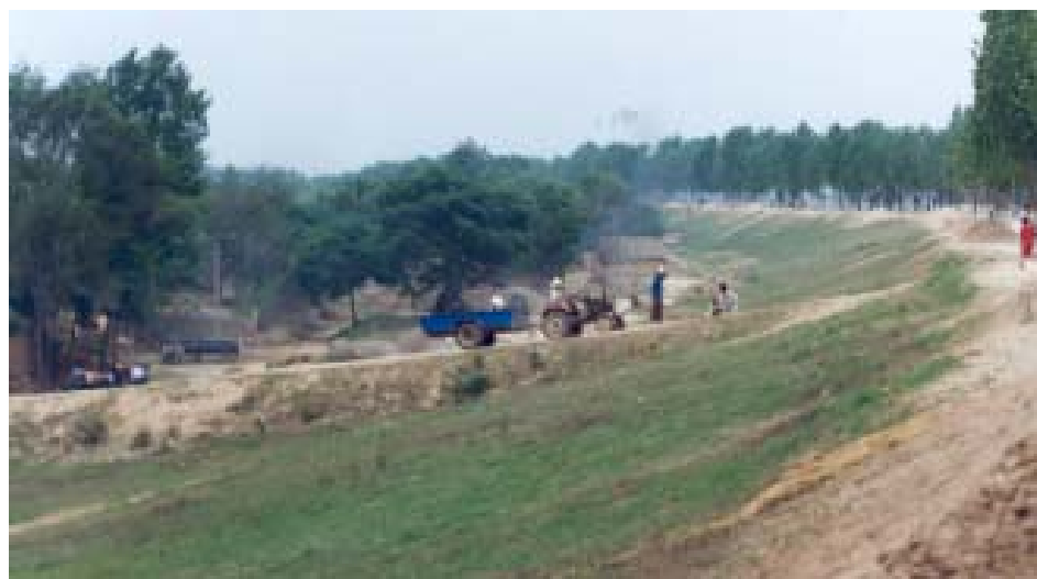
Protective spurs along the Yellow River flood control embankment (1999)

ADB adopted a water policy for the first time in 2001, reflecting the urgent need to formulate and implement integrated, cross-sectoral approaches to water management and development. 5