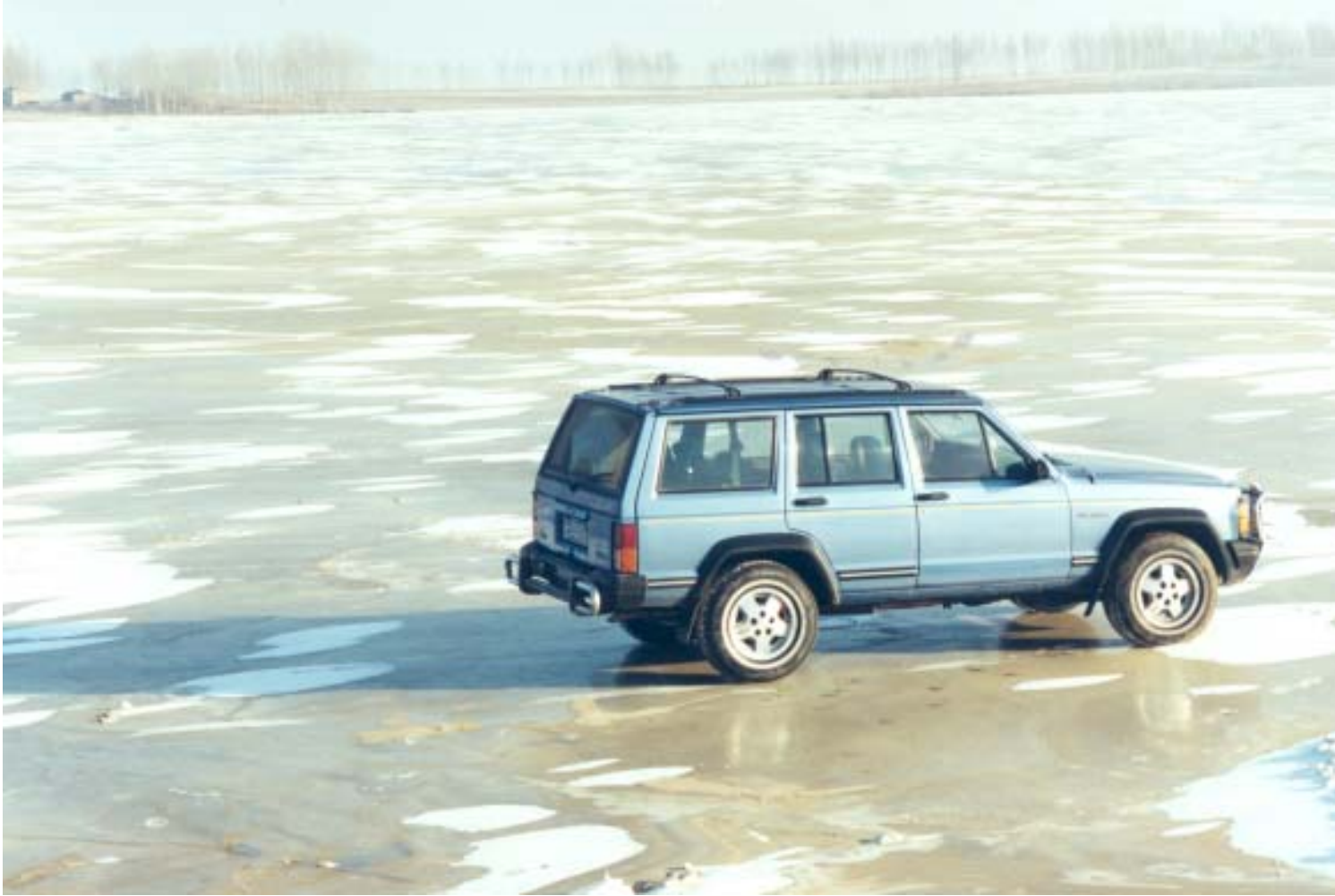
Flood water frozen in place in the Song Lua River basin (1998 – 1999)