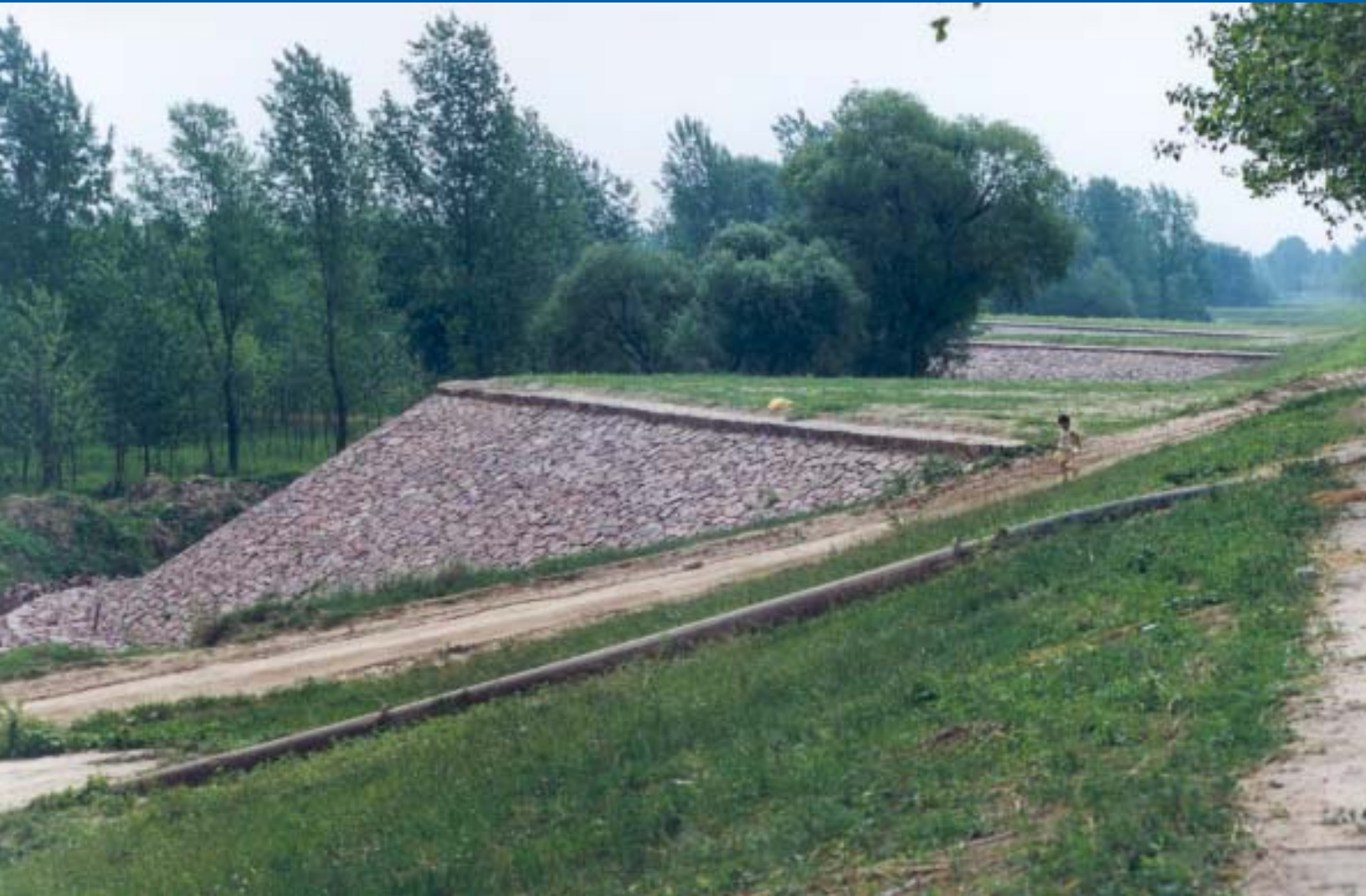
Protective spurs along the Yellow River flood control embankment (1999)