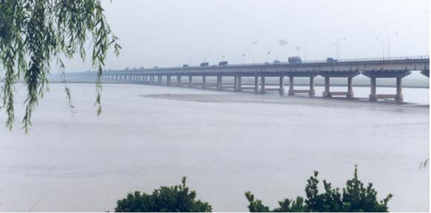
The Yellow River near Zhang Lou, in the People's Republic of China where the width is about 20 km. (1999)

this is where the real challenge lies in the introduction of flood management. The use of flood insurance deserves special attention in this context.