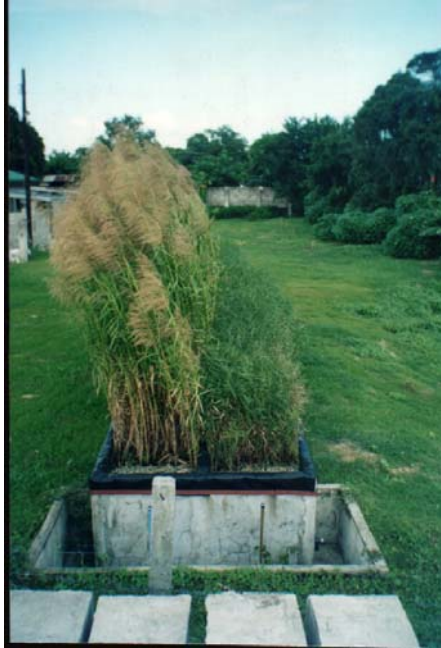
Fig. 4-____. November 2002. Reeds fully mature