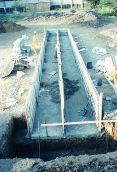
Figure 3-1 Construction of reedbeds, showing elevations of the floor. The outlet zone is in the foreground.