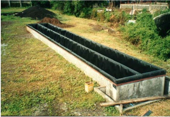
Figure 3-3 The reedbeds after HDPE-liner installation, before placement of soil media.