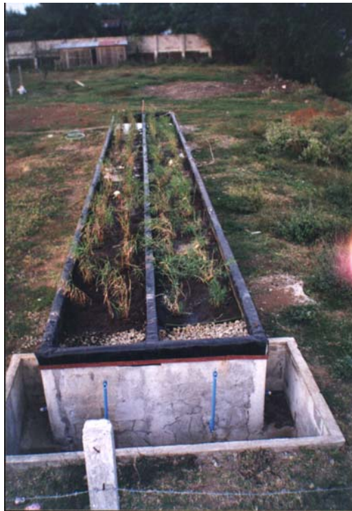
Fig. 4-__ Immediately after planting Dec 2001