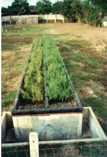
Fig. 4-__ Between Dec 2001 and Aug 2002

Figure 4-__ Comparative growth spread mechanisms. P. karka (left) sends aboveground stems on the surface which grow shoots, while P. australis (right) sends underground rhizomes and new shoots erupt away from the mother plant.