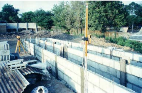
Figure 3-2 Laser-level equipment used to ensure proper elevations during construction.