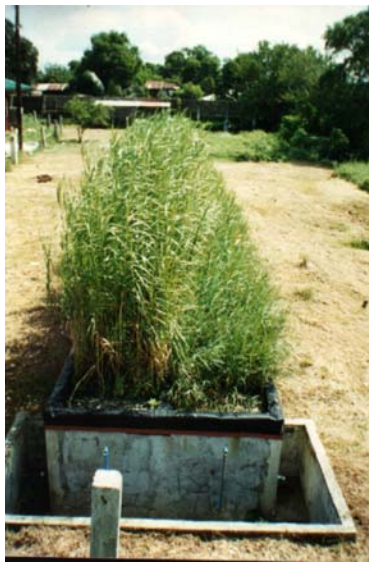
Fig 4-__. August 2002.