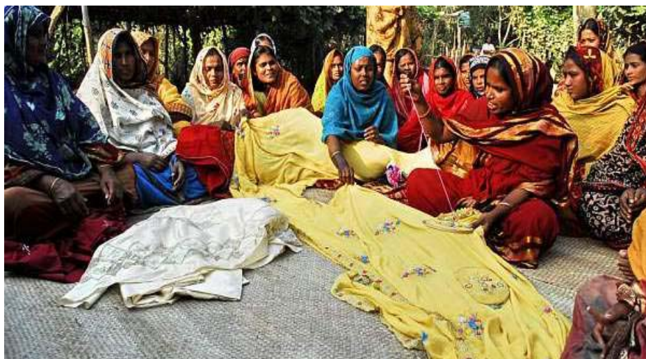
INSPIRED BY NGOs NGOs play an important role in organizing rural women, increasing their awareness and mobilizing them to diversified trades and works

NGOs support women in participating in local-level infrastructure planning and construction, developing savings from their income, and identifying income-generating opportunities. ■