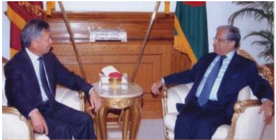
TOP-LEVEL MEETING ADB Vice President (Operations I) Liqun Jin met with Chief Adviser Fakhruddin Ahmed during a visit in October 2007 to discuss ADB operations in Bangladesh

The assistance will enable disaster victims resume their normal lives by restoring access to livelihoods and basic infrastructure. Designed based on a joint damage and needs assessment with the Government and development partners, the project aims to contribute to sustainable economic growth by minimizing the devastating impact of severe floods and cyclone, and reducing future risks from similar disasters. The rehabilitation project focuses on capacity building and training to strengthen