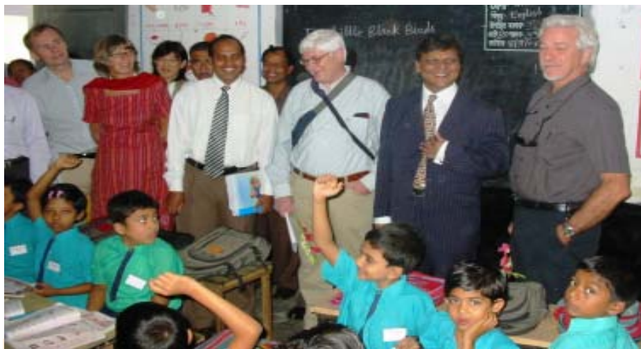
EDUCATION FOR ALL Senior government officials and heads of missions and representatives from the agencies and organizations supporting the PEDP-II visited a school in Manikganj as part of the program's mid-term review in November 2007

Some of the reforms implemented include adoption of key performance indicators and primary school quality level standards; establishment of baseline information including student achievement to monitor progress against targets; establishment of procedures for school level improvement plans; transfer of funds to schools (Tk20,000 per school) in 13 upazilas along with a plan to provide funds to schools in another 13 upazilas soon; award of ten innovation grants to improve access and quality at the school level; approval of strategies and action plans for gender, tribal children, children with special needs, and vulnerable children (implementation has