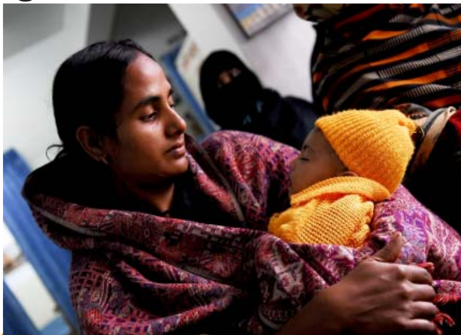
URBAN HEALTH A mother with her child at an urban primary health care service delivery center in Dhaka

mary health care in Bangladesh since 1998 through the first and second urban primary health care projects. The technical assistance is a continuation of that support, and