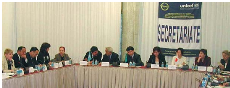
CONFRONTING HEALTH CONCERNS Representatives of the Government, Parliament, nongovernment organizations, and experts discuss sustainable efforts to address micronutrient deficiency in Kazakhstan

G overnment officials, members of the Parliament, nutrition experts, food industries, and nongovernment organizations (NGOs) in Kazakhstan held on 19 April roundtable discussions with mass media on sustaining efforts to eliminate micronutrient deficiency in Kazakhstan and implement the regional project on Improving Nutrition for Poor Mothers and Children in Central Asian Countries in Transition, financed by the Japan Fund for Poverty Reduction (JFPR).