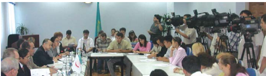
MEDIA BRIEFING The Committee for Water Resources announces activities to strengthen the sector programs in the presence of representatives of the Government of Japan, ADB, and consultant team leaders from the technical assistance projects

A $150,000 TA project for institutional strengthening of the CWR aims to help institutional capacity building for the CWR. The TA project is expected to strengthen measures and strategies toward improving government programs' performance in the water supply sector.