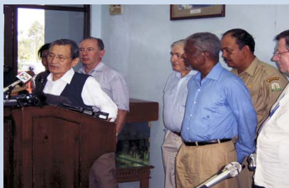
TSUNAMI ASSISTANCE Then ADB President Tadao Chino speaks at a joint press conference in Banda Aceh, Indonesia, in the presence of UN Secretary-General Kofi Annan and World Bank President James Wolfensohn

For more information on the tsunami coordination efforts, visit http://adb.org/tsunami/ . ■