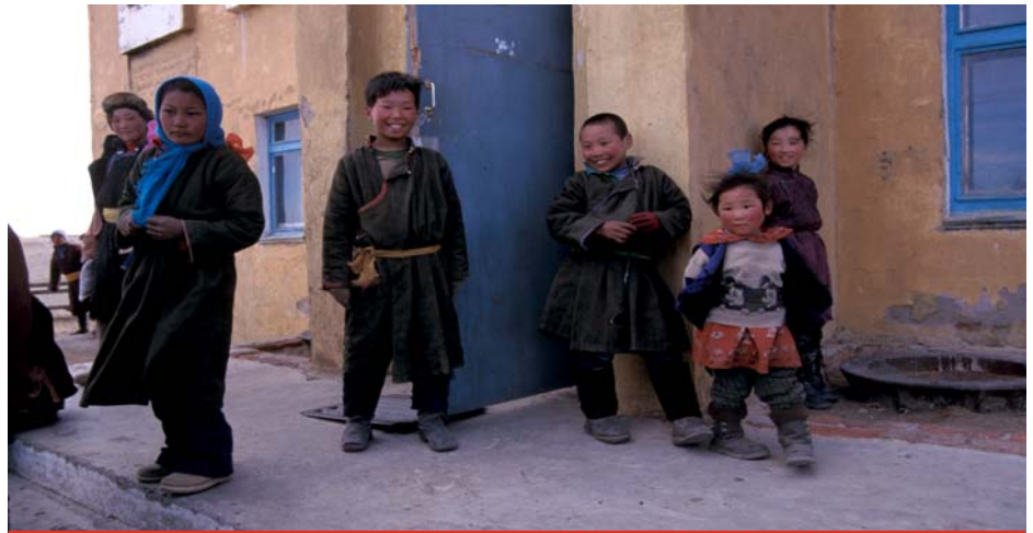
VULNERABLE GROUP Children land on the streets for a variety of reasons—domestic violence, parental landlessness, family homelessness, natural disasters, civil unrest, and family disintegration (most notably from parental illness or death from HIV/AIDS)

Children land on the streets for a variety of reasons—domestic violence, parental landlessness, family homelessness, natural disasters, civil unrest, and family disintegration (most notably from parental illness or death from HIV/AIDS).