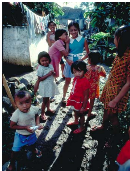
STREET CHILDREN A growing social concern