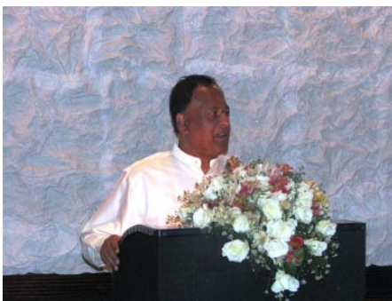
ANNUAL COCKTAILS Sarath Amunugama, Deputy Minister of Finance and Minister of Trade and Investment, speaks of ADB's long standing relationship with Sri Lanka

SLRM held its year-end cocktail for its key stakeholders on 14 December 2009. Government officials, key ADB project staff, and representatives from private sector and development partners were present.