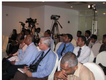
MEDIA INTEREST ADB's support to Sri Lanka will surpass $300 million in 2010