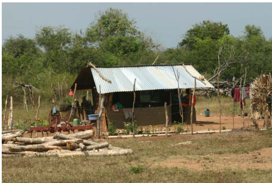
INTERNALLY DISPLACED PEOPLE The government estimates that around $2.7 billion is needed for the rehabilitation of the conflict affected regions in the Northern Province

ADB also provided assistance of $12.8 million (from loan savings and cancellations within the portfolio) for the