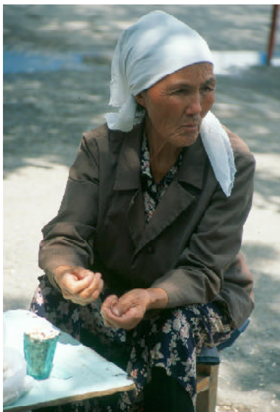
BRIGHTER FUTURE The level of poverty has declined with the positive economic growth in the past 4 years.

The draft state program for poverty reduction with ADB assistance reflects the multidimensional aspect of poverty and considers not only income poverty, but also nonincome factors, such as access to social services, infrastructure, and decision making. The draft program incorporates the efforts of many economic and social sector experts. The experts' findings show that the level of poverty has declined with the positive economic growth in the past 4 years. Despite the positive macroeconomic indicators and the decrease in the number of the poor since 1998, many other parameters have not shown significant improvement. These include the level of unemployment; health indicators, such as life expectancy at birth, incidence of tuberculosis, hepatitis, cancer, and micronutrient deficiencies; accessibility of free medical care; accessibility of schools in rural areas; and the physical deterioration of public utilities and infrastructure. The State Poverty Reduction Program for 2003–2005 is expected to be approved by the Government in the second half of 2002. ■