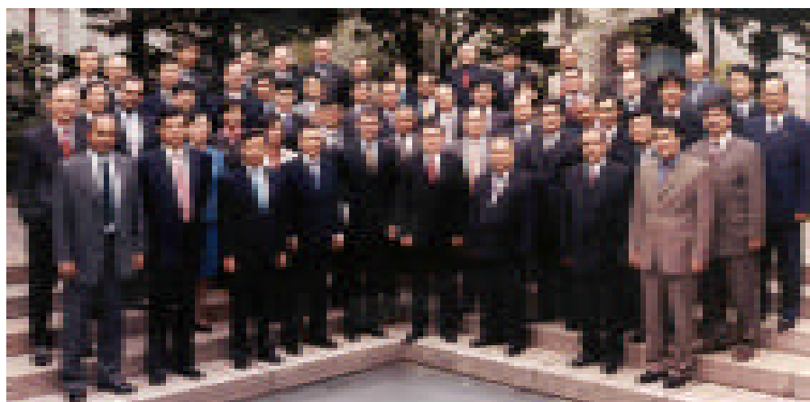
MINISTERIAL CONFERENCE Delegations from Azerbaijan, People's Republic of China, India, Kazakhstan, Kyrgyz Republic, Mongolia, Pakistan, Tajikistan, Turkey, Turkmenistan, and Uzbekistan participated in the Ministerial Conference on Central Asia Economic Cooperation on 25–26 March 2002 at ADB headquarters in Manila, Philippines.

This is the first ministerial forum on economic cooperation in Central Asia under the partnership and a major international event after 11 September. The main objectives of the Conference were to provide guidance for prioritizing regional investment needs and effective resource mobilization to finance them, and to explore new prospects for cooperation in the context of the reconstruction of Afghanistan.