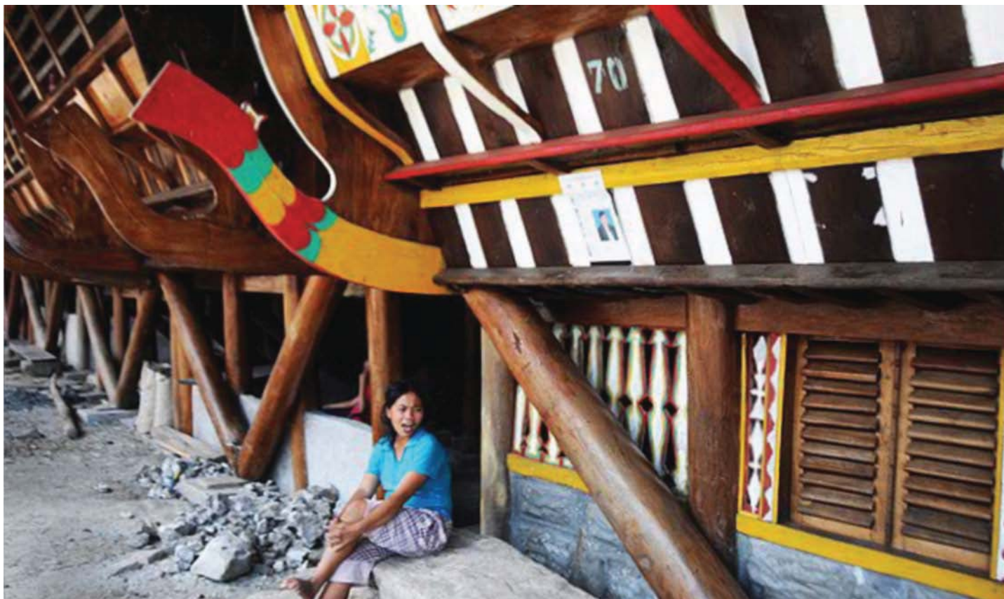
Women's engagement in housing reconstruction led to modifications to accommodate need for privacy, sanitation, and space. Aceh.

allocation of temporary shelters as well as reconstructed houses.