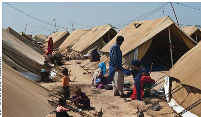
Displacement, destruction of homes, and disruption of existing social protection mechanisms may expose women and girls to long-term effects and consequences. Pakistan.

sons all contribute to their unfavorable access to resources and their lack of power to change things. 3