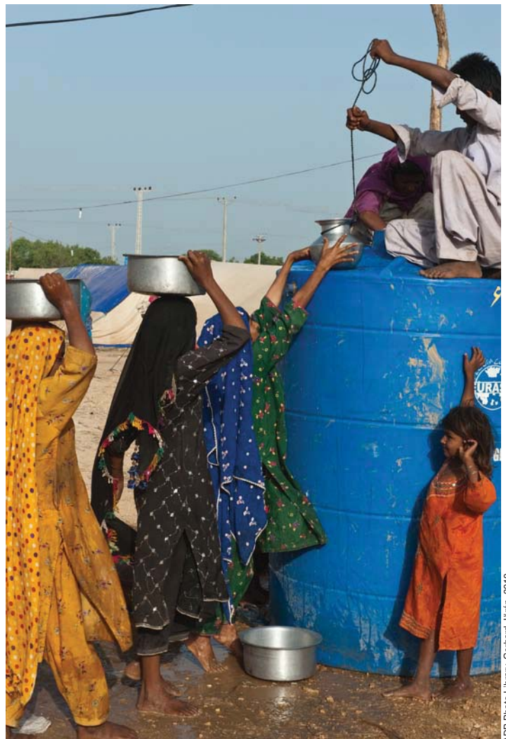
In postdisaster settings, women continue to be the primary collectors, transporters, and users of water. Pakistan.