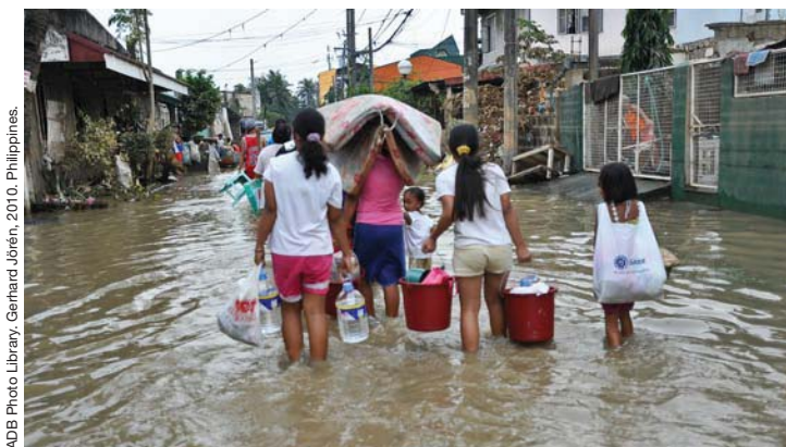
Flood-displaced women in search of dry areas to reestablish households during Typhoon Ondoy, Philippines.