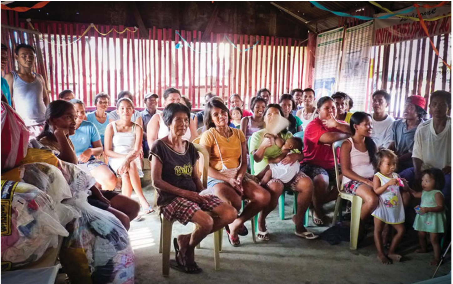
Women and men participate in capacity-building sessions on disaster risk management. Philippines.