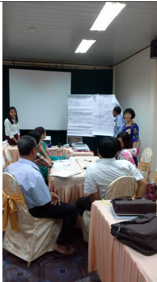
Workshop in can Tho City with key department leaders