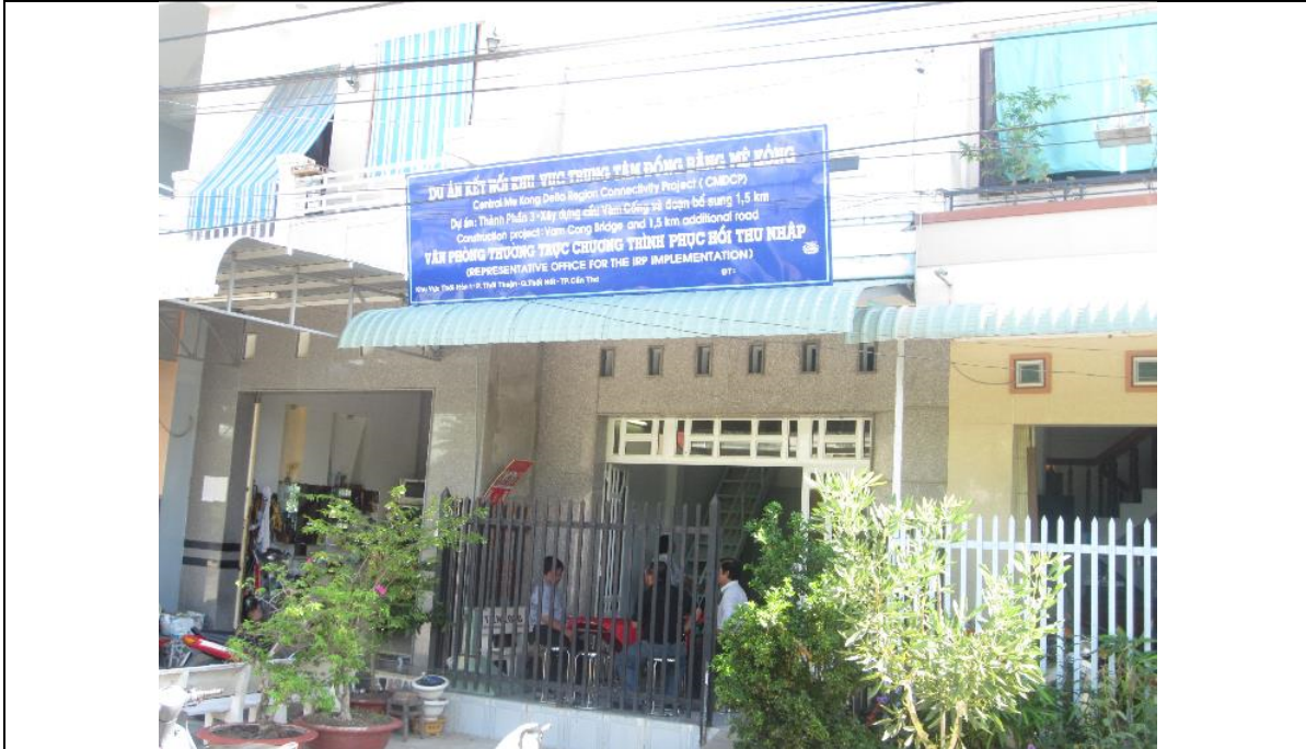
IRP office opened in Can Tho (Thoi Thuan ward) on 18 May 2015