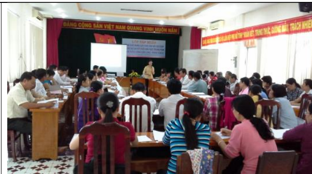
Workshop in Dong Thap Province with representatives of communes and wards