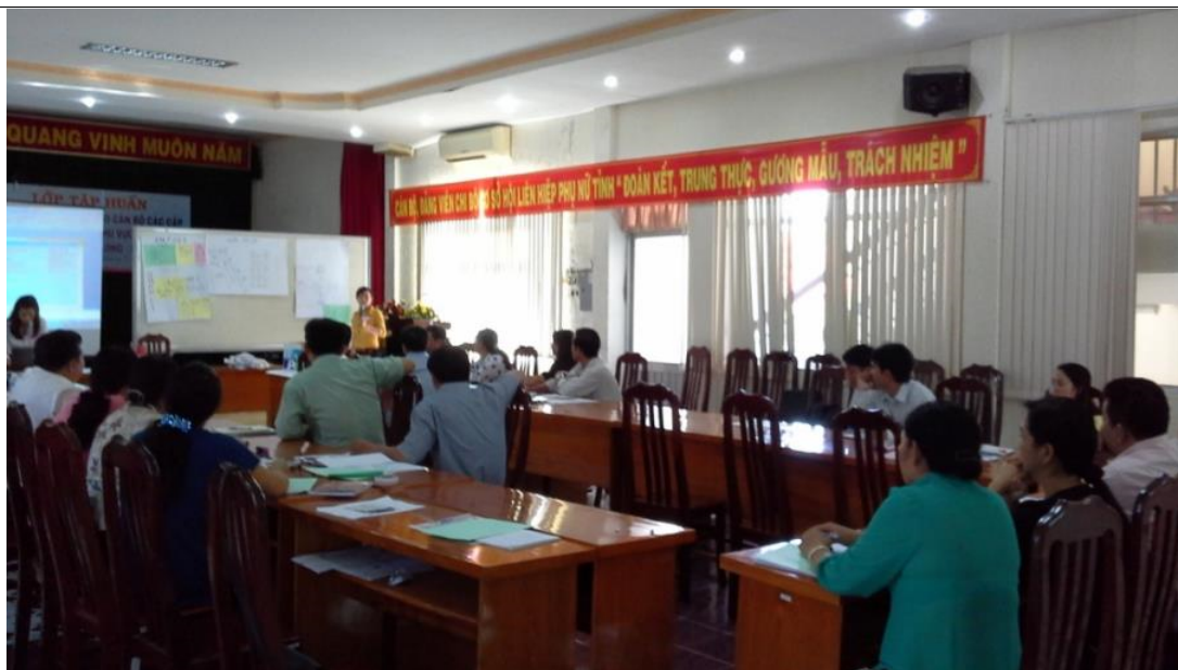
Workshop in Dong Thap Province with provincial and district staff