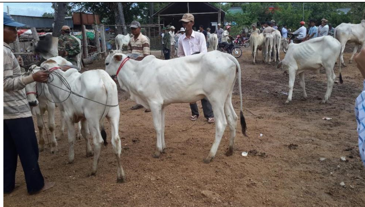
Visit to cow suppliers in An Giang Province