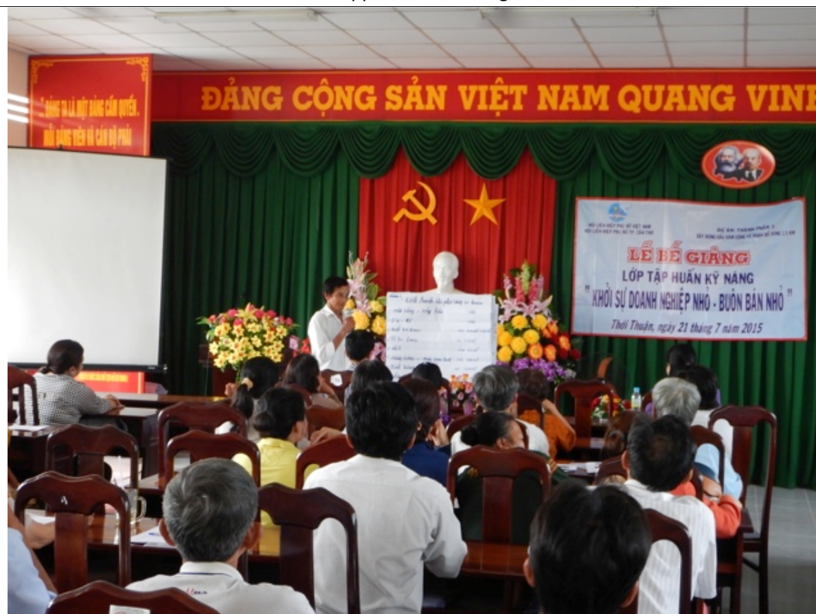
Training on small business by Women's Union in Thoi Thuan ward on 21 July 2015