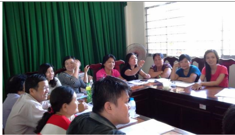
Workshop in Thoi Thuan ward with representatives of ward/commune and hamlets