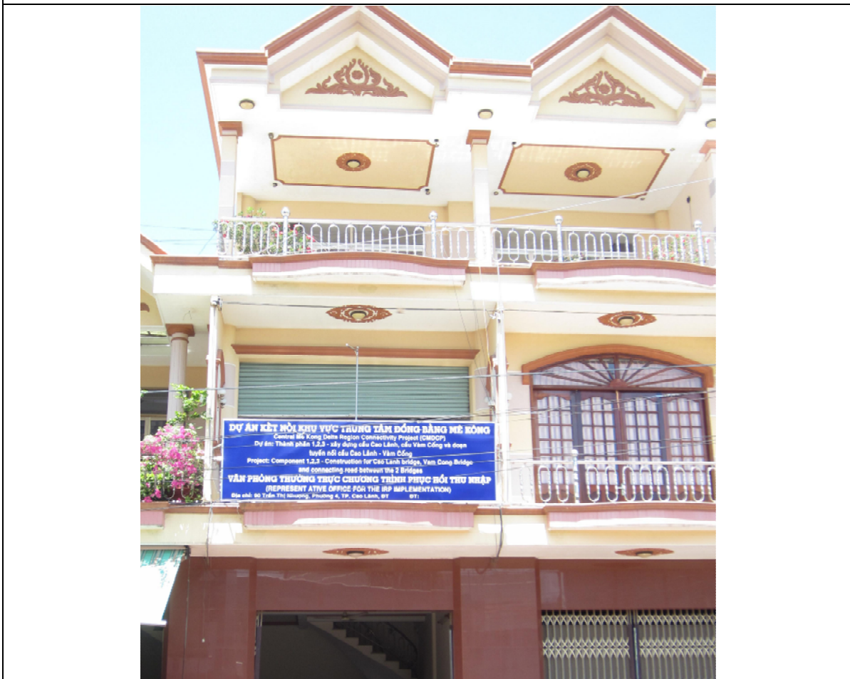
IRP office opened in Cao Lanh City (Dong Thap) on 1 st June 2015