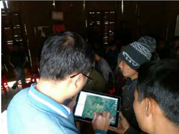
Public consultation in Ban Giang Commune