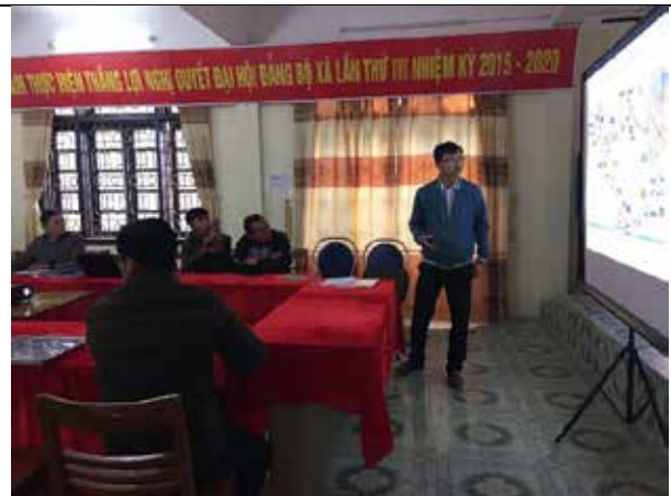
Public consultation in Ban Hon Commune