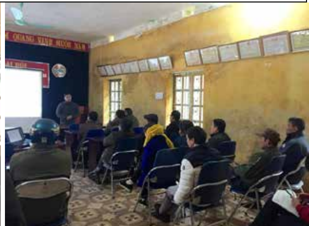
Public consultation in Pac Ta Commune