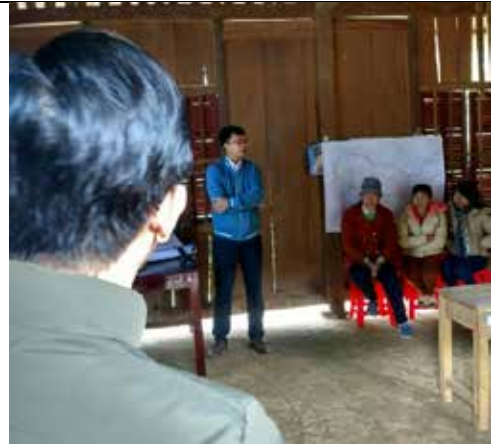
Public consultation in Ban Giang Commune