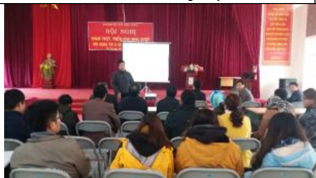
Public consultation in Hoa Mac Commune