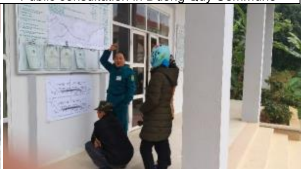
Public consultation in Hoa Mac Commune