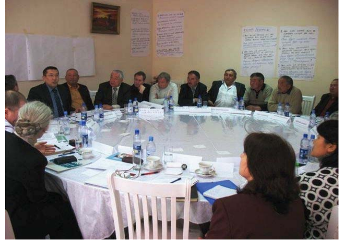
Participants listening to Committee of Road's explanations Участники слушают разъяснения представителя Комитета автомобильных дорог Қатысушылар Автомобиль жолдары комитетінің өкілін тыңдап отыр