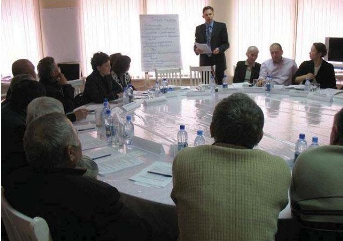
Facilitator opens the consultation in Merke Фасилитатор открывает консультацию в Мерке Фасилитатор Меркедегі кеңес жүргізуді ашып жатыр