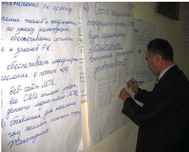
Signing the agreement Подписание соглашения Келісімге қол қою