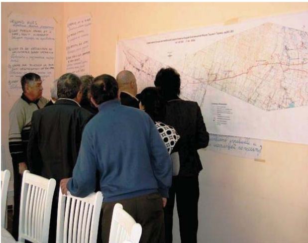
The villagers' interest in the road design is huge Жители села с большим интересом знакомятся с проектом дороги Ауыл тұрғындары зор ықыласпен жолдың жобасымен танысып жатыр