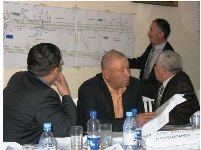
The maps help communicating more clearly Карта помогает лучше понимать ситуацию Карта жағдайды жақсырақ түсінуге көмектеседі