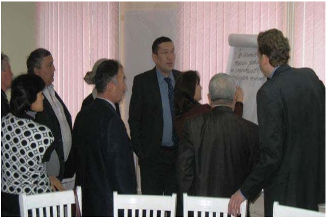
A small group formulates the agreement Небольшая группа формулирует соглашение Шағын топ келісімді тұжырымдауда