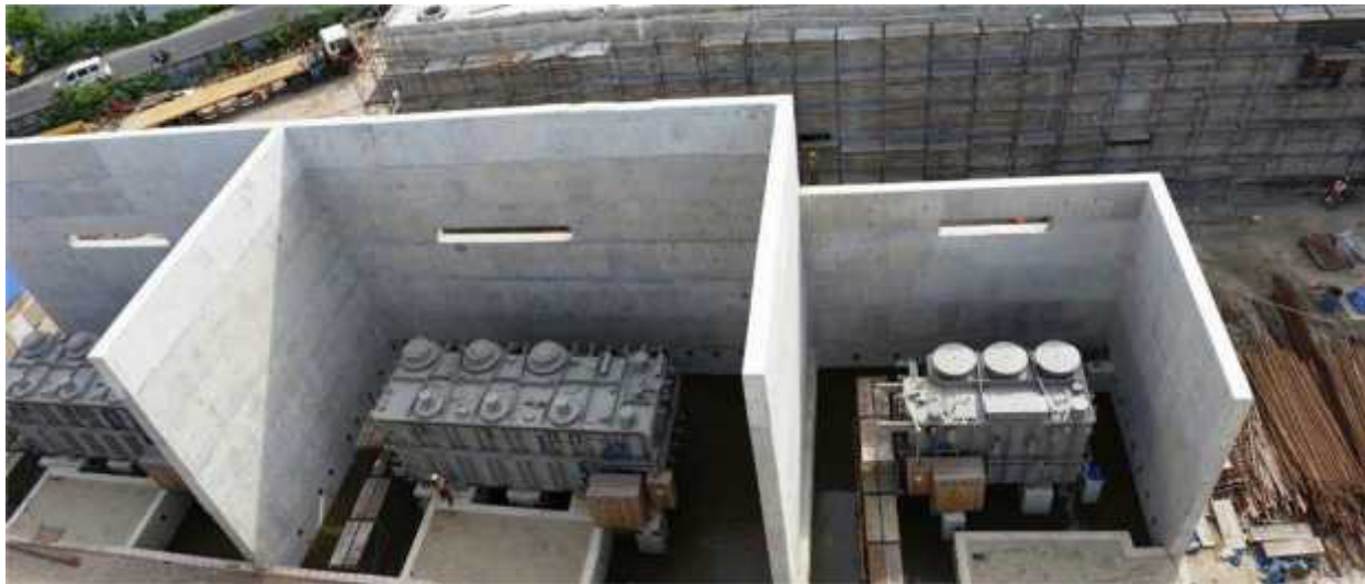
SWITCHYARD TRANSFORMER AREA