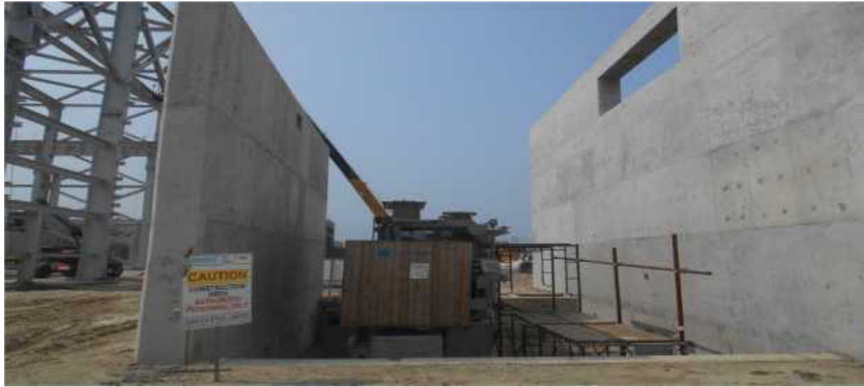
STEP UP AND AUXILIARY TRANSFORMER