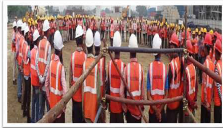
DAILY TOOL BOX