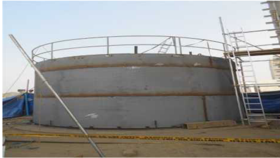
CONDENSATE TANK FOUNDATION