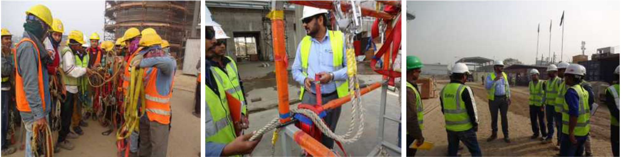
WEEKLY WALK THROUGH AND PPE INSPECTION