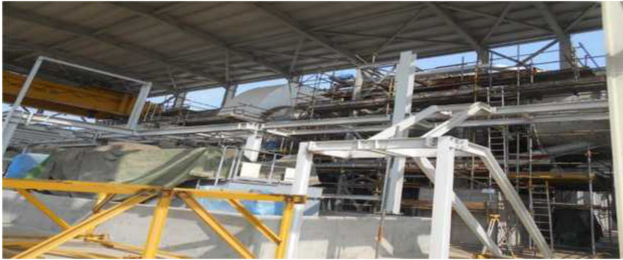
TURBINE HALL STEEL STRUCTURE ERECTION