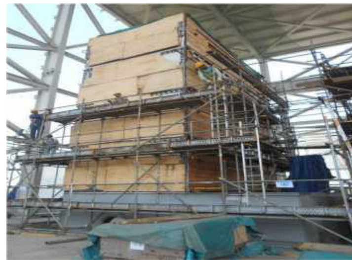
AIR INTAKE (LEFT) AND CONDENSER (RIGHT) ERECTION