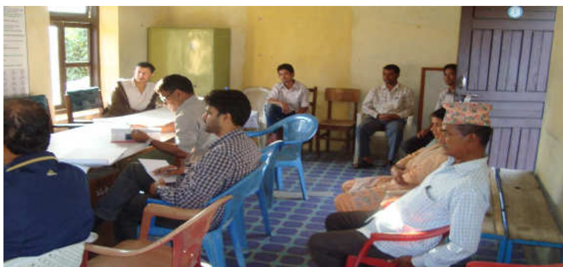
Figure 3 Consultations with WUSC Member