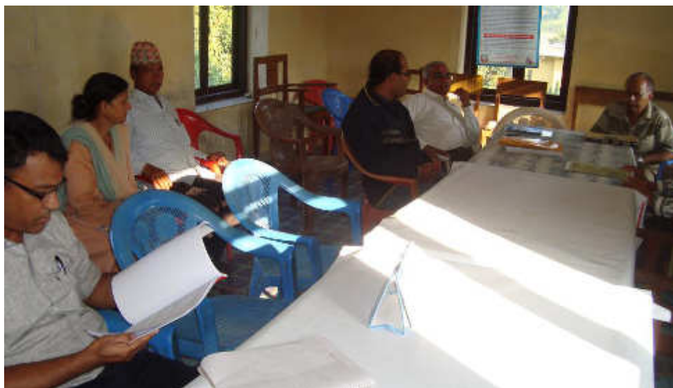
Figure 1 Consultation with WUSC Member