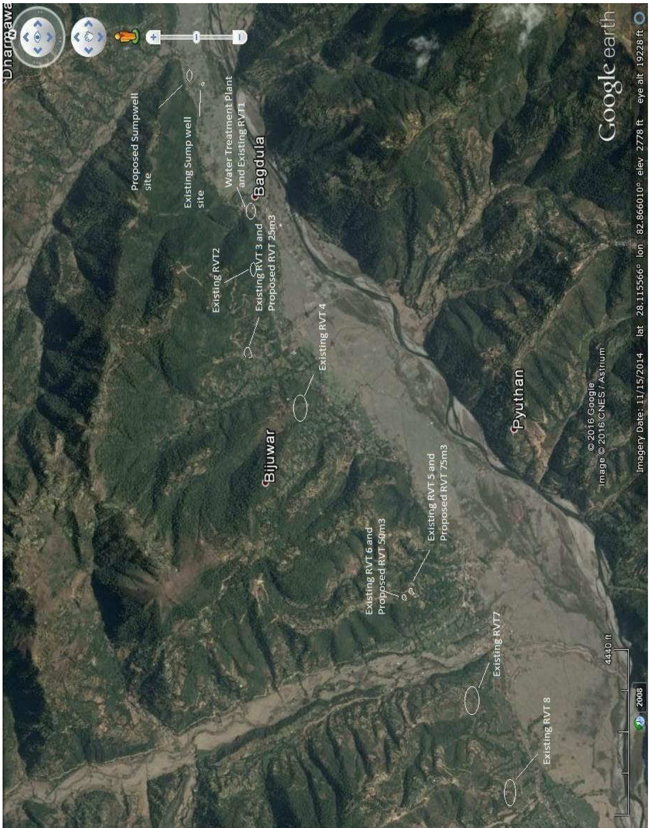
Figure 2: Google map for Proposed location