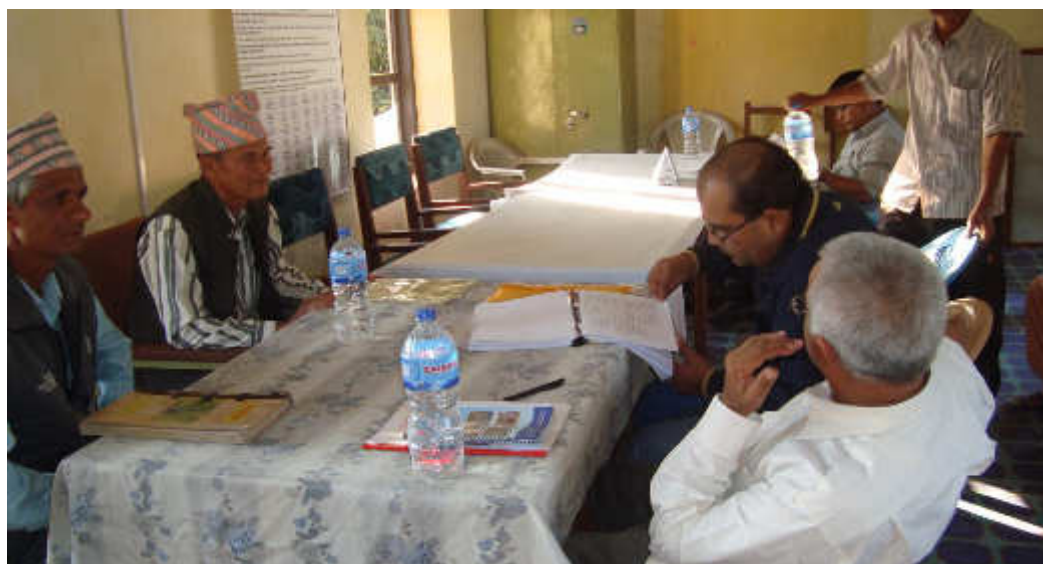
Figure 2 Consultations with WUSC Member