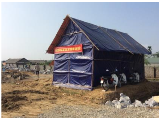
Figure 8 Temporary construction site office (Oct. 2015)