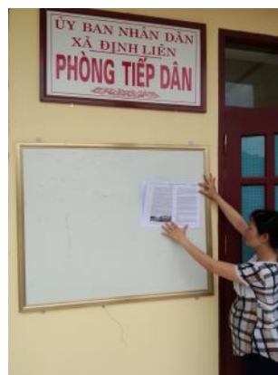
Figure 3 SIEE disclosure at Dinh Lien CPC (May 2015)