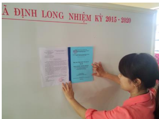
Figure 2 SIEE disclosure at Dinh Long CPC (May 2015)