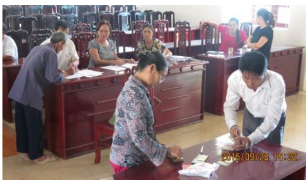
Figure 12 Affected Household checked compensation amount