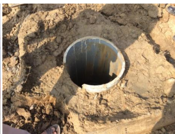
Figure 7 Boring G4 well (Oct. 2015)