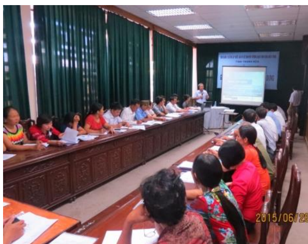
Figure 4 Environmental training for WSCCs and HSPs in Thanh Hoa city (June 2015, picture 01)