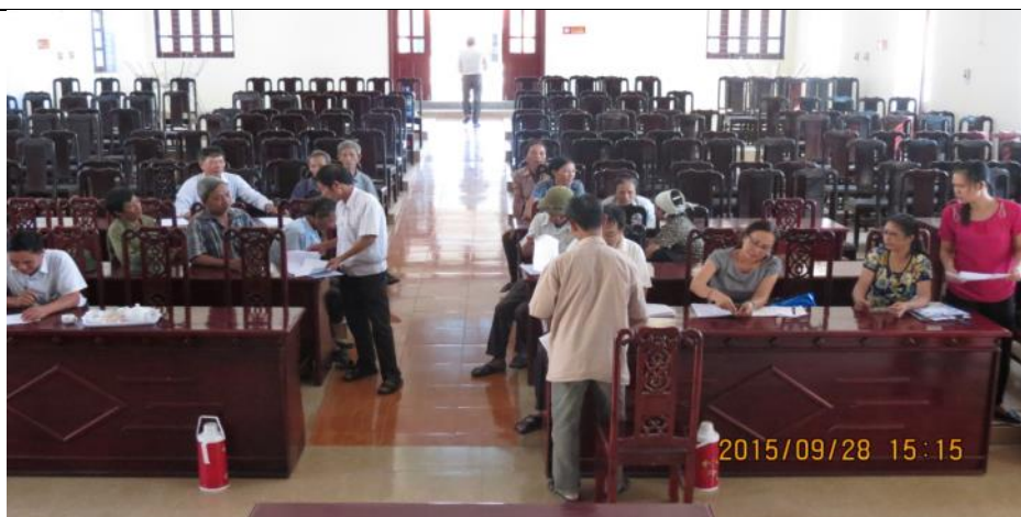
Figure 14 AHs are waiting for their turn