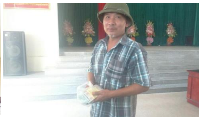
Figure 13 Affected households satisfied with compensation