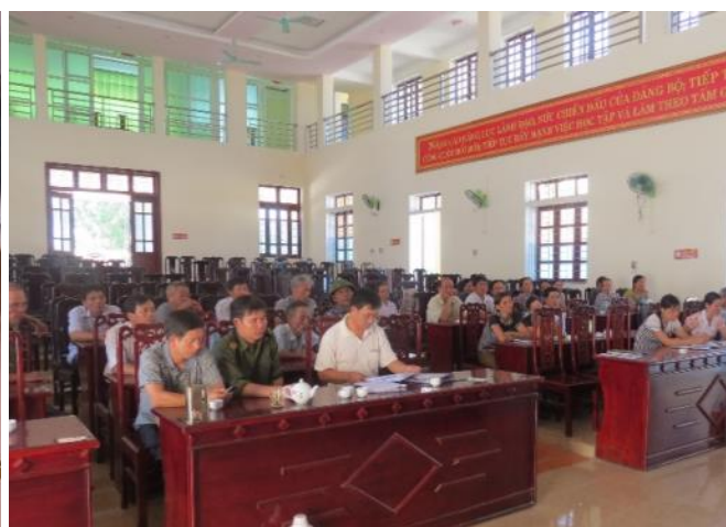
Figure 5 2 nd Public consultation meeting (Aug. 2015)