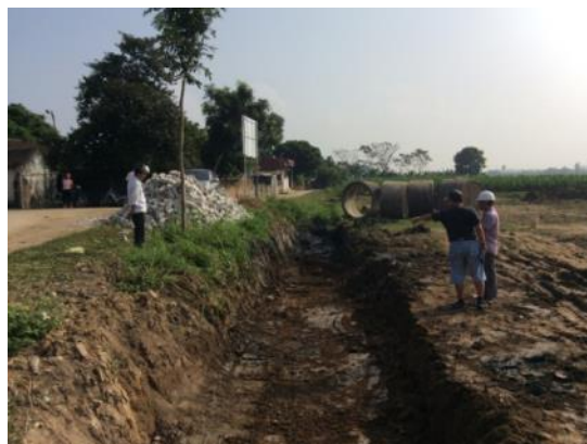
Figure 9 Drainage ditch in front of WTP under construction (Oct. 2015)