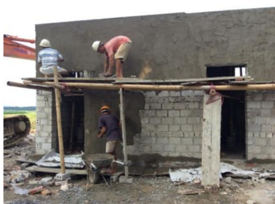
Figure 11 Latrine compartments of Dinh Lien secondary school under construction (Oct. 2015)