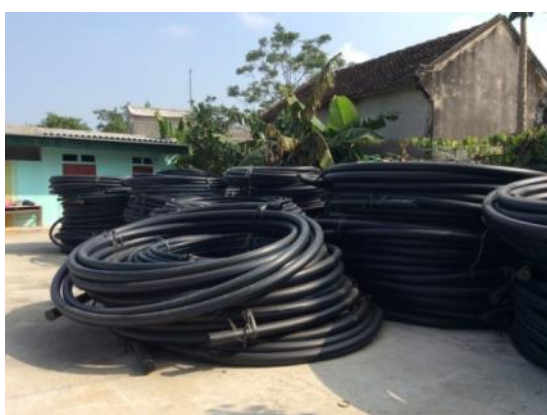
Figure 10 Storing pipes at cultural house 2 of Dinh Lien commune (Oct. 2015)