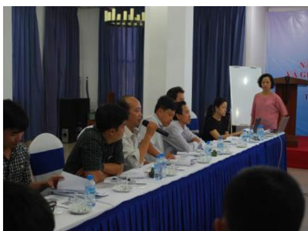
Figure 6 Training course on “Contract and Construction Quality Management” (Sep. 2015)