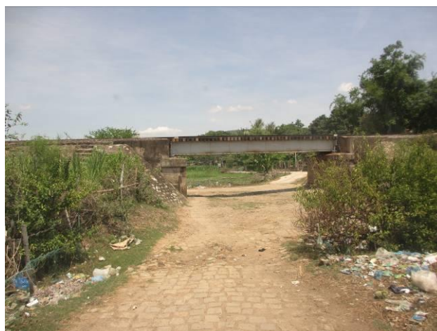
Photo 4. Culvert through the railway at Ben hamlet, My Phu village, An Hiep commune.