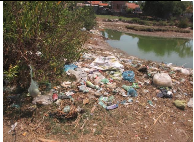
Photo 8. Current status of pond side along the subproject with domestic wastes from local people.