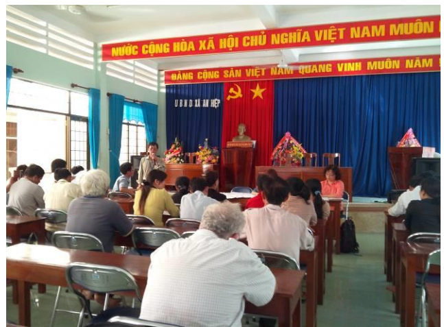
Photo 10. Consultation meeting with local people at the communal hall in An Hiep commune.