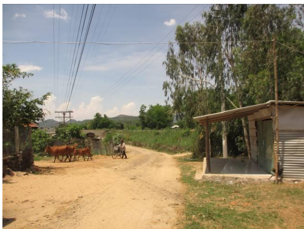
Photo 5. Residential area at hamlet, My Phu village, An Hiep commune.