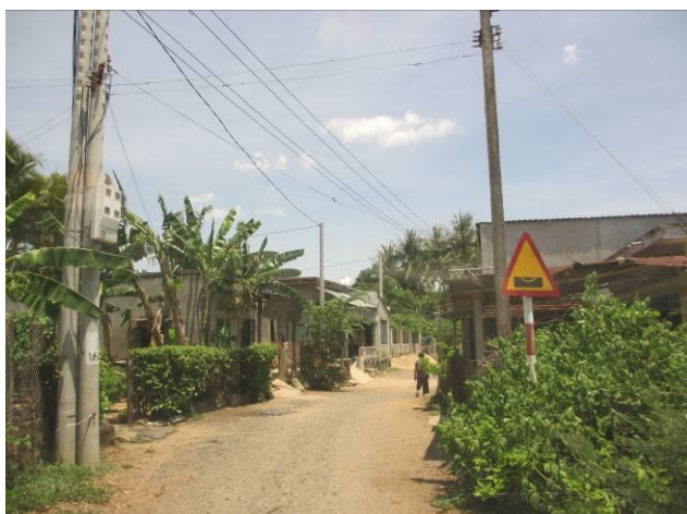
Photo 3. The beginning point of the subproject, An Cu commune.