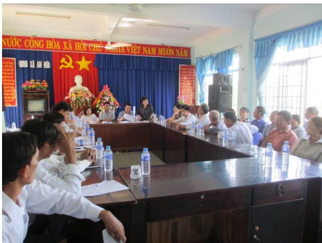
Photo 9. Consultation meeting with local people at the communal hall in An Hoa commune.