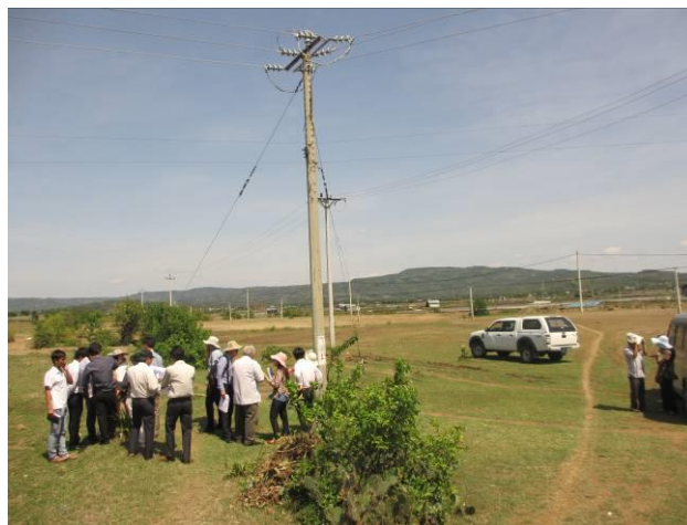
Photo 2. Air measurement site at the intersection of Tan Hoa village, An Hoa commune.