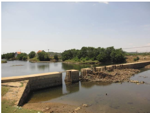
Photo 1. Measurement site for surface water at the construction of drainage and salt control culverts to prevent salt at Km6+400, An Hiep commune.