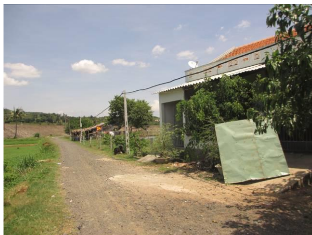
Photo 6. Close to the railway in Dong Duc village, An Hiep commune.