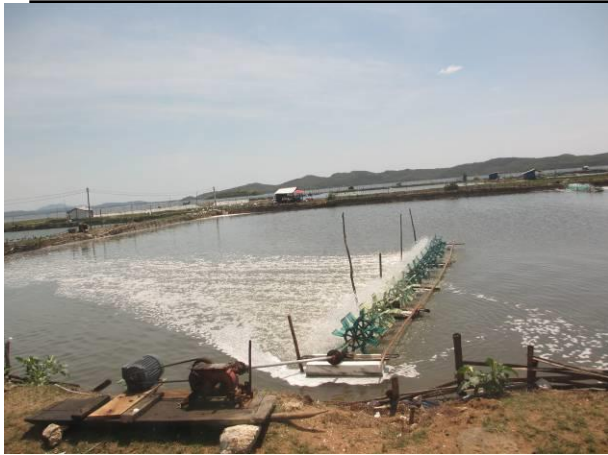
Photo 7. Shrimp pond nearby the subproject.

Upgrading dyke, rural road and drainage and salt control culverts in An Cu – An Hiep – An Hoa communes Subproject Integrated Rural Development Project in Central Provinces – Additional Loan