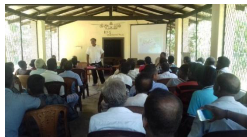
Community Awareness Programs conducted to understand Sea Water Desalination Project