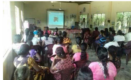
Community Awareness Programs conducted to understand the Pipe lying Works