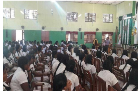
School Awareness Programs conducted to understand the project