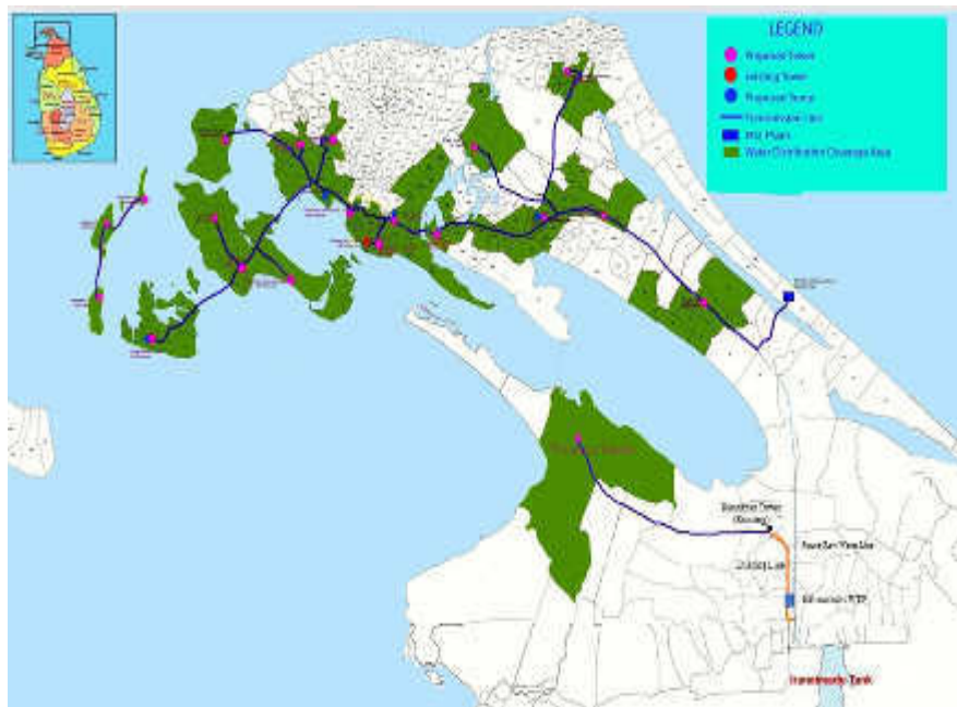
Fig 1.1: Project implementing area