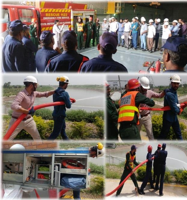
Firefighting Training Conducted by Rescue 1122 Mirpur