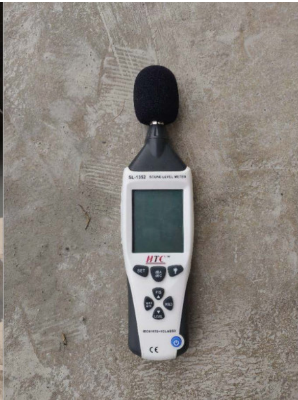
Noise monitoring Equipment