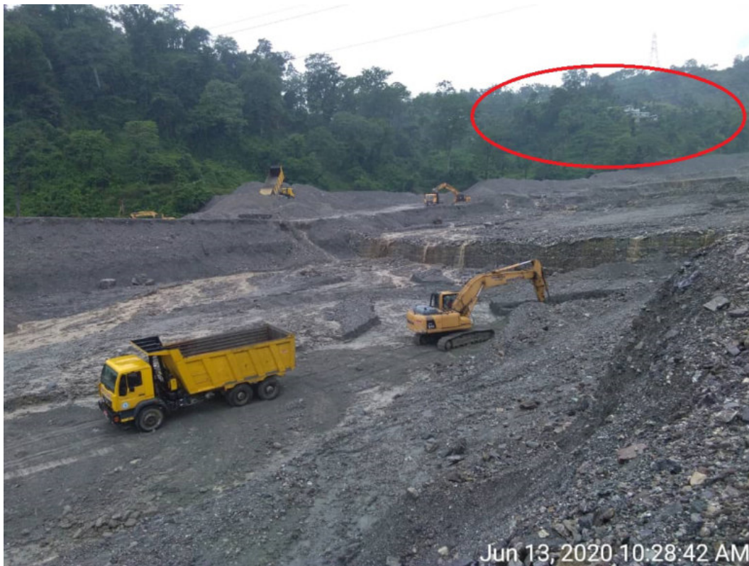
Toe protection. The toe of hill was filled by dredged debris to minimize the risk of flood. The settlement is as marked in red circle.