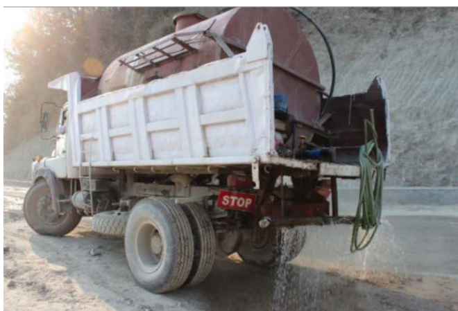
Water Tanker deploying water at site