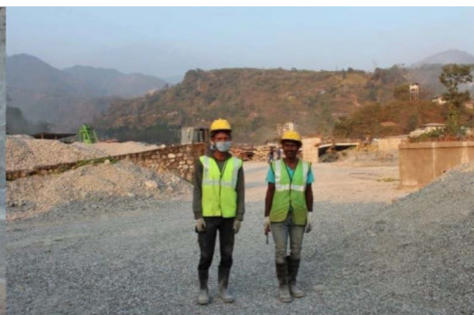
Workers in their protective gear