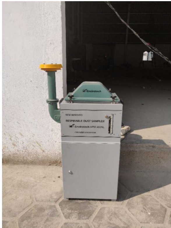
Air monitoring Equipment