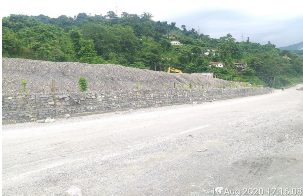
Prevention of soil erosion. Trees were planted along the road to control the debris flow into road side drains.