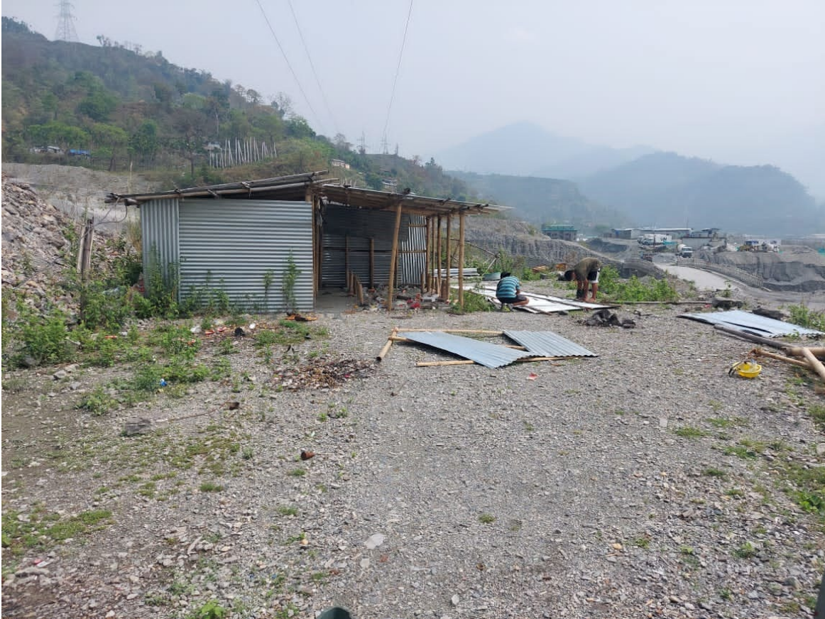
Dismantling of the labour camps