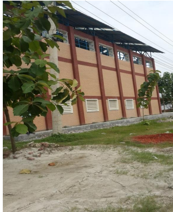
Rajshahi STS-3 Terokhadia