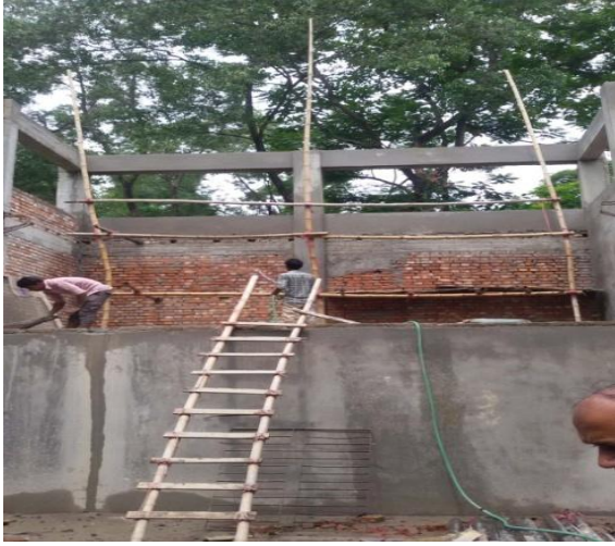
Chittagong STS-10 Tiger Pass