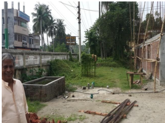
Rajshahi STS-2 Medical