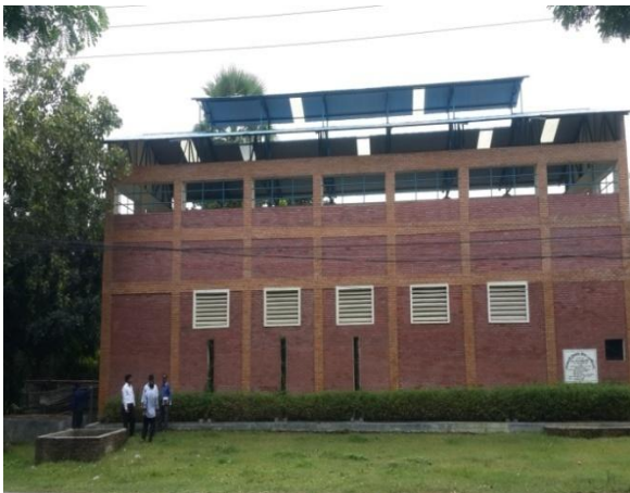
Rajshahi STS-6 Kajla