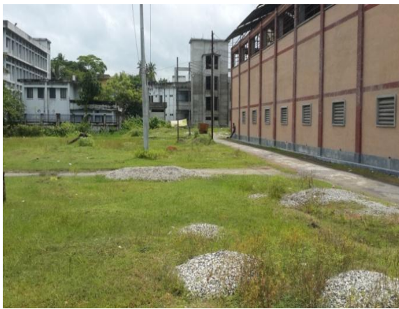
Khulna STS-5 250 Bed Hospital