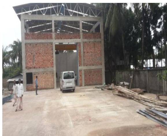
Chittagong STS-5 FIDC