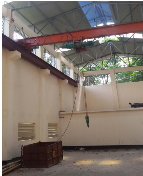
Chittagong STS-8 K-Block DT Road