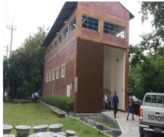
Rajshahi STS-6 Kajla