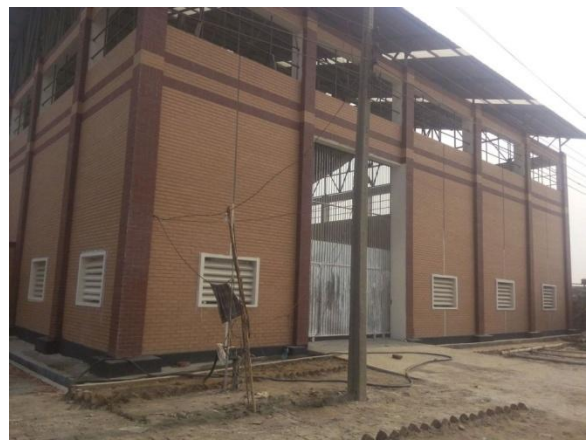
Dhaka STS-7 Hazaribag Progati