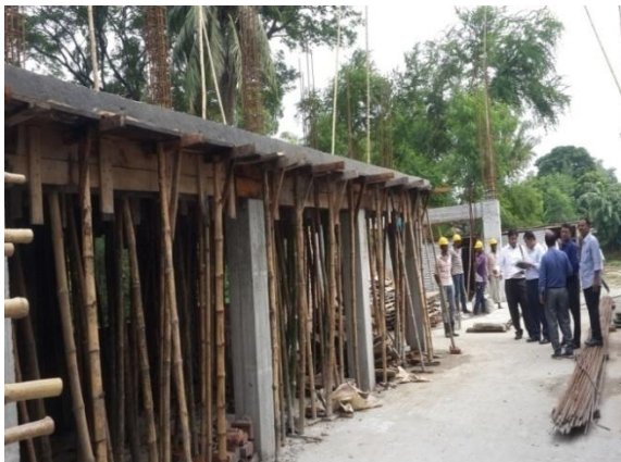
Rajshahi STS-2 Medical