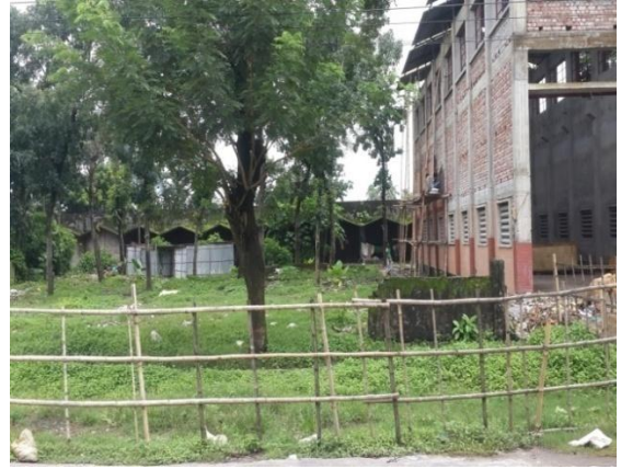
Khulna STS-8 New Market Khalishpur