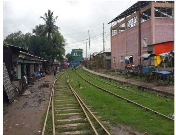
Khulna STS-2 Rail Station Control Van Lifter