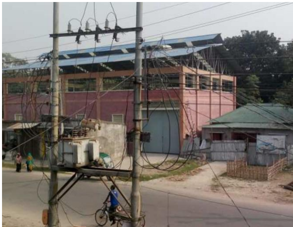
Khulna STS-7 Newsprint Mills BIDC