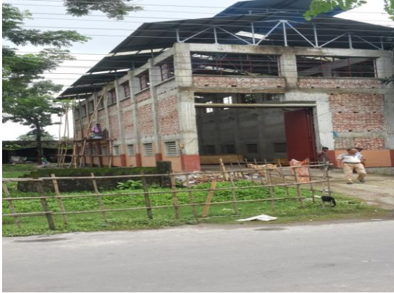
Khulna STS-8 New Market Khalishpur