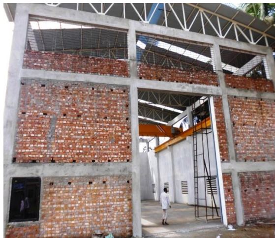
Chittagong STS-9 Port Connecting Road