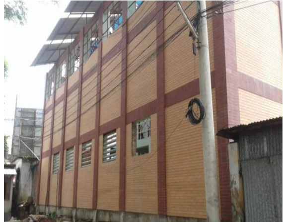
Sylhet STS-2 Shahi Eidgah