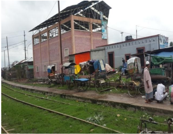
Khulna STS-2 Rail Station