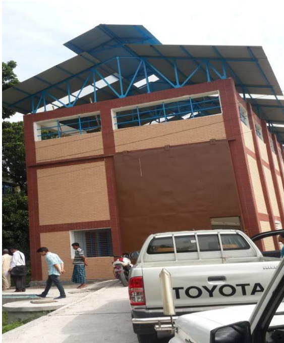
Rajshahi STS-3 Terokhadia