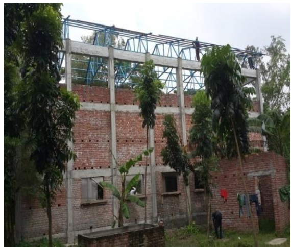
Rajshahi STS-1 Rokeya Hall