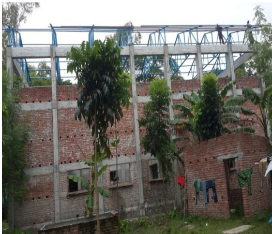
Rajshahi STS-1 Rokeya Hall