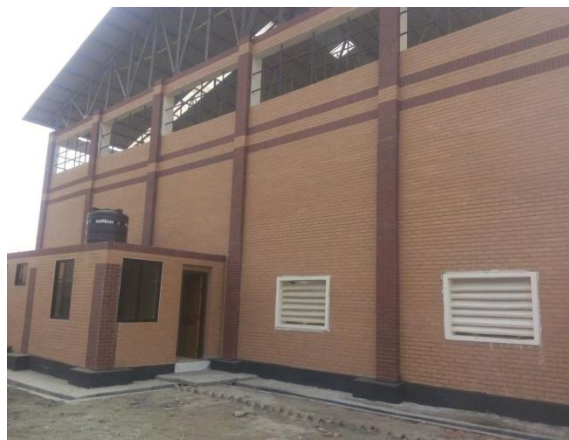
Dhaka STS-7 Hazaribag Progati