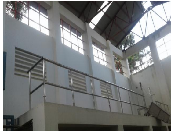
Sylhet STS-3 Rikabi Bazar