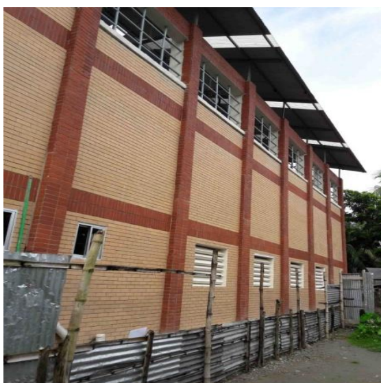
Barisal STS-3 Amanotganj