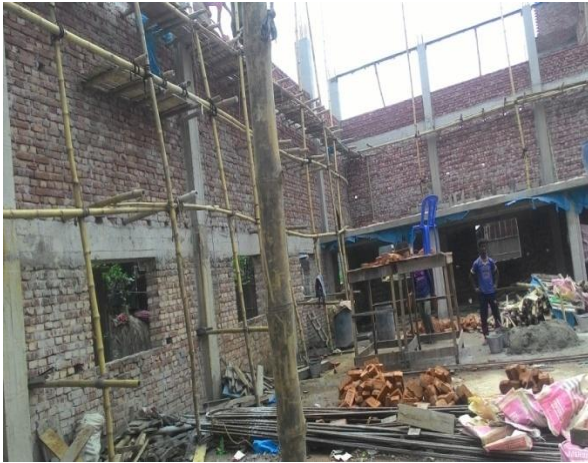
Dhaka STS-9 Jurain Kobosthan