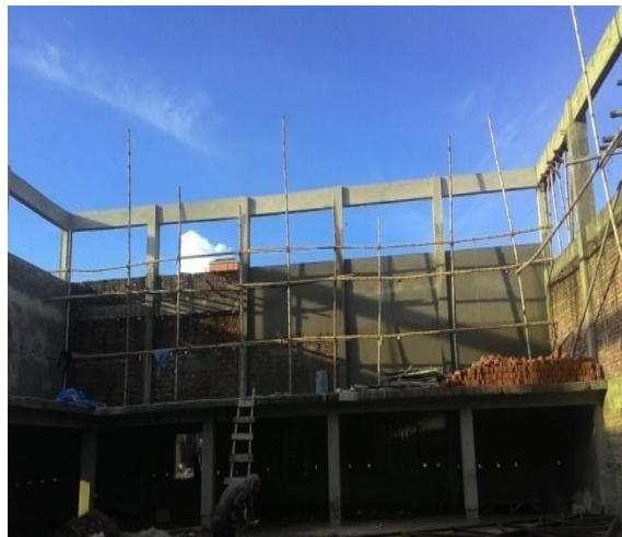
Dhaka STS-8 Hazaribag Matador