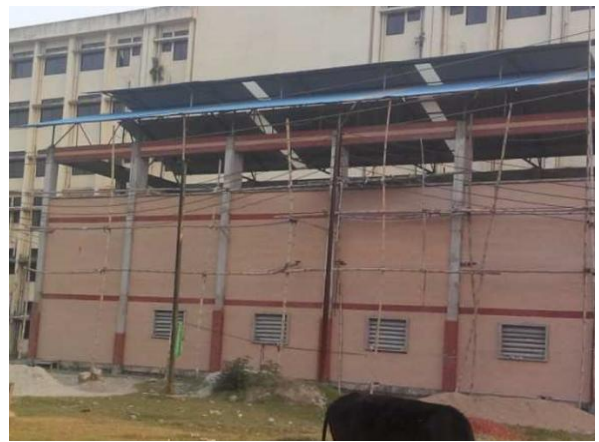
Khulna STS-5 250 Bed Hospital