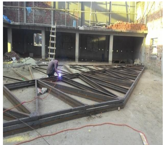
Dhaka STS-8 Hazaribag Matador