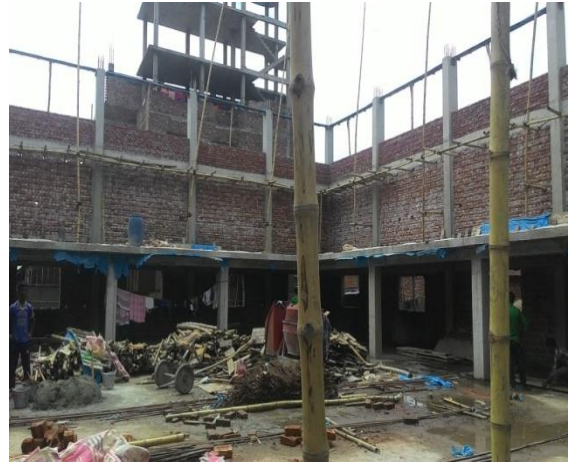
Dhaka STS-9 Jurain Kobosthan