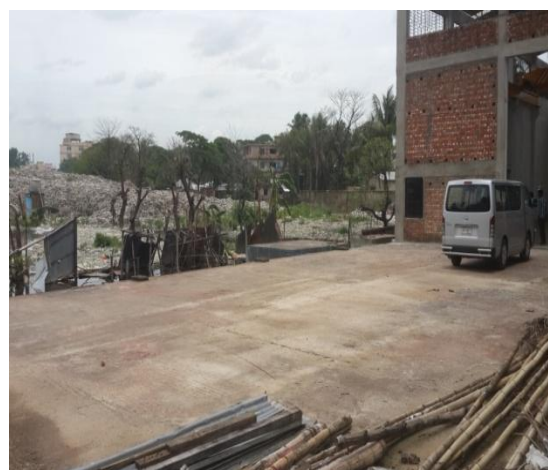
Chittagong STS-5 FIDC