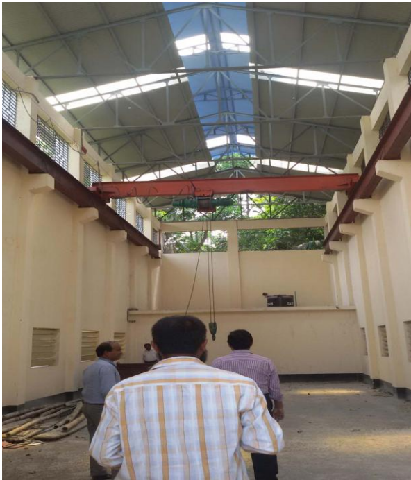
Chittagong STS-8 K-Block DT Road