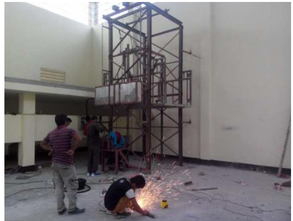
Khulna STS-7 Newsprint Mills BIDC