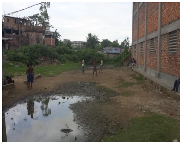
Chittagong STS-6 Airport Road