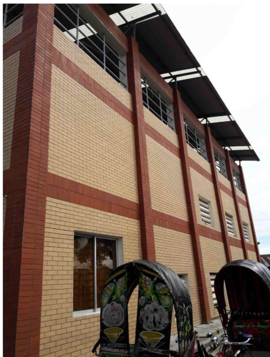
Barisal STS-1 Polashpur Bridge