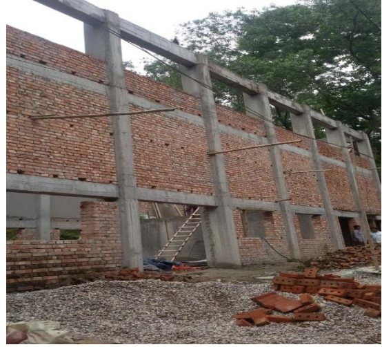
Chittagong STS-10 Tiger Pass