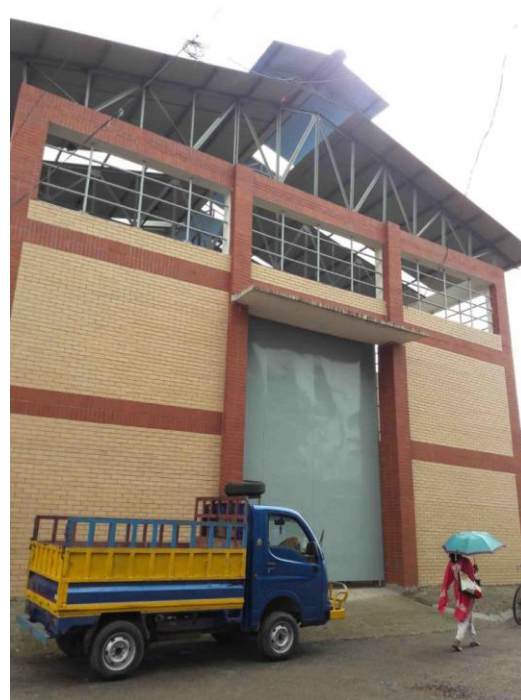
Barisal STS-1 Polashpur Bridge