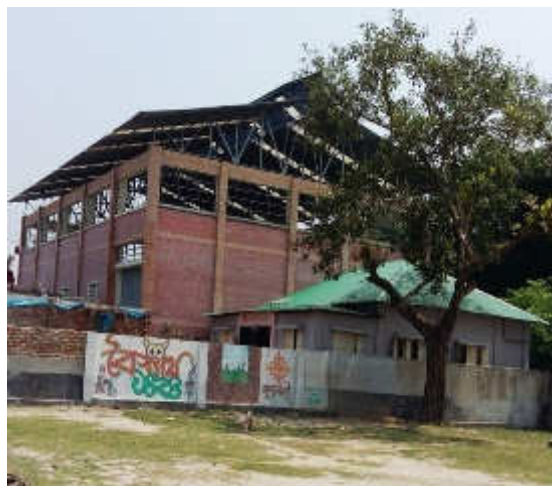
Khulna STS-7 Newsprint Mills BDC