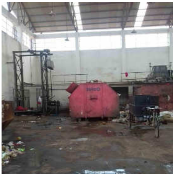
Dhaka STS-7 Hazaribag Progati