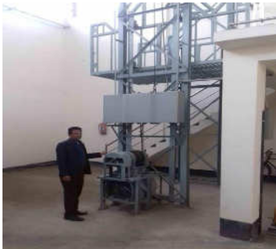
Barisal STS-1 Polashpur Bridge