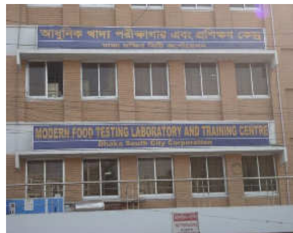
Dhaka DhakaFood lab& Training Center