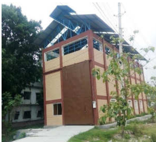
Rajshahi STS-3 Terokhadia