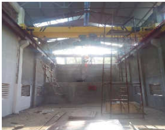
Chittagong STS-6 Airport Road