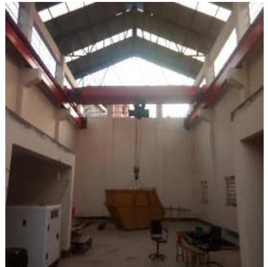
Dhaka STS-6 Dhalpur