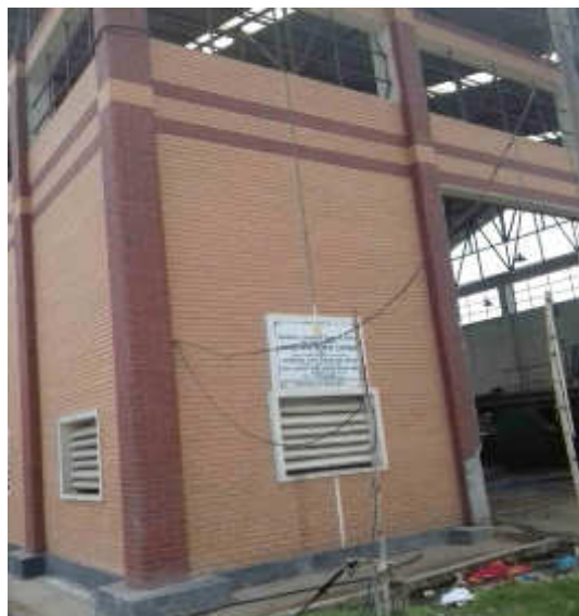
Dhaka STS-7 Hazaribag Progati