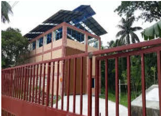
Rajshahi STS-2 Medical