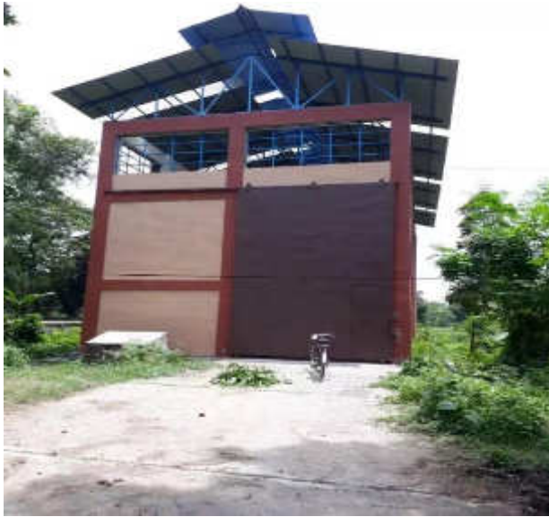
Rajshahi STS-1 Rokeya Hall