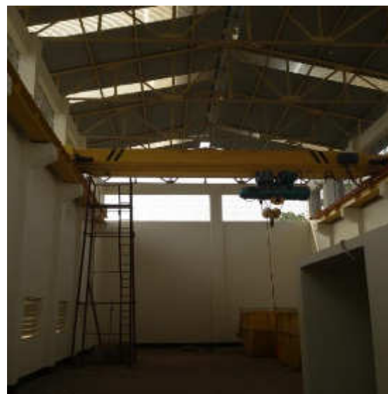
Chittagong STS-5 FIDC