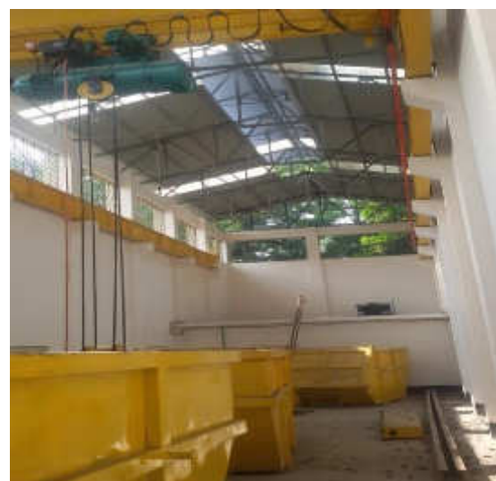
Chittagong STS-10 Tiger Pass