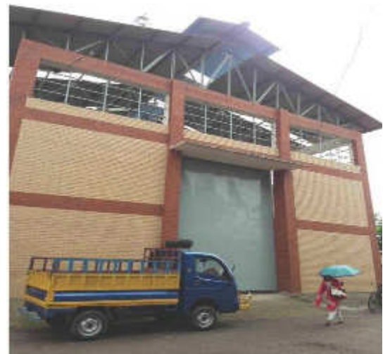
Barisal STS-1 Polashpur Bridge