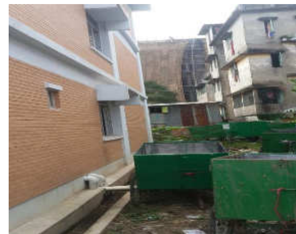
Chittagong Food lab