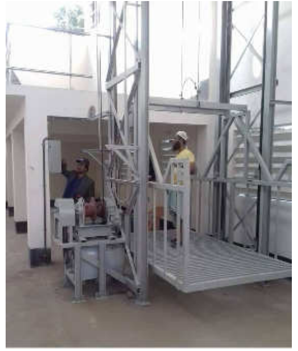
Barisal STS-3 North Alekanda