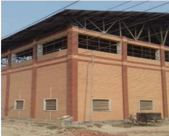
Dhaka STS-9 Jurain Koborsthan