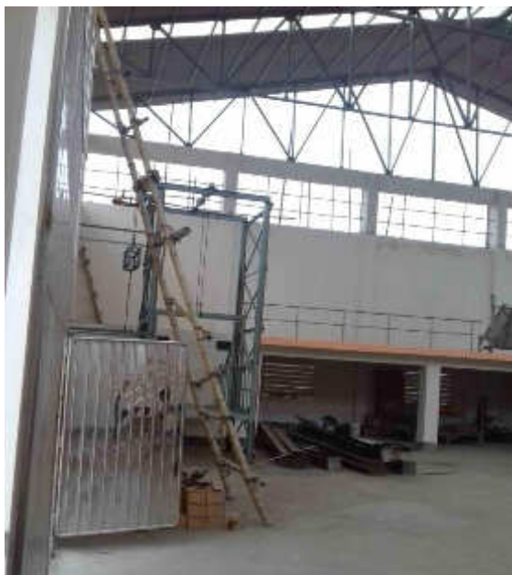
Dhaka STS-8 Hazaribag Matador