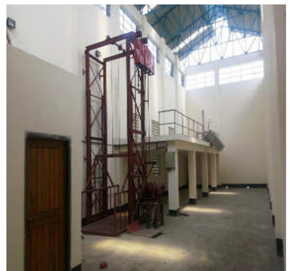
Rajshahi STS-3 Terokhadia