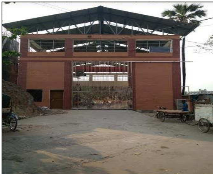
Dhaka STS-12 Dhaka University