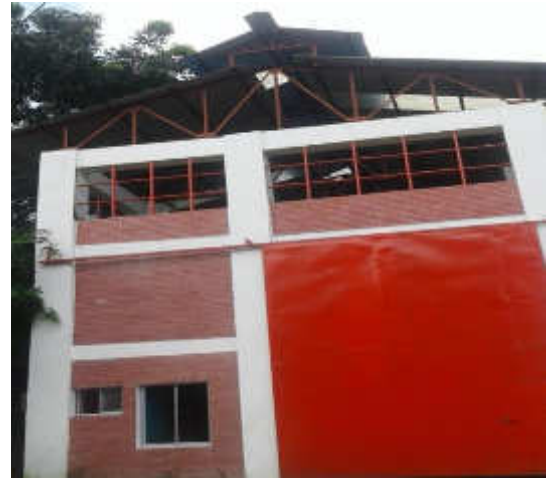
Sylhet STS-4 MC College