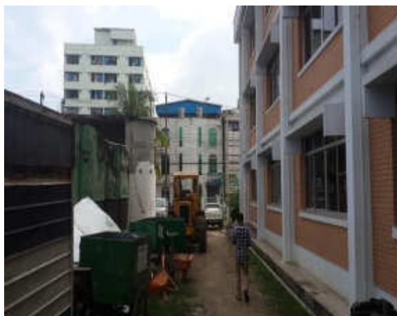
Chittagong Food lab