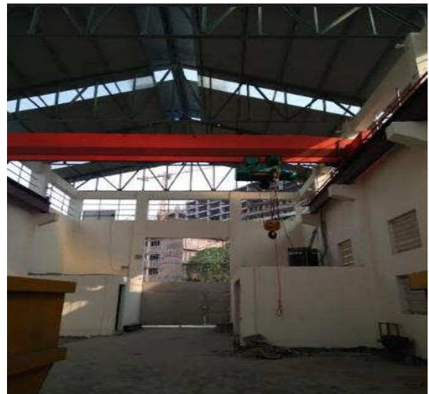
Dhaka STS-12 Dhaka University