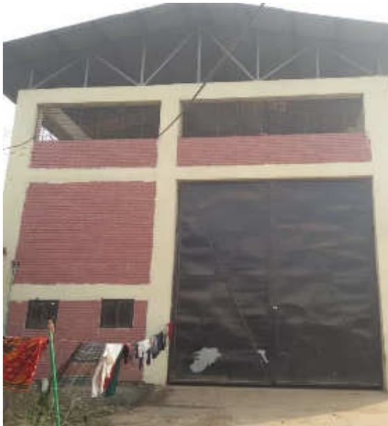
Chittagong STS-9 Port Connecting Road