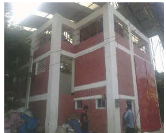
Sylhet STS-2 Shahi Eidgah