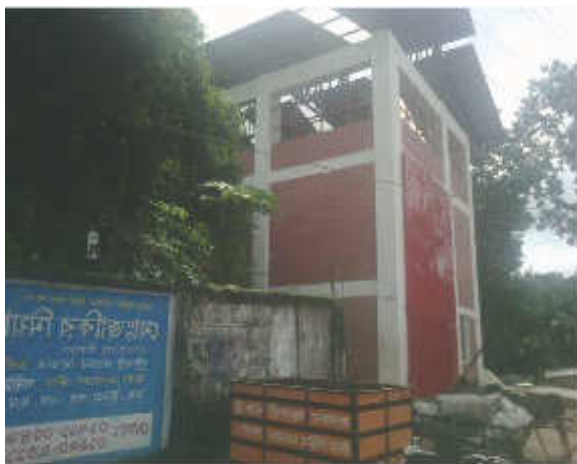
Sylhet STS-2 Shahi Eidgah