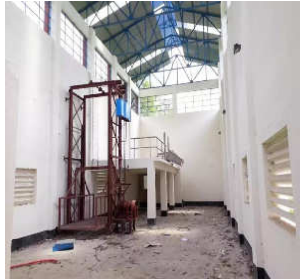
Rajshahi STS-1 Rokeya Hall