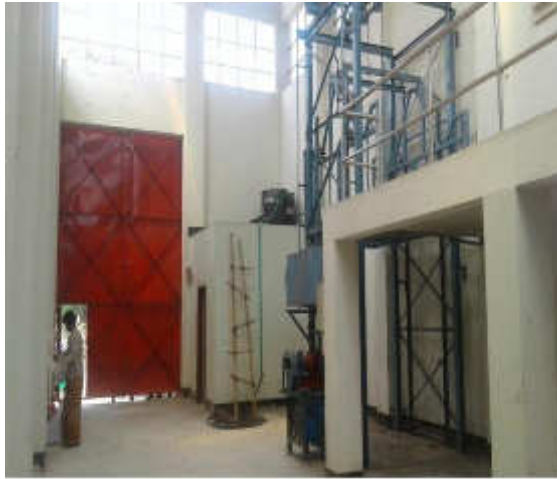
Sylhet STS-4 MC College