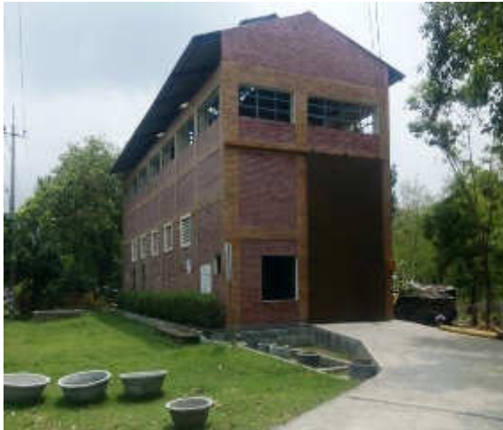
Rajshahi STS-6 Kajla