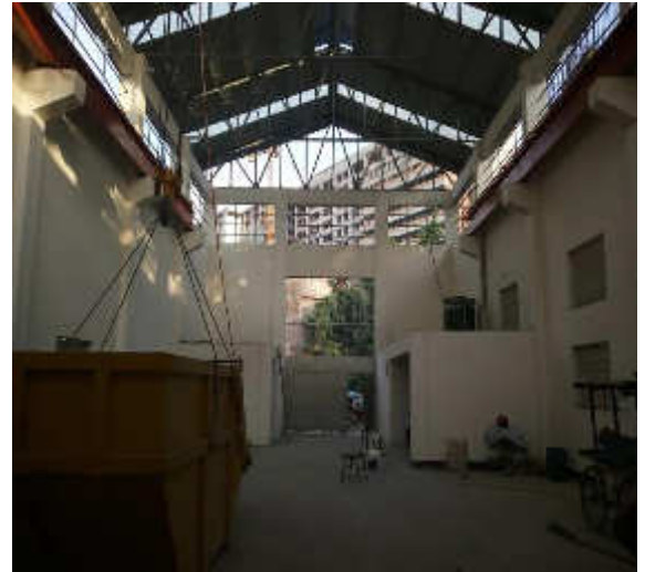
Dhaka STS-5 Sikder Medical Hazaribag