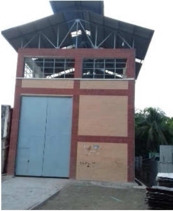
Barisal STS-3 North Alekanda