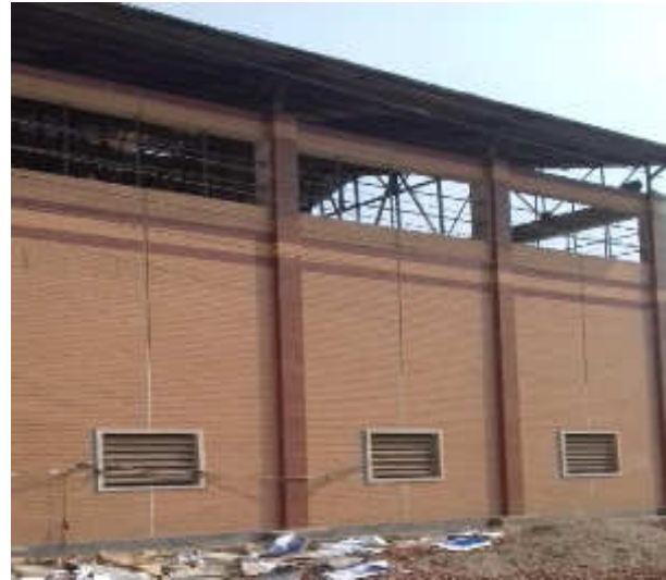
Dhaka STS-9 Jurain Koborsthan