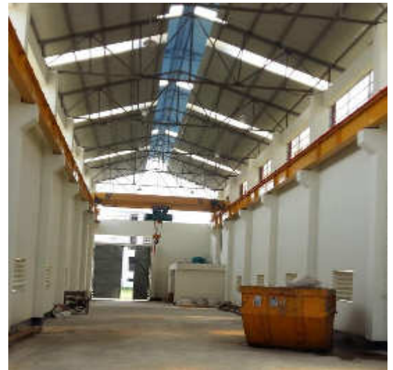
Khulna STS-5 250 Bed Hospital