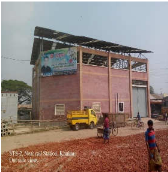
Khulna STS-2 Rail Station