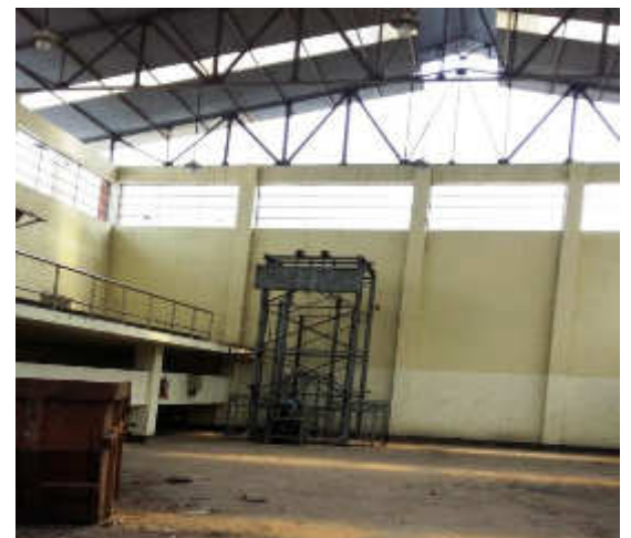
Khulna STS-7 Newsprint Mills BDC