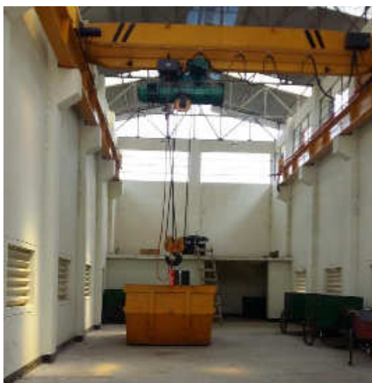
Khulna STS-8 New Market Khalishpur