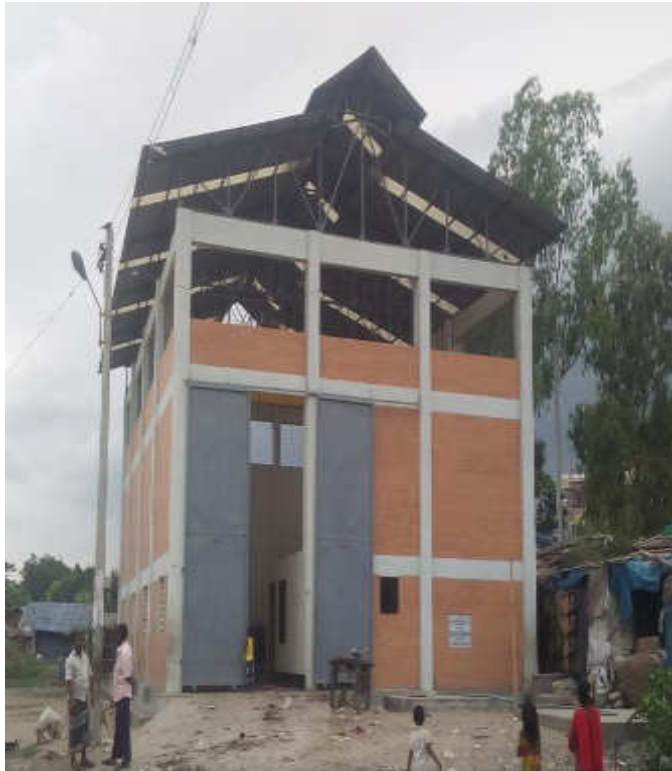
Chittagong STS-11 Nishkriti