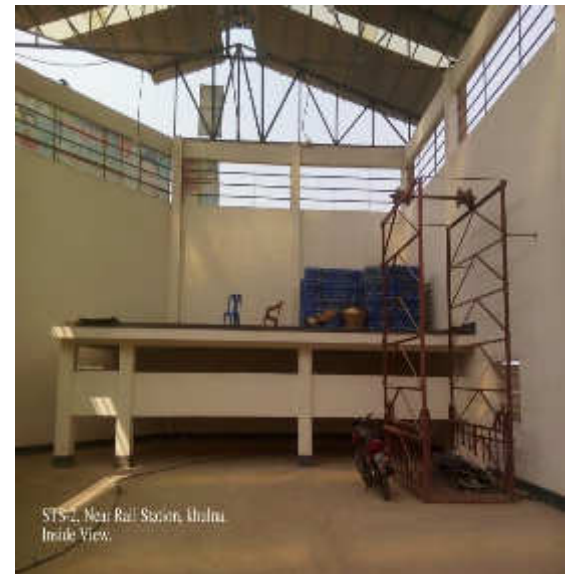
Khulna STS-2 Rail Station