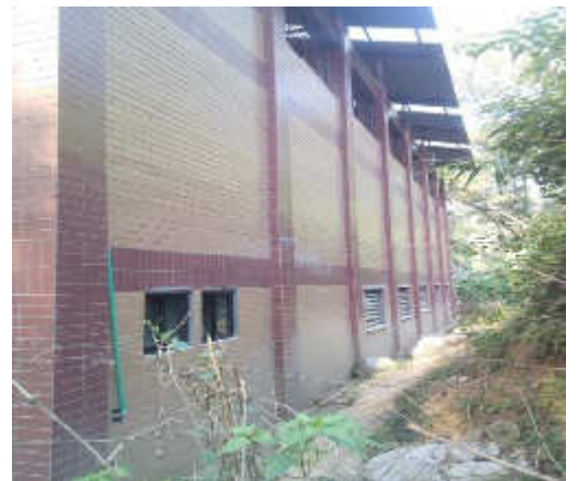
Chittagong STS-6 Airport Road