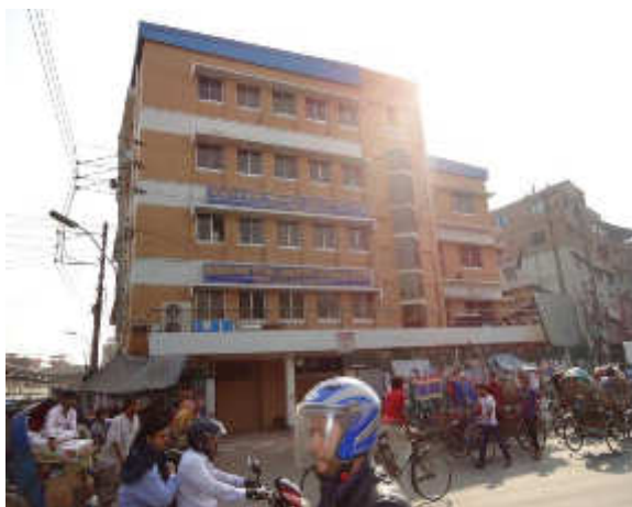
Dhaka Food lab& Training Center