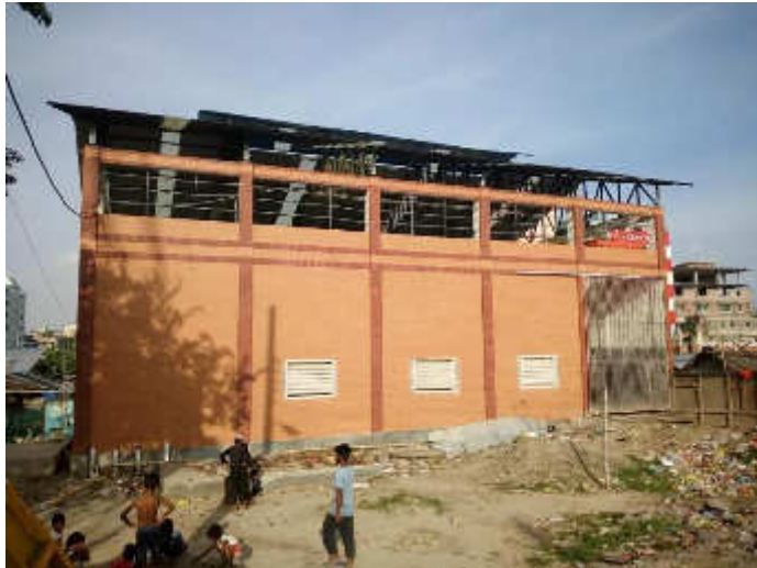
Dhaka STS-5 Sikder Medical Hazaribag