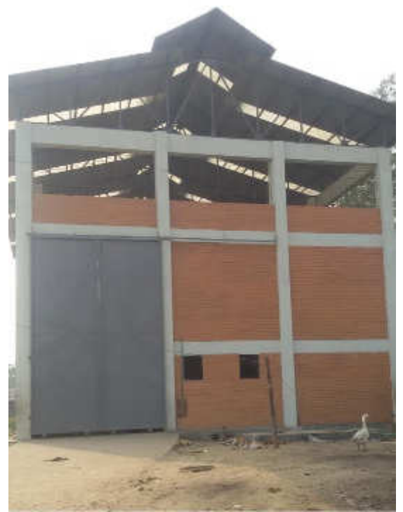
Chittagong STS-11 Nishkriti