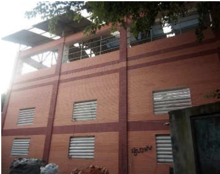
Dhaka STS-6 Dhalpur