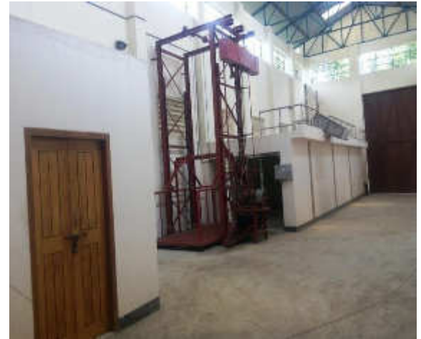
Rajshahi STS-6 Kajla