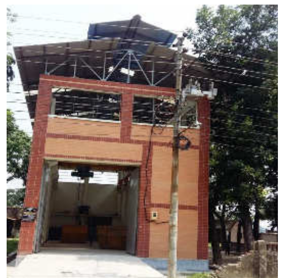
Khulna STS-8 New Market Khalishpur