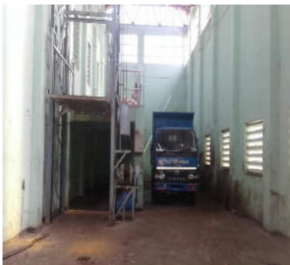
Sylhet STS-3 Rikabi Bazar