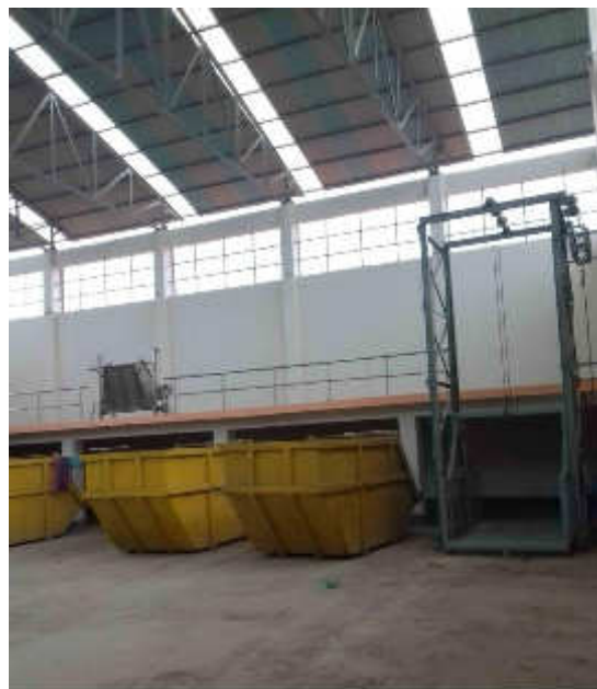
Dhaka STS-8 Hazaribag Matador