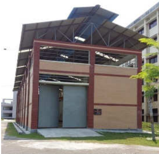
Khulna STS-5 250 Bed Hospital