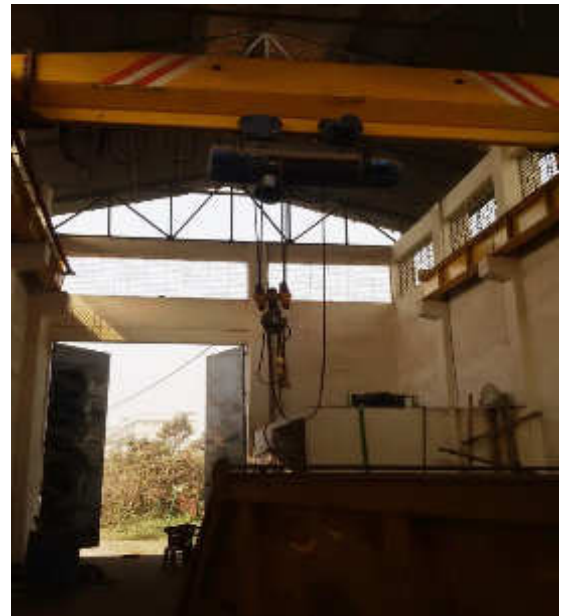
Chittagong STS-9 Port Connecting Road