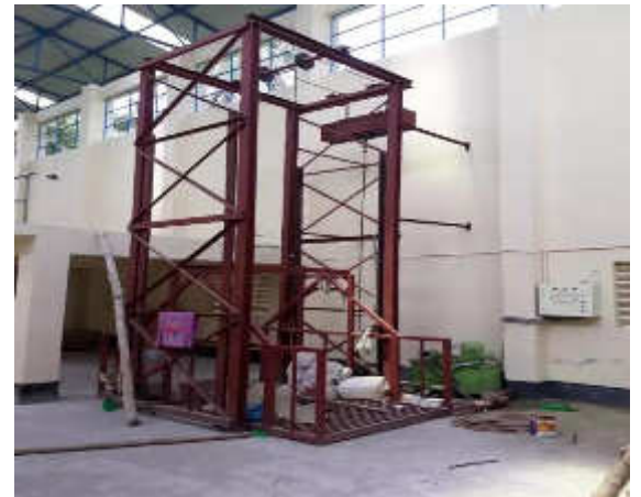
Rajshahi STS-2 Medical