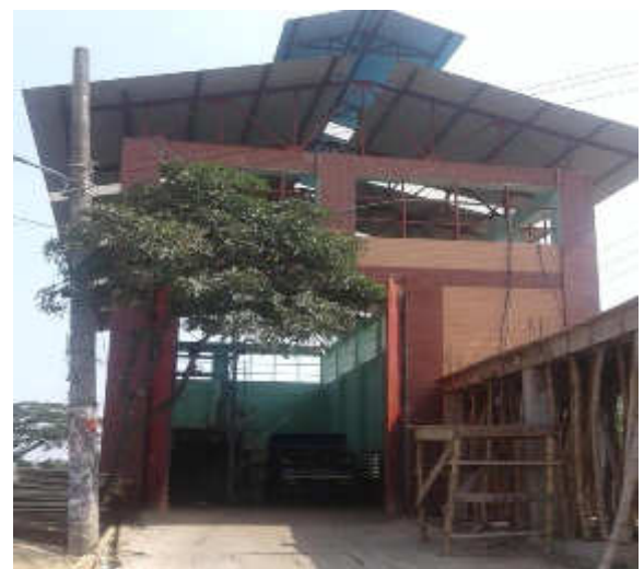
Sylhet STS-3 Rikabi Bazar