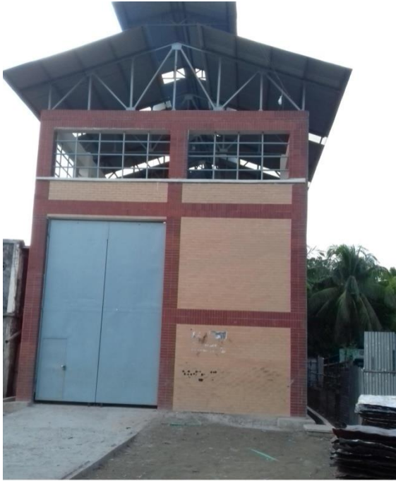
Barisal STS-3 North Alekanda