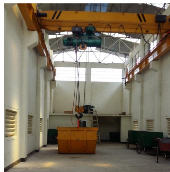
Khulna STS-8 New Market Khalishpur