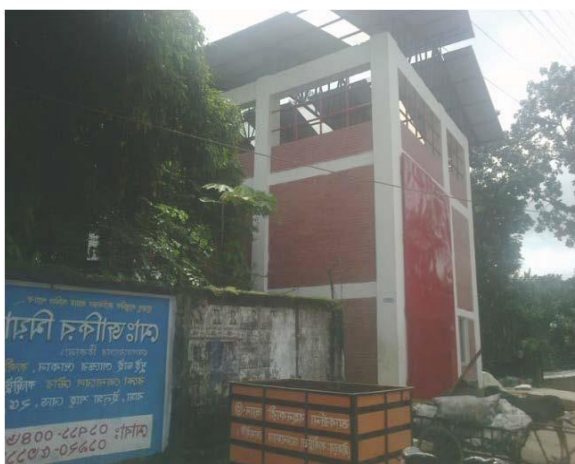
Sylhet STS-2 Shahi Eidgah