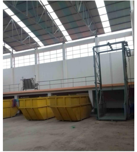
Dhaka STS-7 Hazaribag Progati