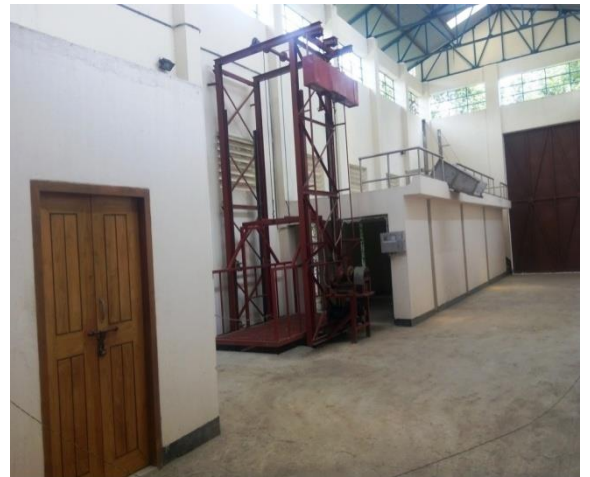
Rajshahi STS-6 Kajla