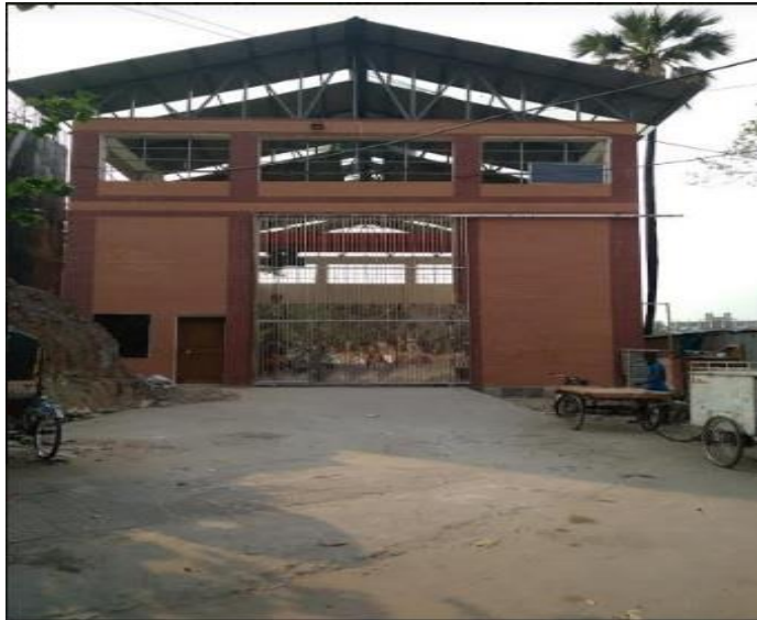
Dhaka STS-12 Dhaka University