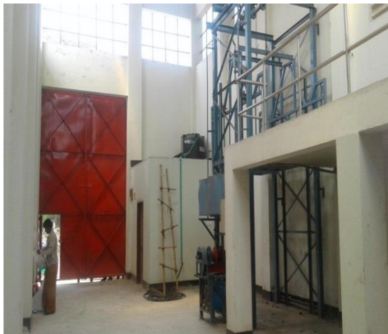
Sylhet STS-4 MC College