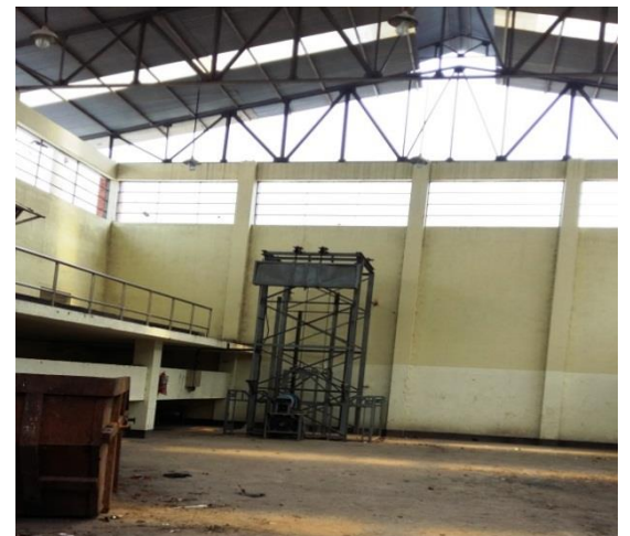
Khulna STS-7 Newsprint Mills BIDC