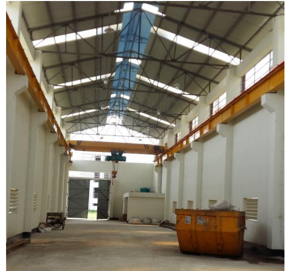
Khulna STS-5 250 Bed Hospital