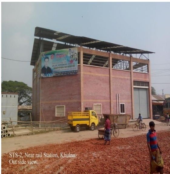
STS-2, Near rail Station, Khulna. Out side view.