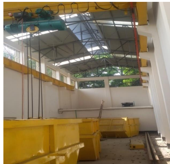
Chittagong STS-10 Tiger Pass