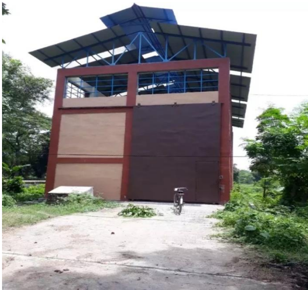
Rajshahi STS-1 Rokeya Hall