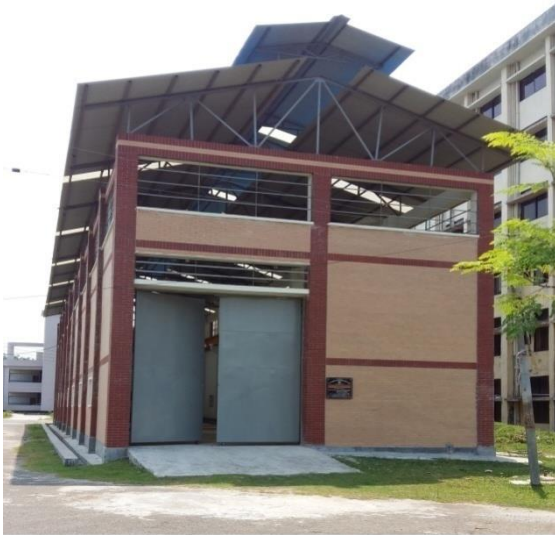
Khulna STS-5 250 Bed Hospital