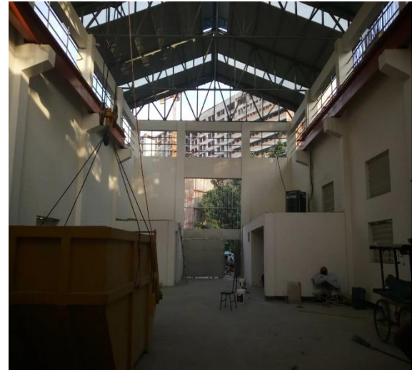
Dhaka STS-5 Sikder Medical Hazaribag