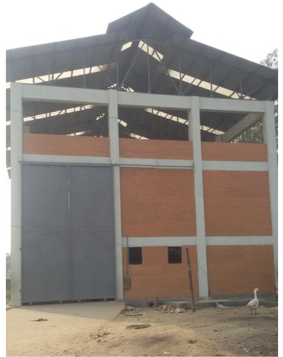
Chittagong STS-11 Nishkriti