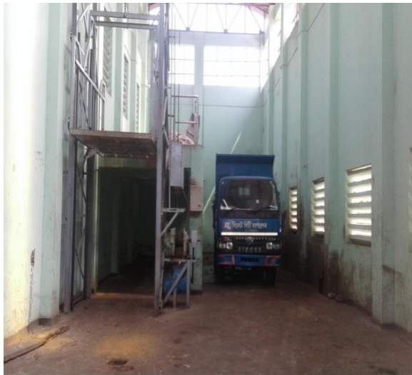
Sylhet STS-3 Rikabi Bazar