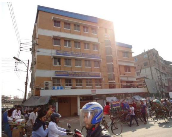
Dhaka Food lab& Training Center