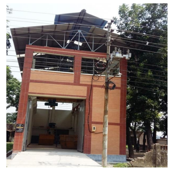
Khulna STS-8 New Market Khalishpur