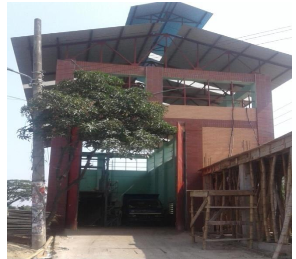
Sylhet STS-3 Rikabi Bazar