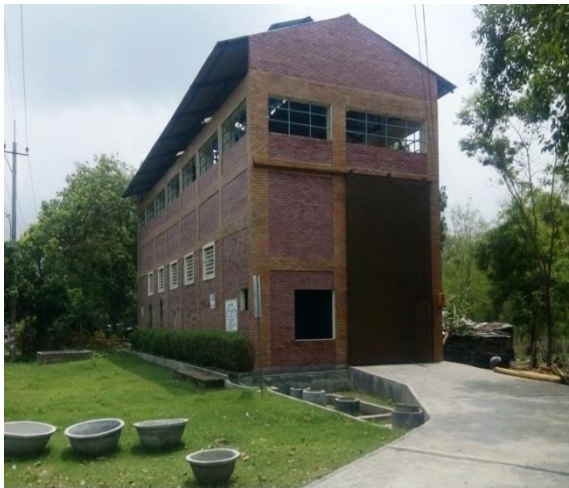
Rajshahi STS-6 Kajla