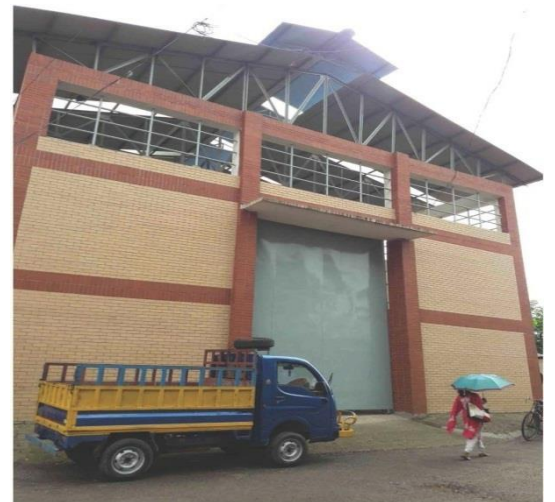
Barisal STS-1 Polashpur Bridge