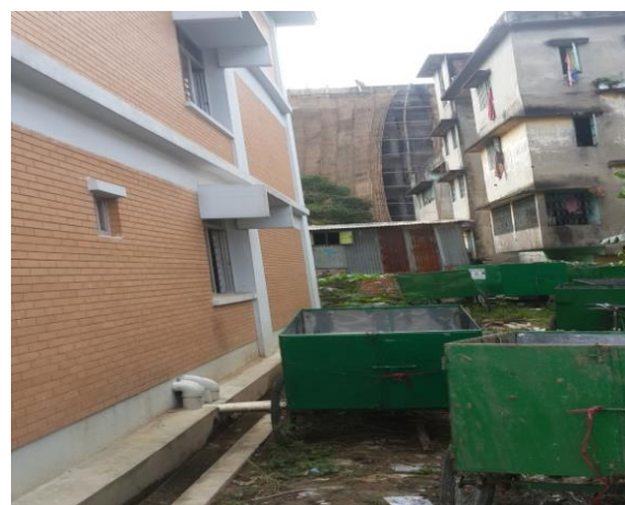
Chittagong Food lab