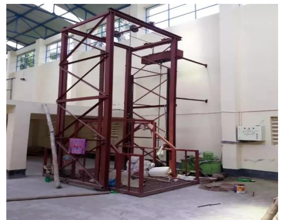
Rajshahi STS-2 Medical