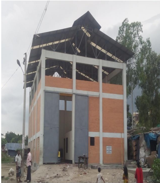
Chittagong STS-11 Nishkriti