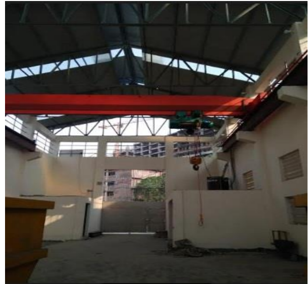
Dhaka STS-12 Dhaka University