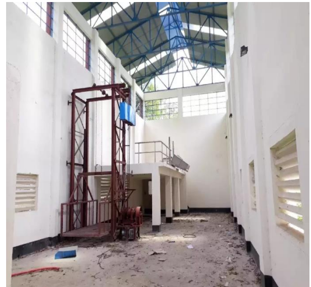
Rajshahi STS-1 Rokeya Hall