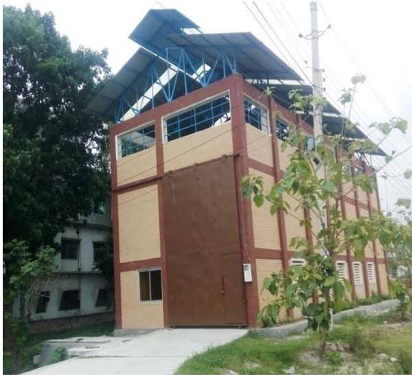
Rajshahi STS-3 Terokhadia