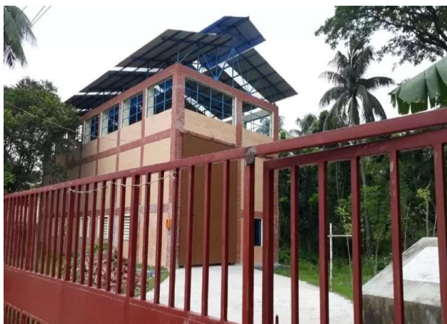
Rajshahi STS-2 Medical