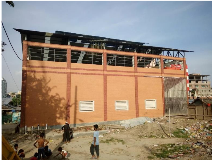
Dhaka STS-5 Sikder Medical Hazaribag