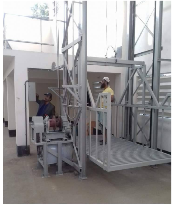
Barisal STS-3 North Alekanda