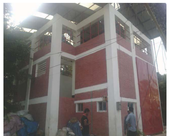
Sylhet STS-2 Shahi Eidgah