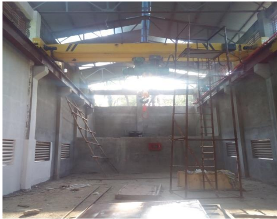
Chittagong STS-6 Airport Road