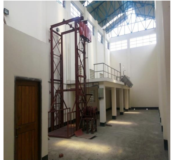
Rajshahi STS-3 Terokhadia