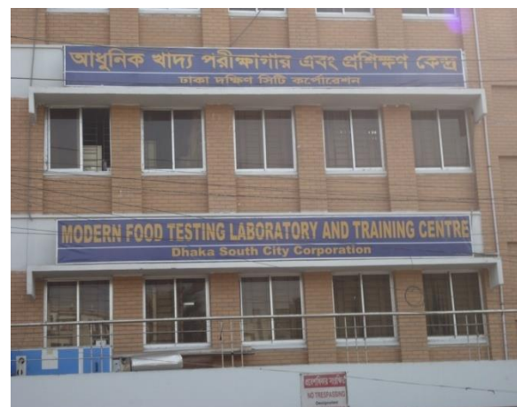
Dhaka Dhaka Food lab& Training Center