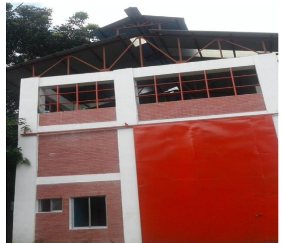
Sylhet STS-4 MC College