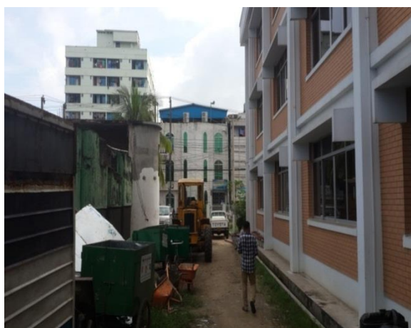
Chittagong Food lab