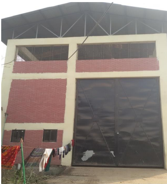
Chittagong STS-9 Port Connecting Road