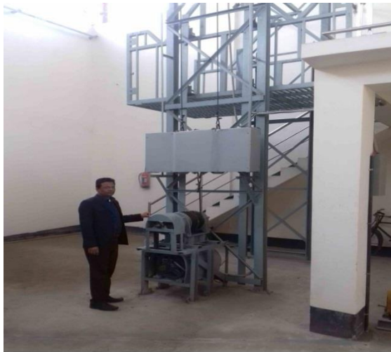
Barisal STS-1 Polashpur Bridge