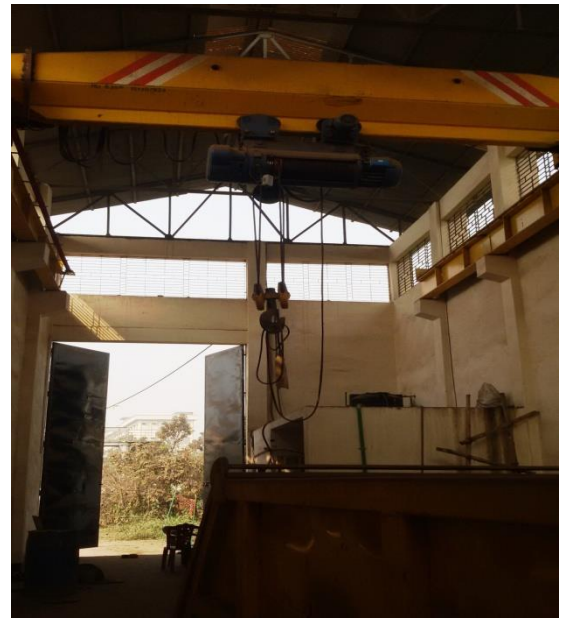
Chittagong STS-9 Port Connecting Road