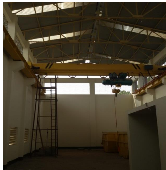
Chittagong STS-5 FIDC