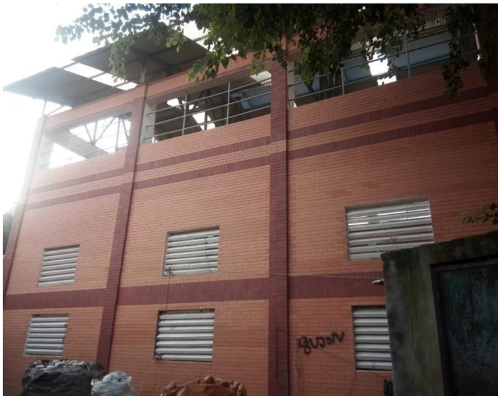
Dhaka STS-6 Dhalpur