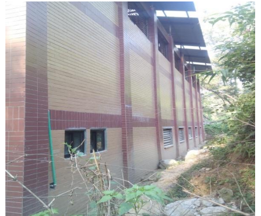
Chittagong STS-6 Airport Road