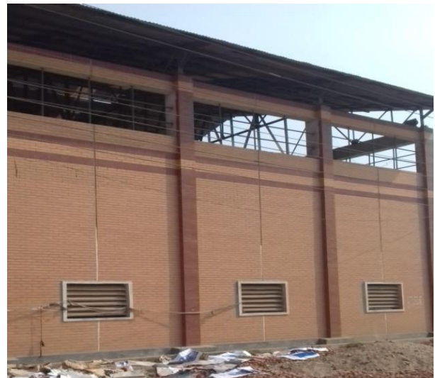
Dhaka STS-8 Hazaribag Matador