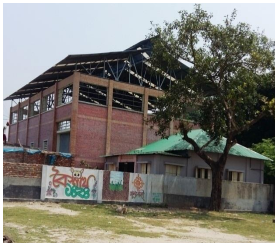
Khulna STS-7 Newsprint Mills BIDC