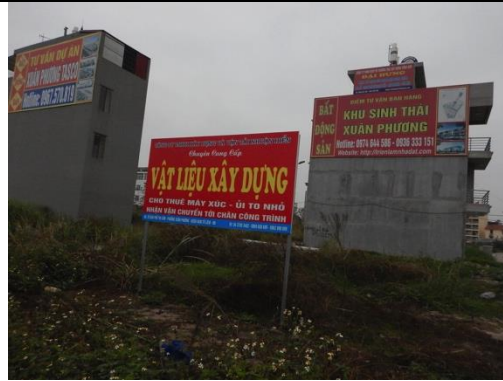
Advertisement for construction materials at Xuan Phuong Relocation Site