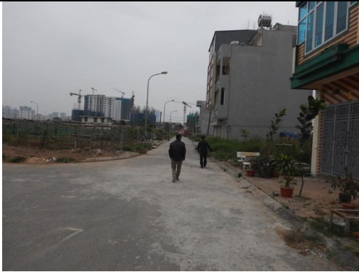
Searching for AHs at Xuan Phuong Relocation Site