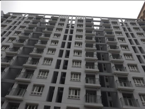
Dong Da District Relocation Apartment