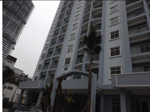
Cau Giay District Relocation Apartment