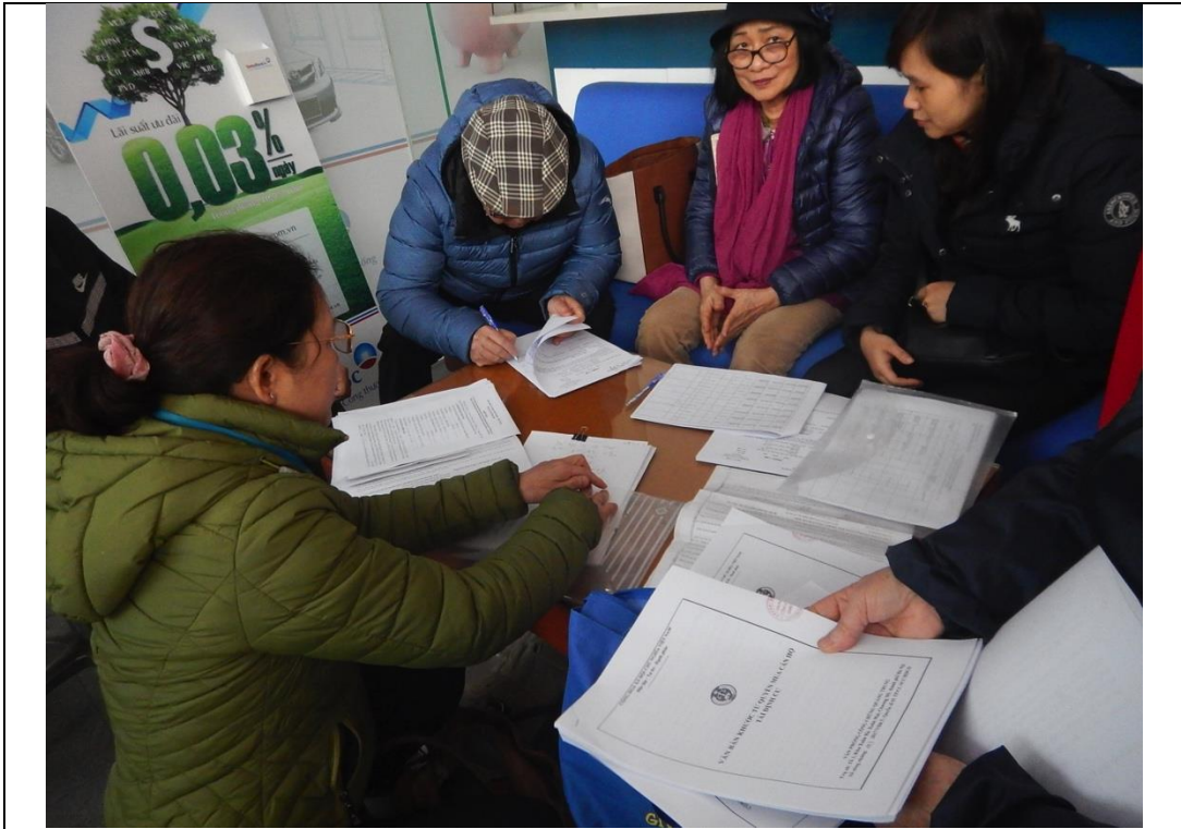
APs from S10 and S11 signing payment contracts before receiving their compensation at Vietin Bank