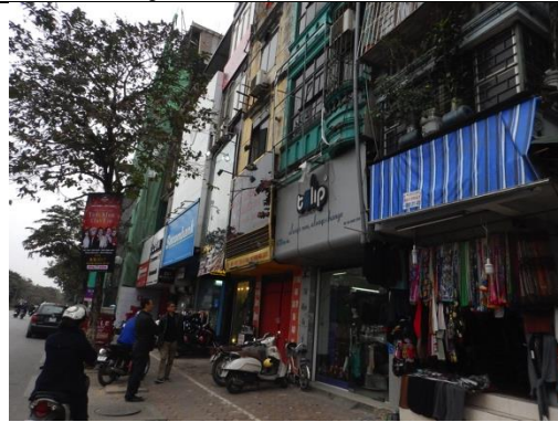
Affected shops in S9