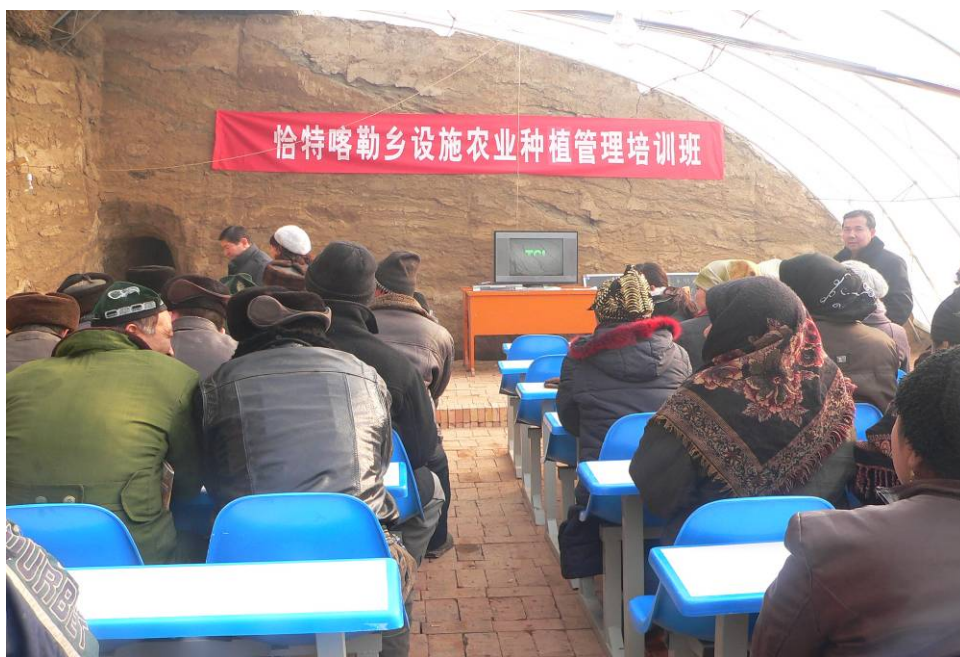
Picture 3-6 Agricultural planting skill training for local ME