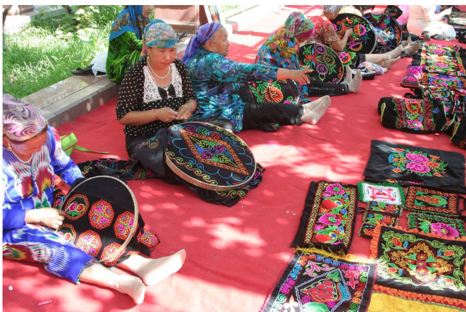
Picture 3-4 Handcraft Training for Female EM

39. Since the dependency of women on land is higher than men and the education level of women is lower than men, the construction departments tried to provide appropriate jobs for women in privilege to increase their income.