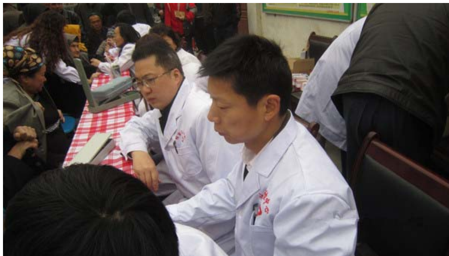
Picture 3-1 The staffs from Turpan CDC are promoting epidemic disease prevention knowledge

and control management system; strengthen the construction of AIDS/STD prevention mechanism; improve the specialist is responsible for HIV initial screen laboratories and epidemic network management. Regular AIDS/STD tests are held to new workers in the construction site, and face-to-face explain AIDS/STD prevention knowledge for them in order to improve their awareness and self-protection capability of AIDS/STD prevention.