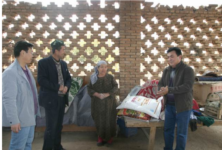
Picture 3-5 Turpan Civil administration staffs visit affected valuable groups