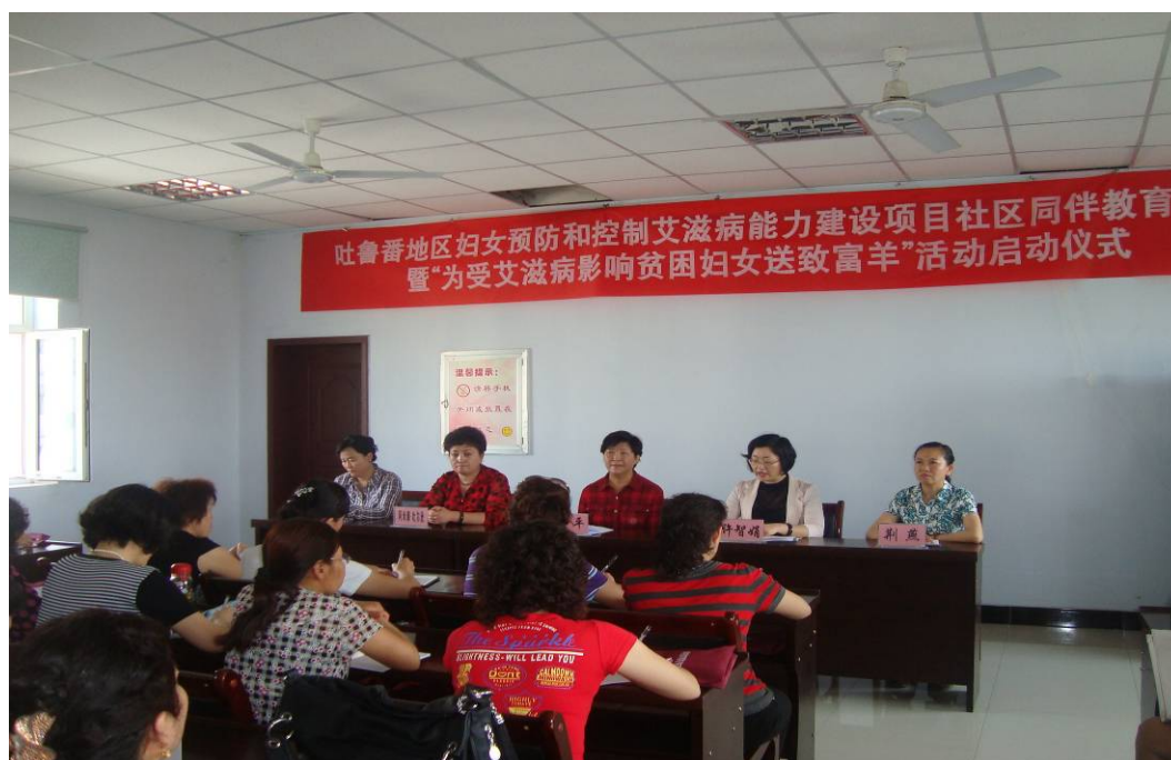
Picture 3-2 The promoting activity held by Turpan women's federation