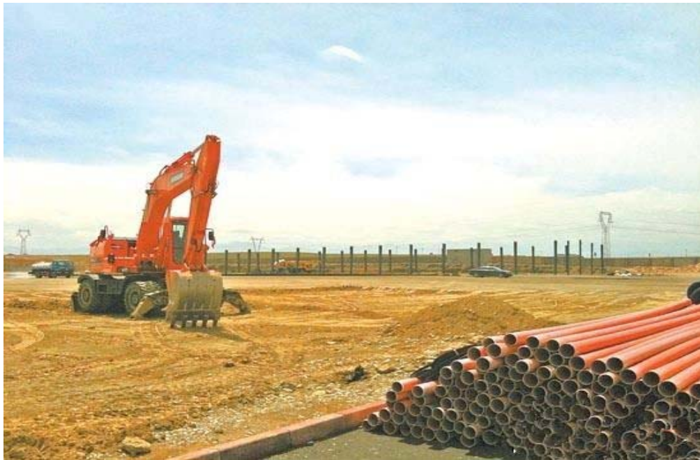
Picture 3-7 The local materials placed Road construction site