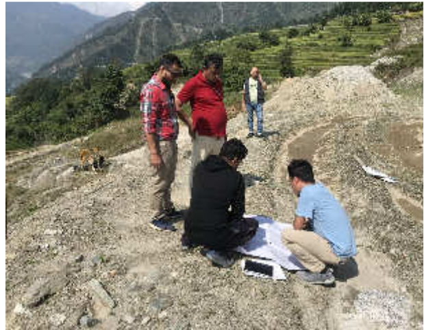
Plate 1 &amp; Plate 2: Site visit and construction measurement in Barhabise SS