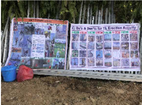
Plate 29: Do's &amp; Don'ts in TL erection