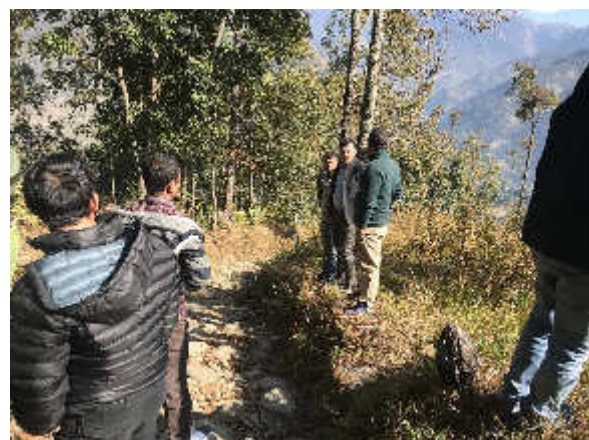
Plate 14: Consultation with PAFs (AP 5/0)