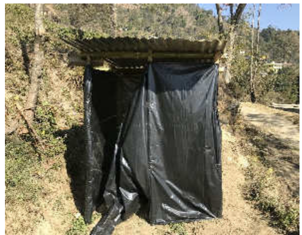
Plate 34: Toilet for labor at AP 13/0