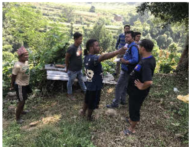
Plate 5 &amp; Plate 6: Public Consultation/PAFs informal discussion in Mandan Deupur Municipality, Kavrepalanchowk