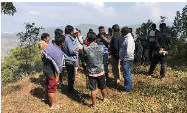
Plate 15: Road issue discussion with PAFs, contractors &amp; ward chairperson in Thulo Sirubari