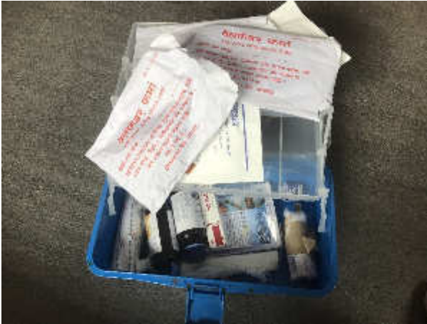
Plate 41: First Aid kit box in Barhabise SS