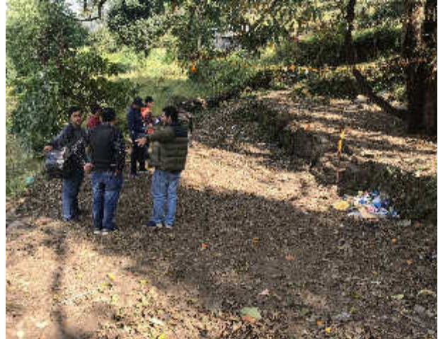
Plate 18: CSR activities discussion in Irkhu