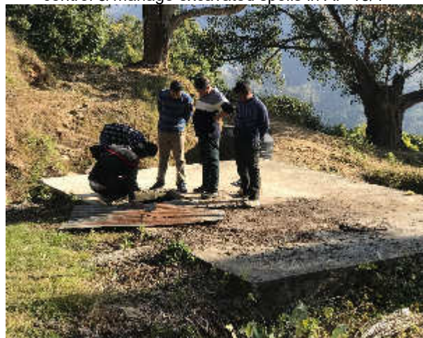
Plate 38: CSR activities survey along with PAFs in Chautara Sangachokgadi -13, Thulo Sirubari