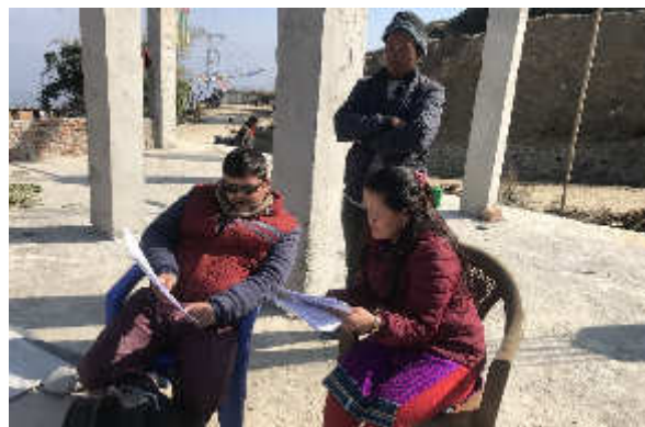
Plate 26: RP HH Survey questionnaire orientation at Mandan Deupur Municipality, ward no. 1