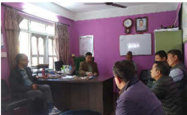
Plate 16: Project discussion in Balephi RM with Balephi RM chairperson, ward chairpersons &amp; project officials