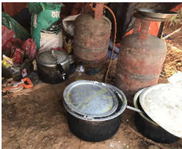
Plate 33: Kitchen for labor at AP 40/0