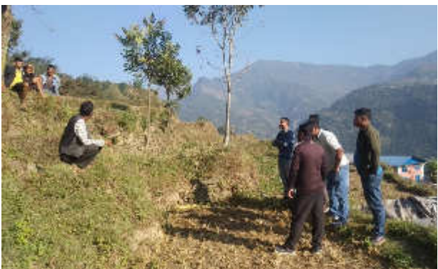
Plate 9: Consultation with PAFs (AP 13/0)