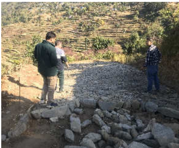
Plate 37: Monitoring &amp; inspection of CSR activities in Chautara Sangachokgadi -8, Irkhu