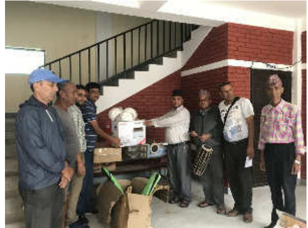
Plate 42: CSR activity; Educational material handing over in Namuna Sunakhani Aadharbhut School Barhabise SS area