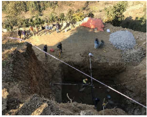
Plate 20: Tower foundation work in progress (AP 30A/0)