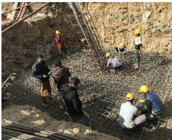
Plate 23: Tower foundation work inspection & monitoring (AP 13/0)