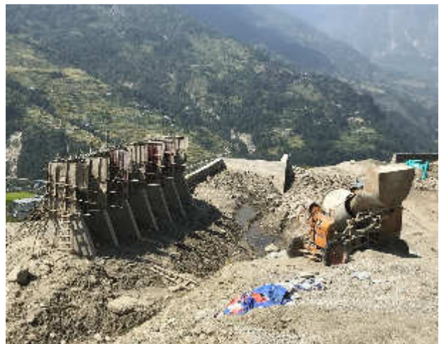
Plate 3 &amp; Plate 4: Counterfort wall in Barhabise SS