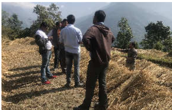
Plate 10: Location visit &amp; PAFs consultation (AP 11/0)