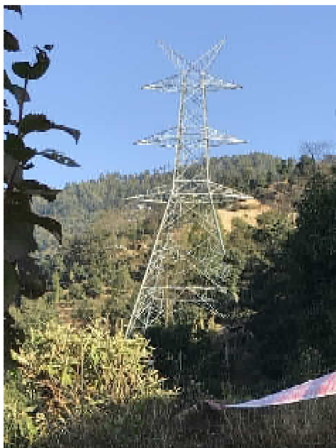
Plate 27: Tower erection in AP 30/1