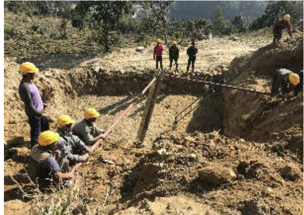
Plate 30: Tower foundation work in progress (AP 15/0)