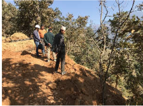
Plate 36: Instruction to contractor &amp; sub-contractor to control &amp; manage excavated spoils in AP 13/1