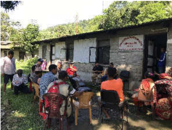
Plate 43: GRC meeting in Balephi RM -8