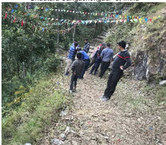
Plate 39: CSR activities survey along with PAFs in Chautara Sangachokgadi -13, Thulo Sirubari