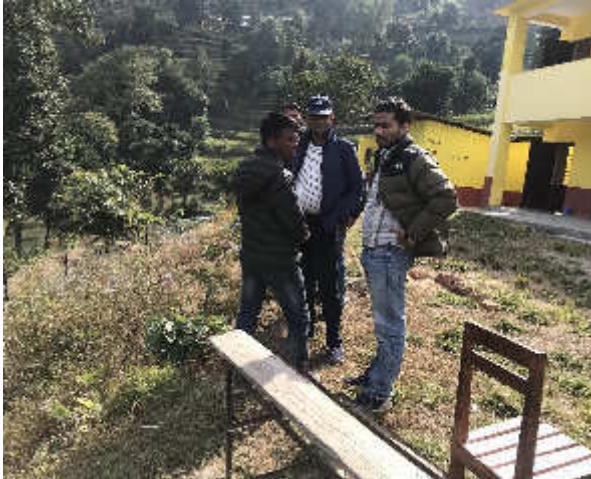
Plate 17: CSR activities discussion in Irkhu