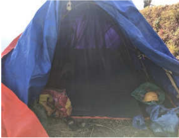
Plate 35: Labor camp at AP 13/1