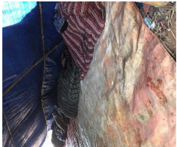
Plate 32: Labor camp at AP 40/0