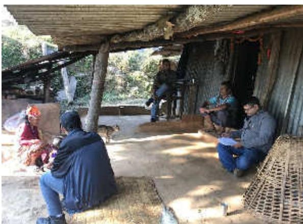
Plate 13: Consultation with PAFs (AP 22/0)