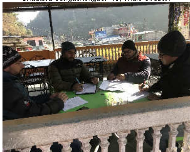
Plate 40: Monitoring visit &amp; issues discussion with PMD officials