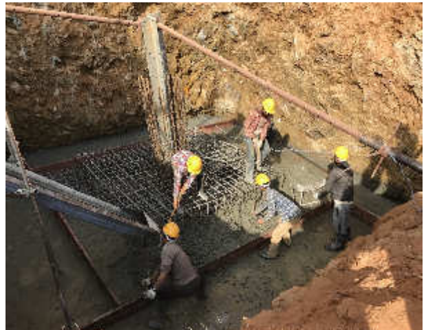
Plate 22: Tower foundation work in progress (AP 13/1)