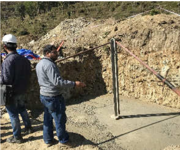
Plate 19: Tower foundation work in progress (AP 13/0)