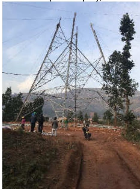
Plate 28: Tower erection in AP 41/0