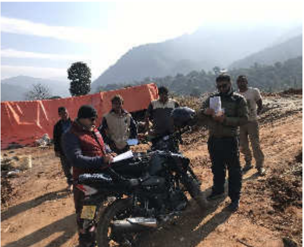
Plate 21: Labor camp monitoring & first kit inspection (AP 40/0)