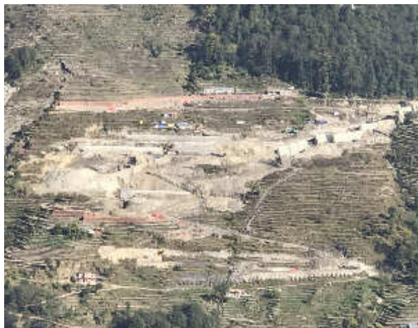
Plate 24: Barhabise SS view from Ramche