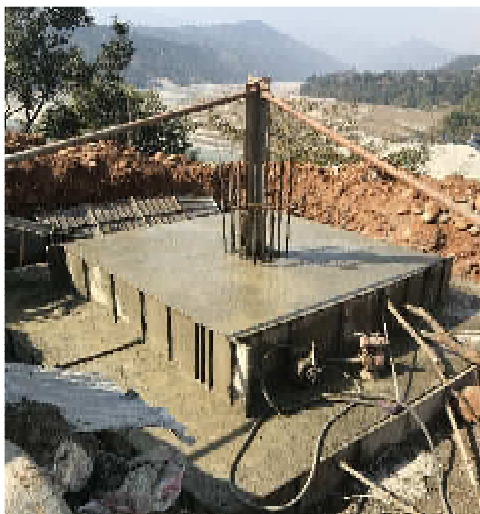
Plate 31: Tower foundation work in progress (AP 40/0)