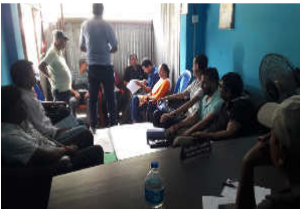
Plate 45 &amp; 46: PAFs &amp; GRC members informal discussion in Balephi RM- 07