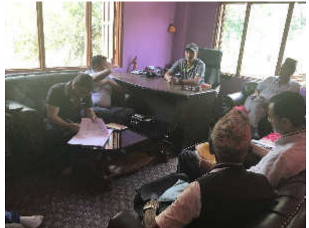
Plate 44: GRC meeting in progress in Balephi RM-05