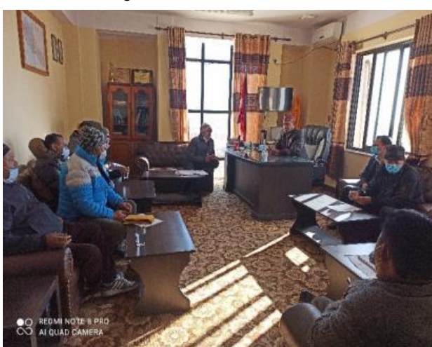
5. CDC meeting at DAO Dolakha