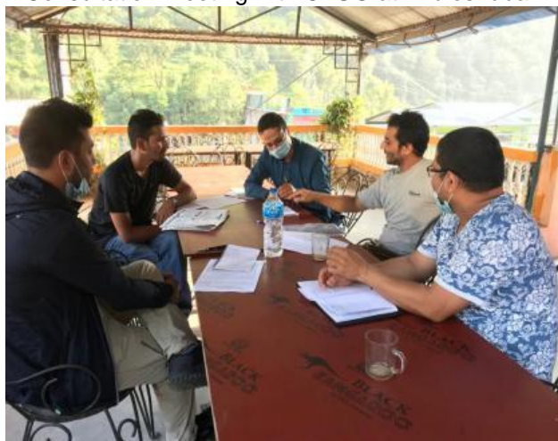
9. Consultation with Household surveyer staffs