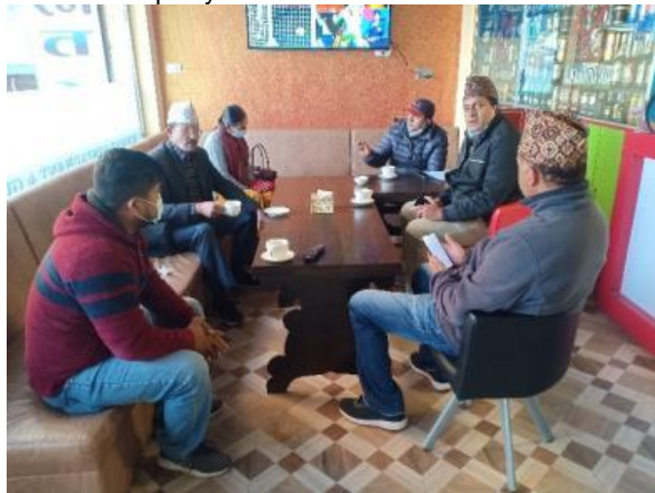
2. Meeting with President and Vice-President of Melung Rural Municipality