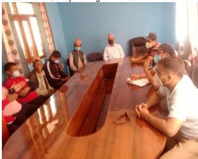
10. Consultation with Ward Chairperson & Youth Club at Irkhu