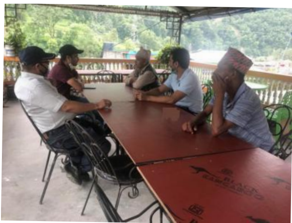
1: Consultation with CFUG at Balephi-5