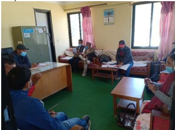
1. Meeting with local level representative about compensation amount