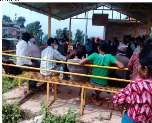
12. Consultation with PAFs/CFUG at Thulosirubari Area