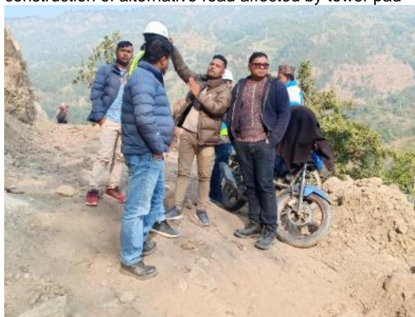
4. Discussion with Ward Chair and locals about construction of alternative road affected by tower pad