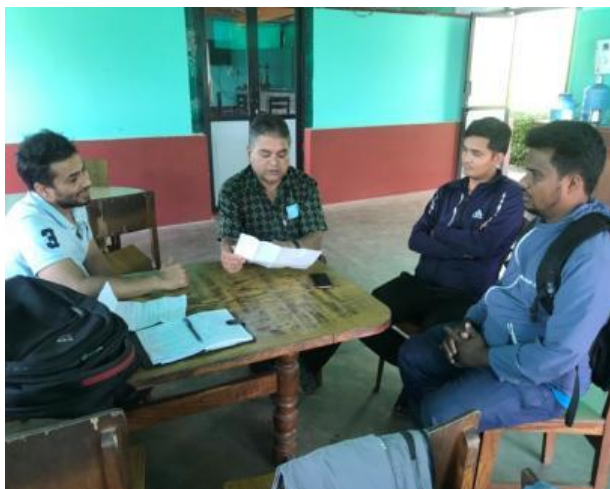
2: Consultation and Discussion with Ward Chairperson for CSR works at Thulosirubari-13.