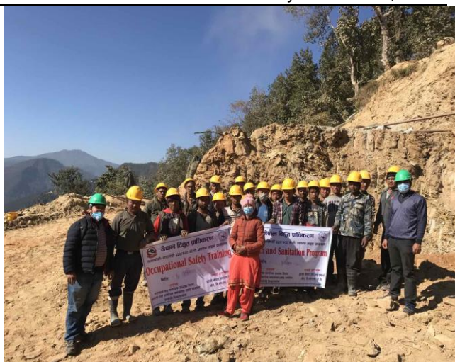
8. Health and Safety training at AP21/0