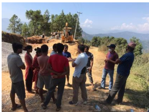
11. Discussion with PAFs for protection wall at AP34/0