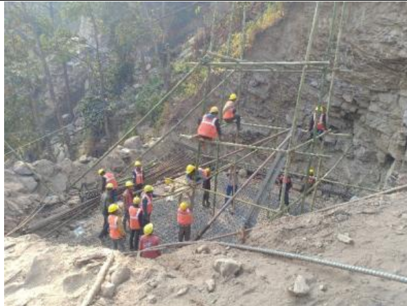
10. Stockpiling of tower material in storage yard