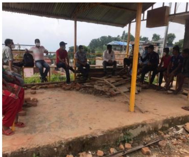
7: Consultation meeting with CFUG at Thulosirubari