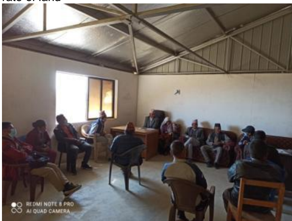
3. Meeting with locals at Lakuridanda-9 regarding local rate of land