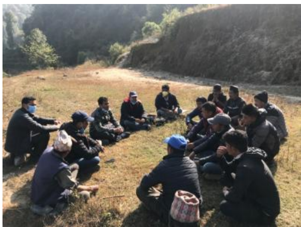
3: Consultation with PAFs at Mandan Deupur-1