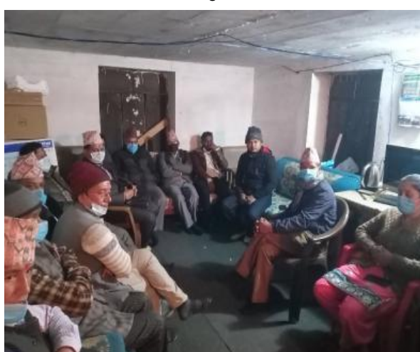
6 GRC formation at Melung RM Ward – 1