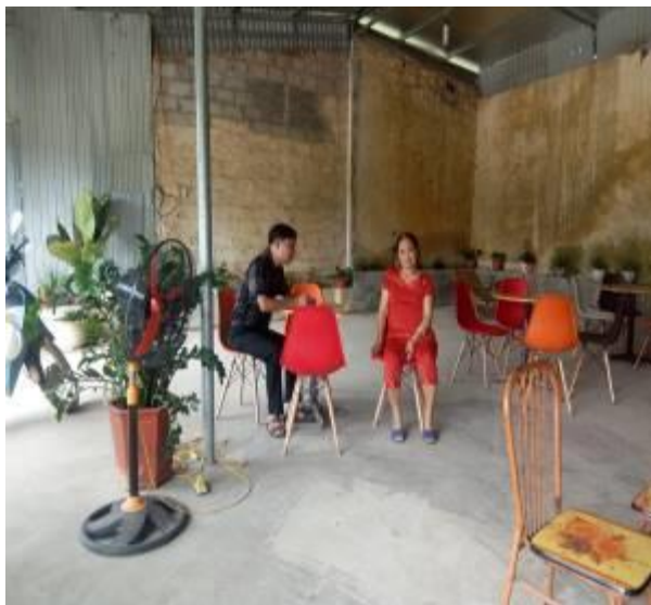
Interview AHH in Quyet Thang commune