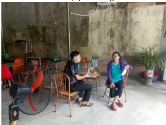
Interview AHH in Quyet Thang commune