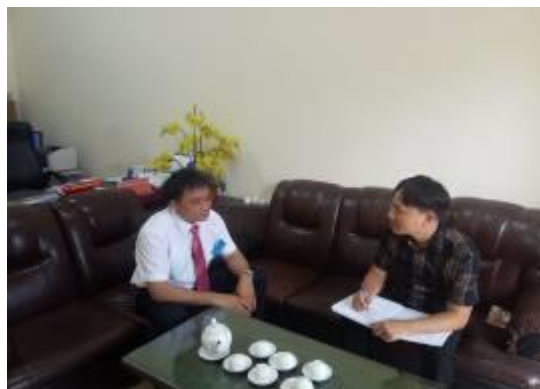
Interview Vice chairman of Phuc Triu commune