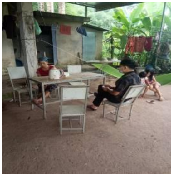
Interview AHH in Phuc Triu commune