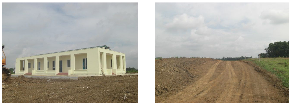
Figure 3: Temporary Office for USTH-PMU and earth road surrounding the USTH

22. Expectedly, during the 3 rd Quarter 2014 PMU-USTH shall implement packages on the construction of fence and road surrounding the clean land.