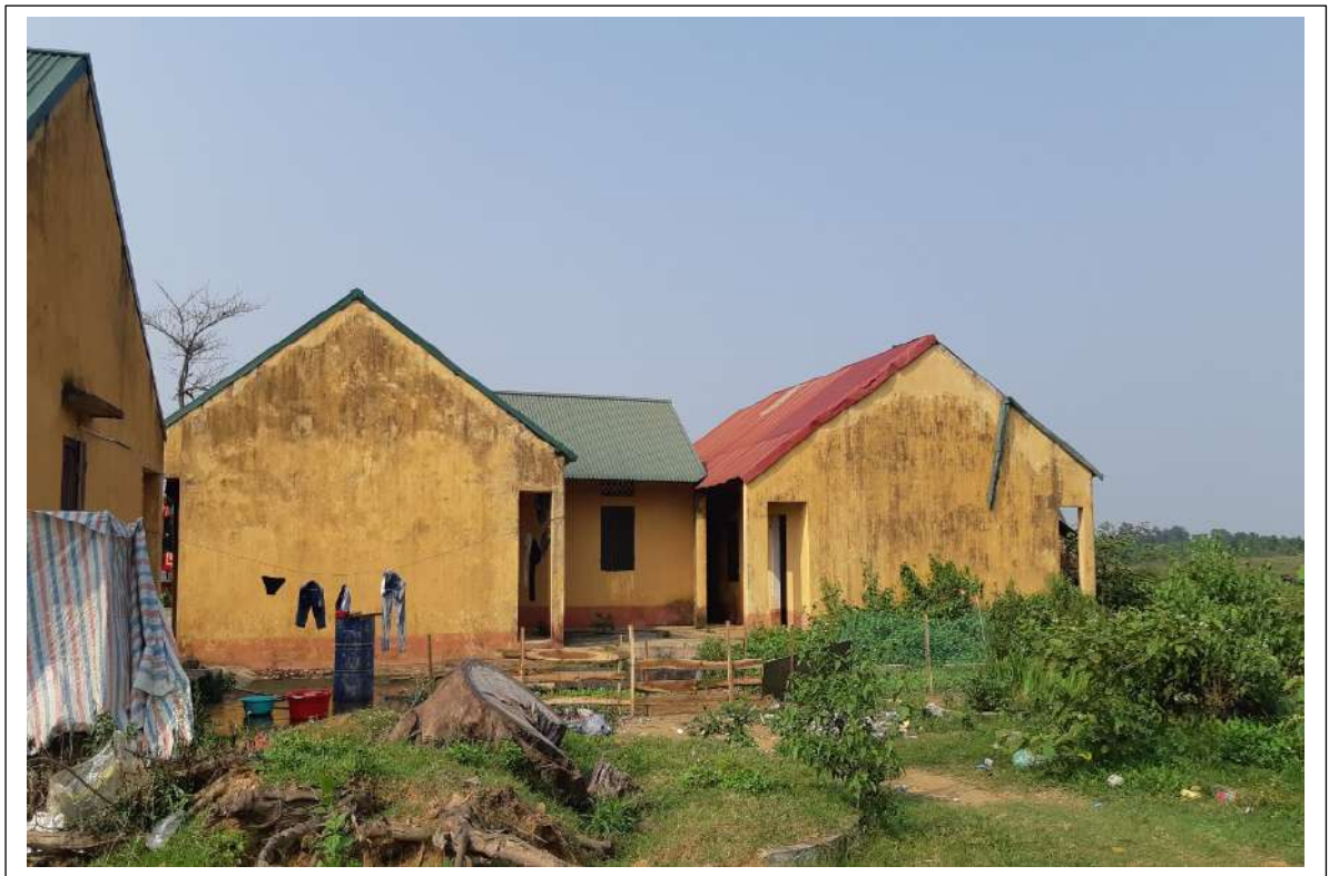
Figure 5: The head-office of Artillery Command No. 371 has been completely moved out.

9. At the Army resettlement site: The Artillery Command have conducted to simultaneously construct a number of works such as fence, houses, armory... in the entire 52.7 ha of land for the purpose of speeding up the progress. Such this simultaneous construction shows that their building of new barrack is rushing to be completed so that 02 military units can be soon hand over the clean land to USTH project. As of Q2/2019, the construction of whole barracks was completed and transfer of military was done. Some photos taken at the project site are as bellows: