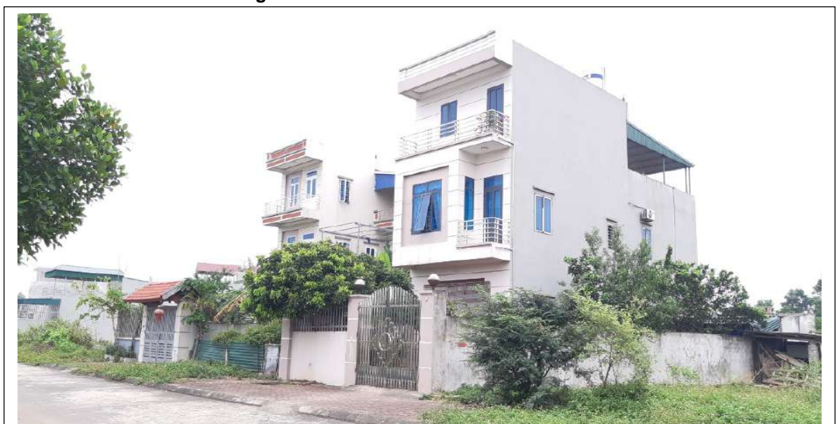
Figure 2: New houses in the relocation area

- By now, the AHs are building new houses inside the new relocation area of 36,04 ha on the south of Road No. 84. The last AH has received 02 land lots (120m 2 /plot) in the new relocation area and compensation of 1.520.993.950 VND (over 1.5 billion VND). The compensation and assistance were completed.