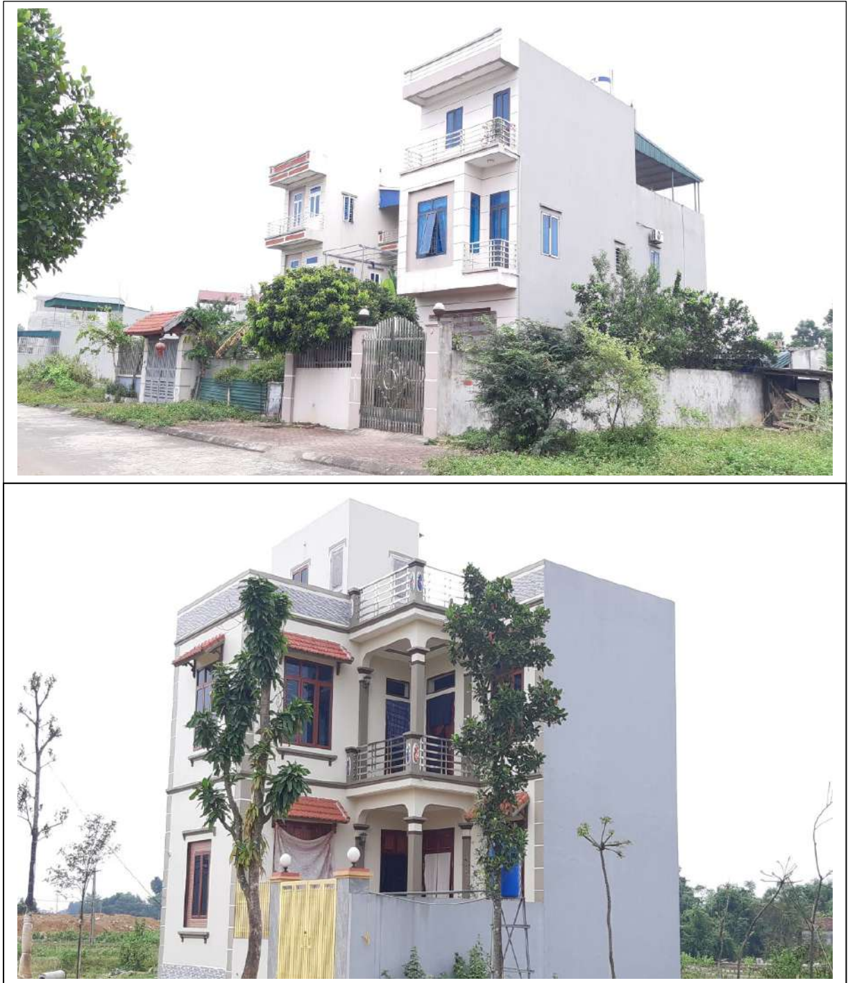
Figure 11: Images of new homes in the resettlement site