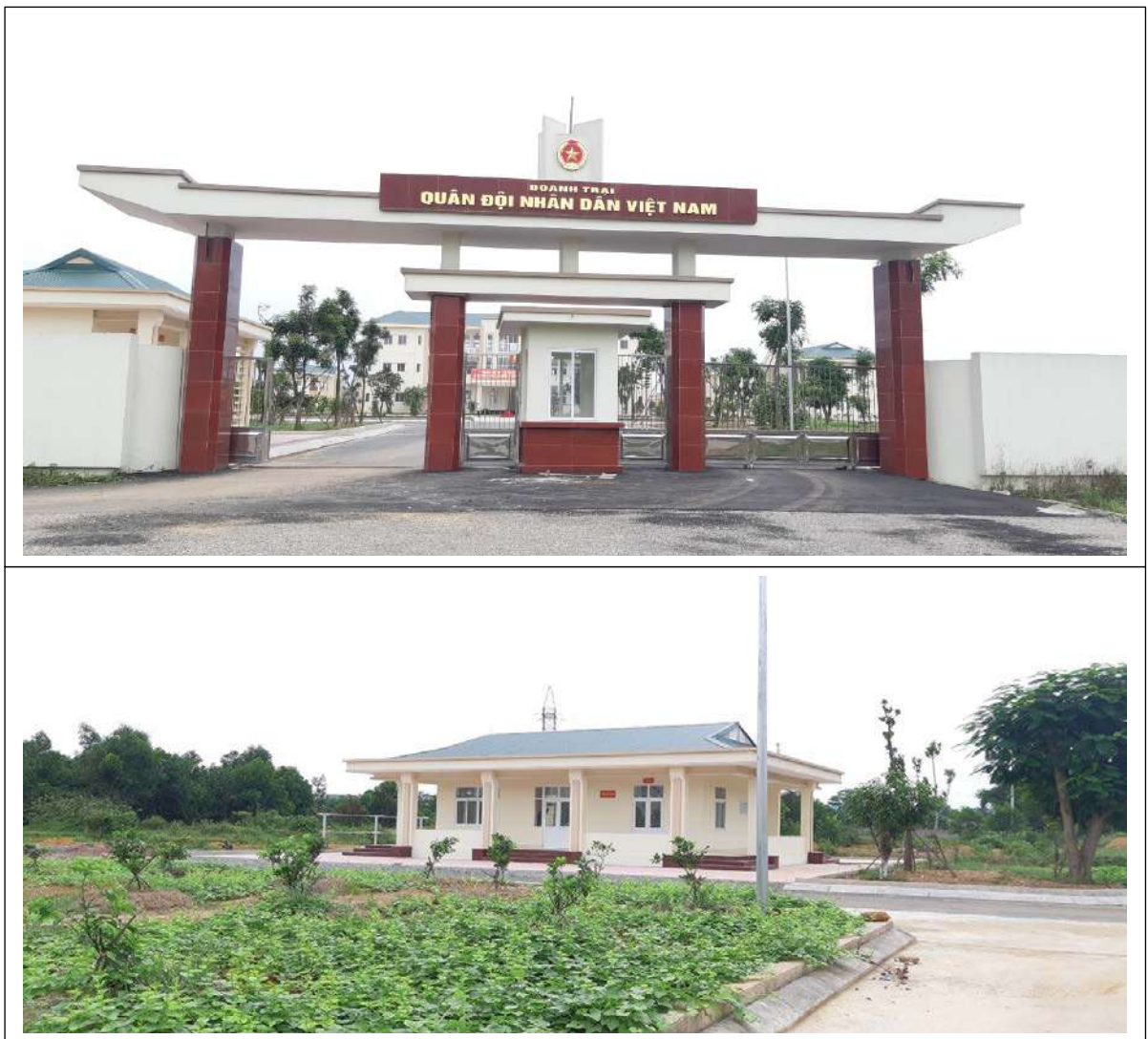
Figure 1: Military barracks is completing the construction in the land area of 52.7ha

- By the end of June 2019, the construction of new barracks on the 52.7ha land area in Binh Yen commune has been completed 99% (construction items have been constructed: gates, fences, working houses, barracks ...), the remaining 1% of construction works are finishing the canteen and building flower gardens, planting the barracks campus. The Government has arranged to arrange funds to disburse for the Army to continue completing the new barracks. The army has also moved its army since the fourth quarter of 2014. However, military equipment such as tanks, high-altitude artillery, etc., called large military weapons will be moved later because the technical areas and underground tunnels will need more time for completion. Once the project is commenced for construction, all of them will be moved out.