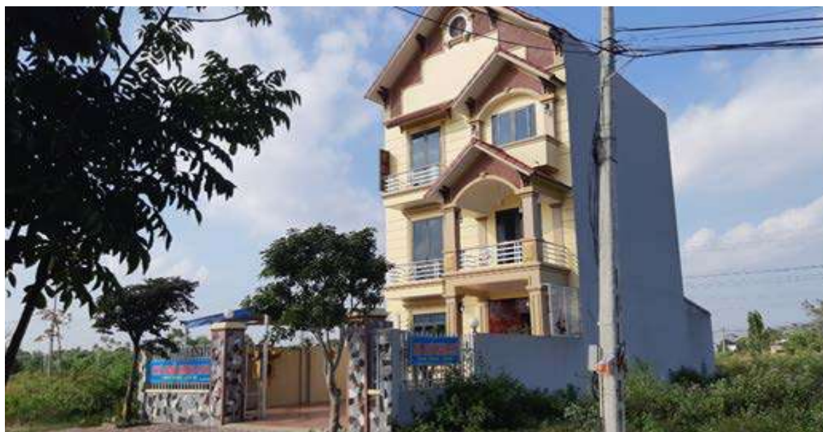
Figure 9: Construction progress in the resettlement site 36.04 ha