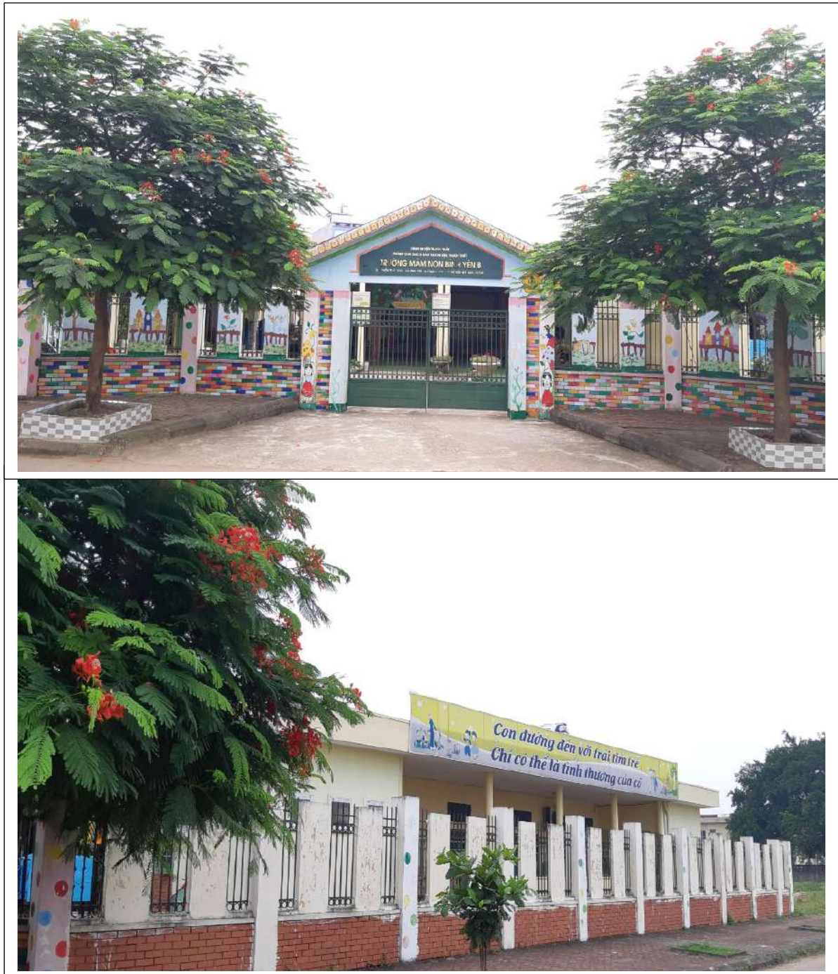
Figure 10: Construction of the kindergarten in the resettlement site

28. As per regulation, AHs who received land plots with size of 120 m2, 200 m2 and 240 m2 can carry out constructions. The Thach That DPC committed to provide power to AHs' houses if require. Because of the significant support from DPC, its not only bring the good condition for AHs of USTH project but also for the affected people of other projects in Hoa Lac HTP to move here for resettlement. By now, we can see more and more images of new living space and spacious houses in the resettlement area.