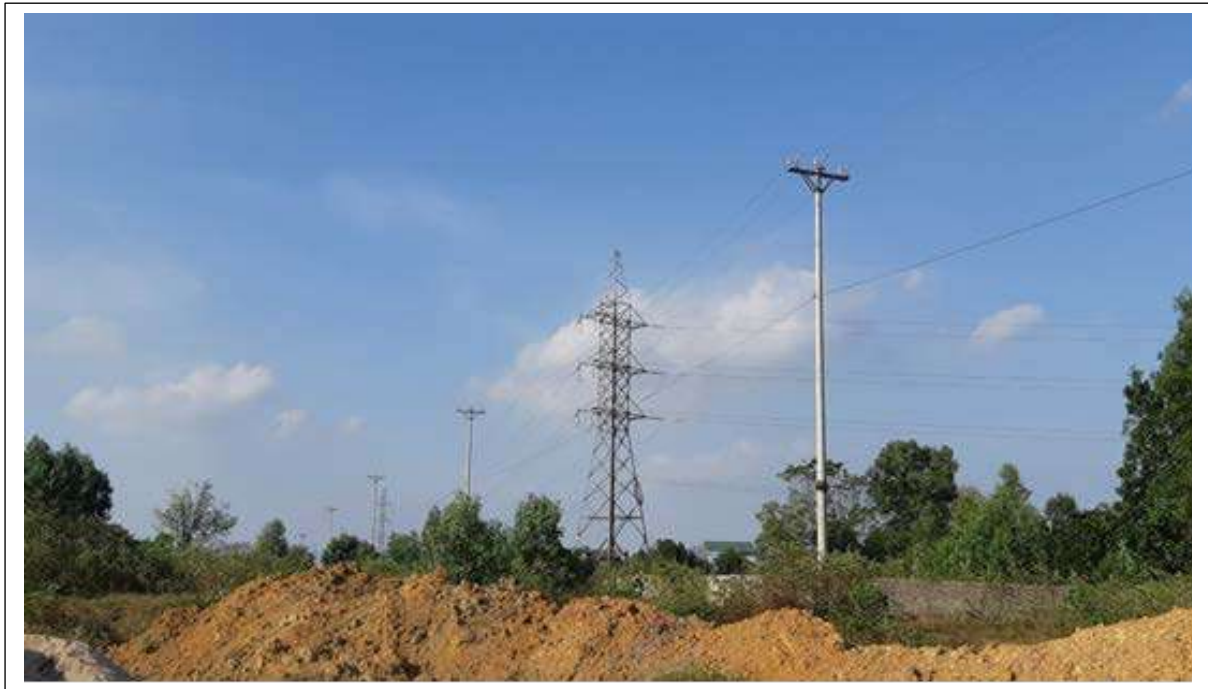
Figure 12: High voltage power line for resettlement area

wastewater systems for management of the whole area is now being implemented. At present, resettlement households have been provided with electricity and water for daily life, while the project on electricity/water for the whole area is being implemented.