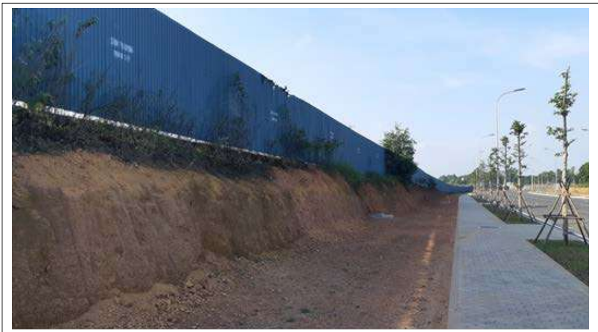
Figure 3: Construction of boundary fence surrounding the Project site

8. Packages on construction of temporary fence and boundary road surrounding the Project site have been implemented since July 2014. By now the contractor has completed 65% scope of work regarding the fence and about 55% works of road. These 02 packages are temporarily stopped when constructed to the boundary of 19 ha of land because the said land is being used by the military units who help to protect the land from re-encroachment. As the results, the construction of temporary fence and boundary road are not necessary to be continued constructing which also helps to save the cost for project (35% budget for the temporary fence and 45% budget for the boundary road).