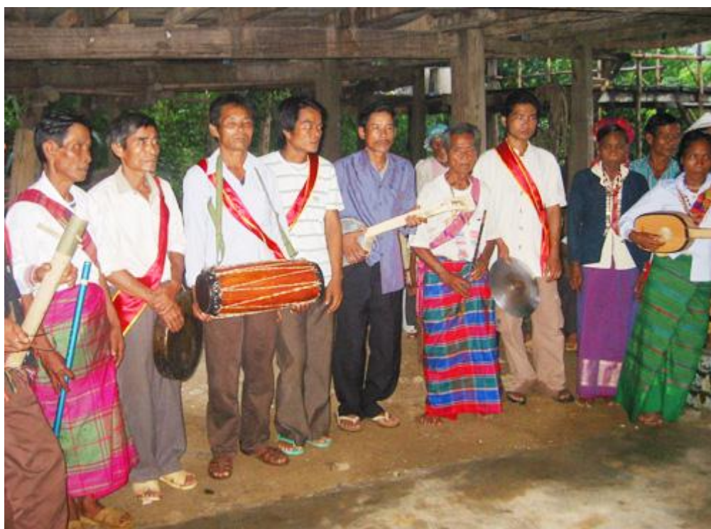
Housing of ethnic minority

The Kinh's houses has two tile-roofs, one tile-roof is before (you can see the picture) and one in after (you can't see the picture), home usually divided into 4 compartments for family members, the house was built of brick or concrete walls, roofs are often made of baked bricks, the fire was located in separate buildings, the size house is large or small depending on family-rich or poor. But the house has four doors