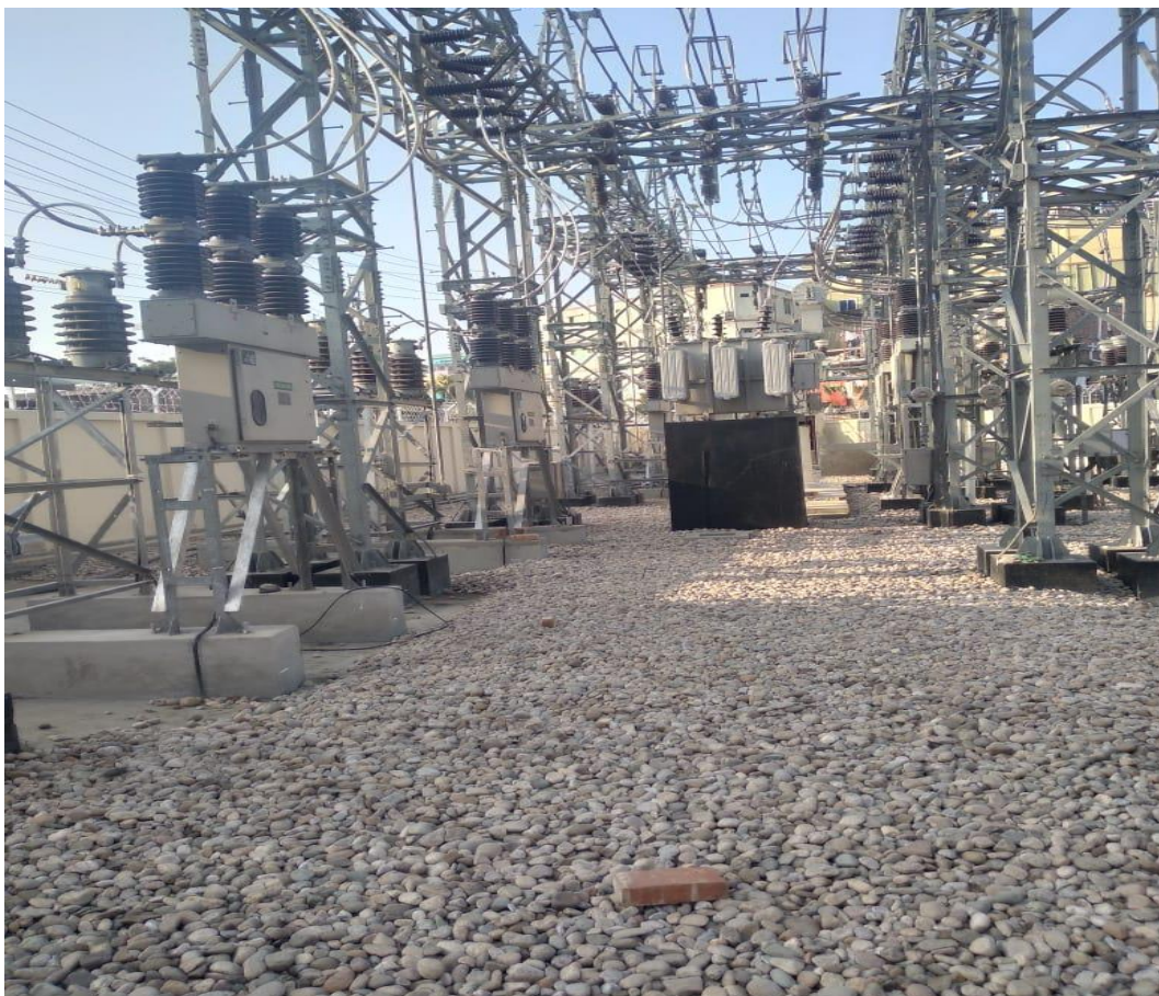
Figure: neat And Clean Workspace At Kalurghat SS