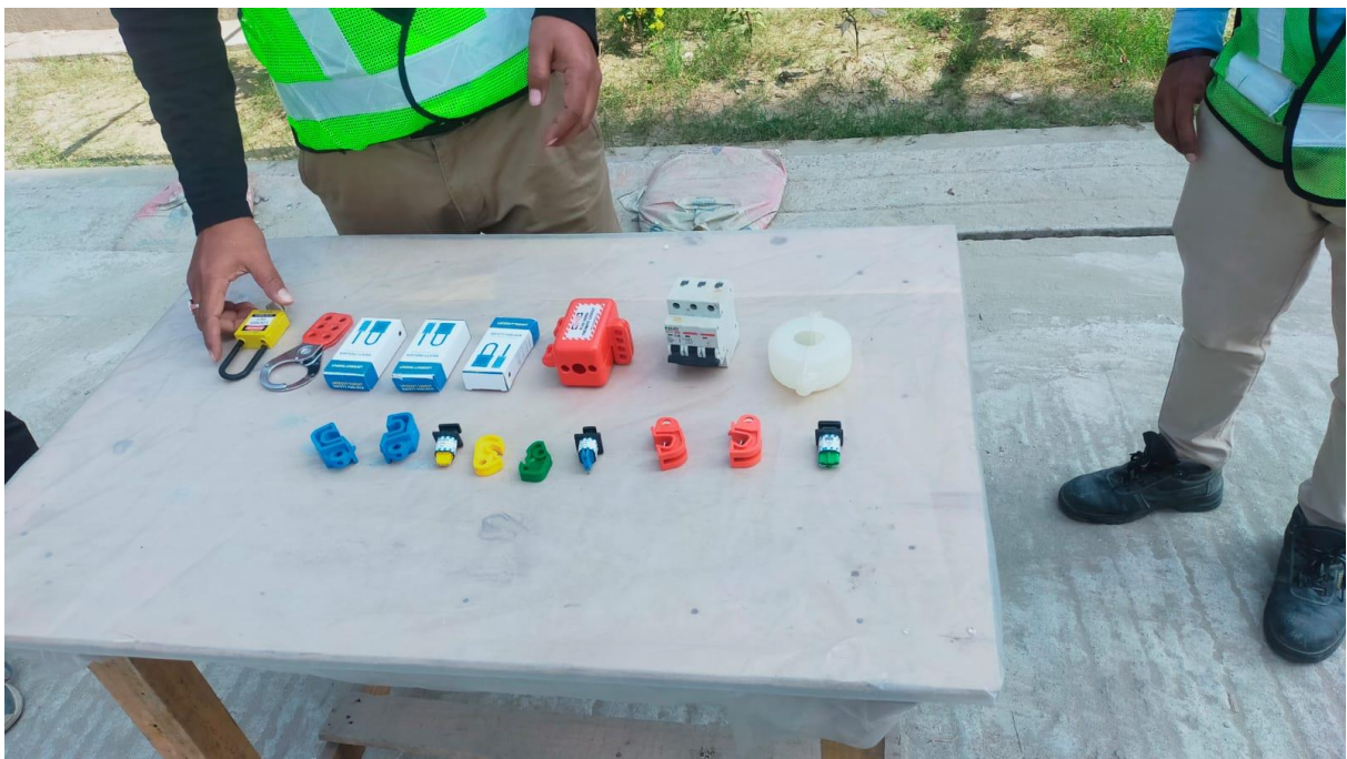
Figure: Safety Awareness ( Madunaghat )