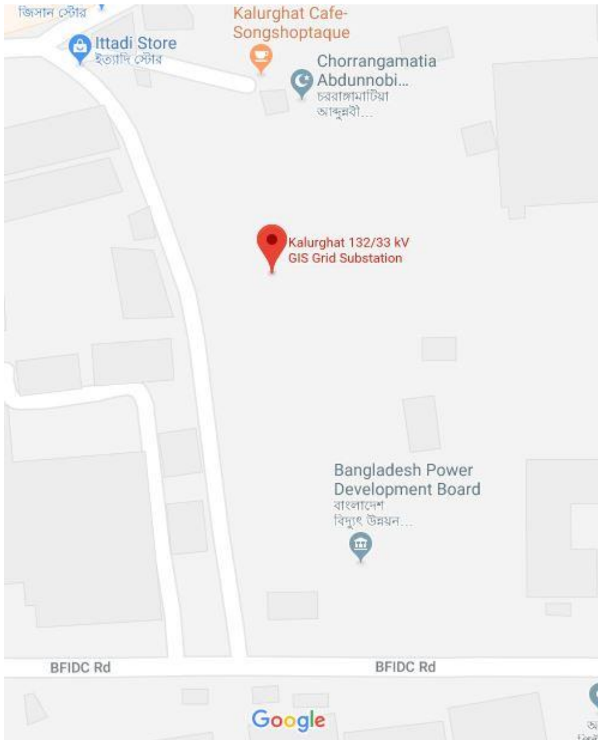
Fig: Site Location of 132/33 kV GIS Grid Substation at Kalurghat, Chittagong.