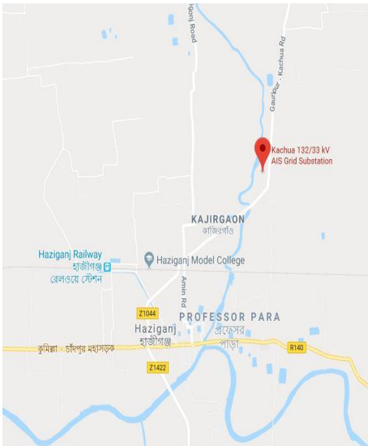
Fig: Site Location of 132/33 kV AIS Grid Substation at Kachua, Chandpur.