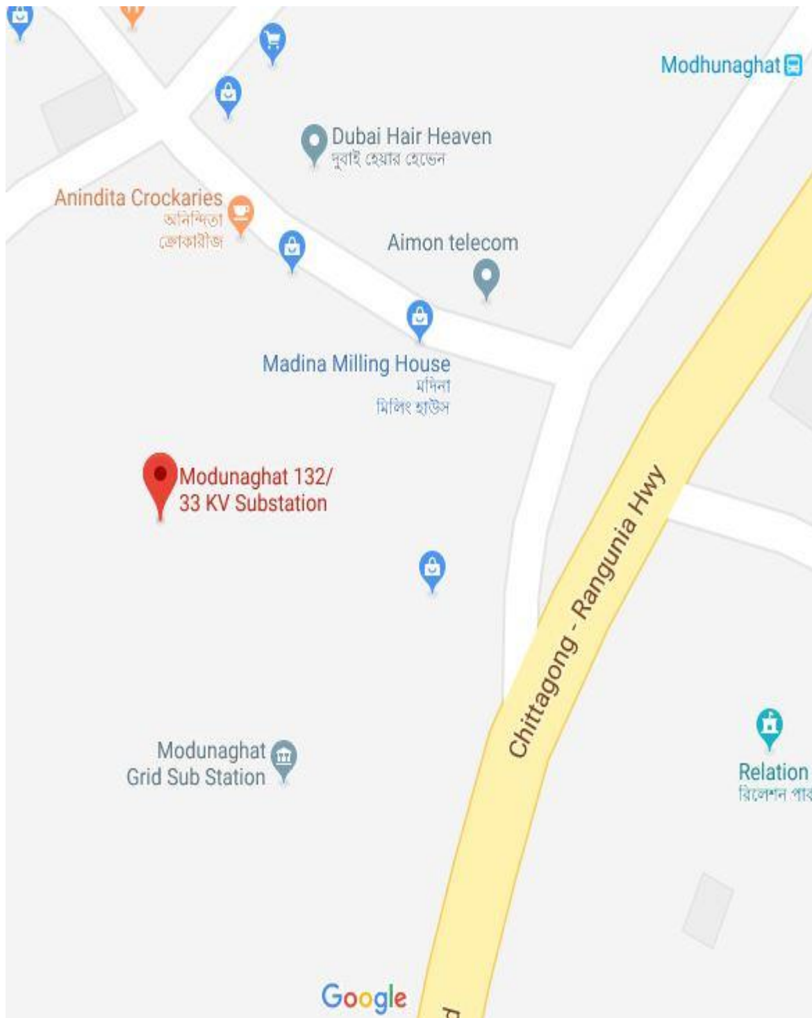
Fig: Site Location of 132/33 kV GIS Grid Substation at Madunaghat, Chittagong.