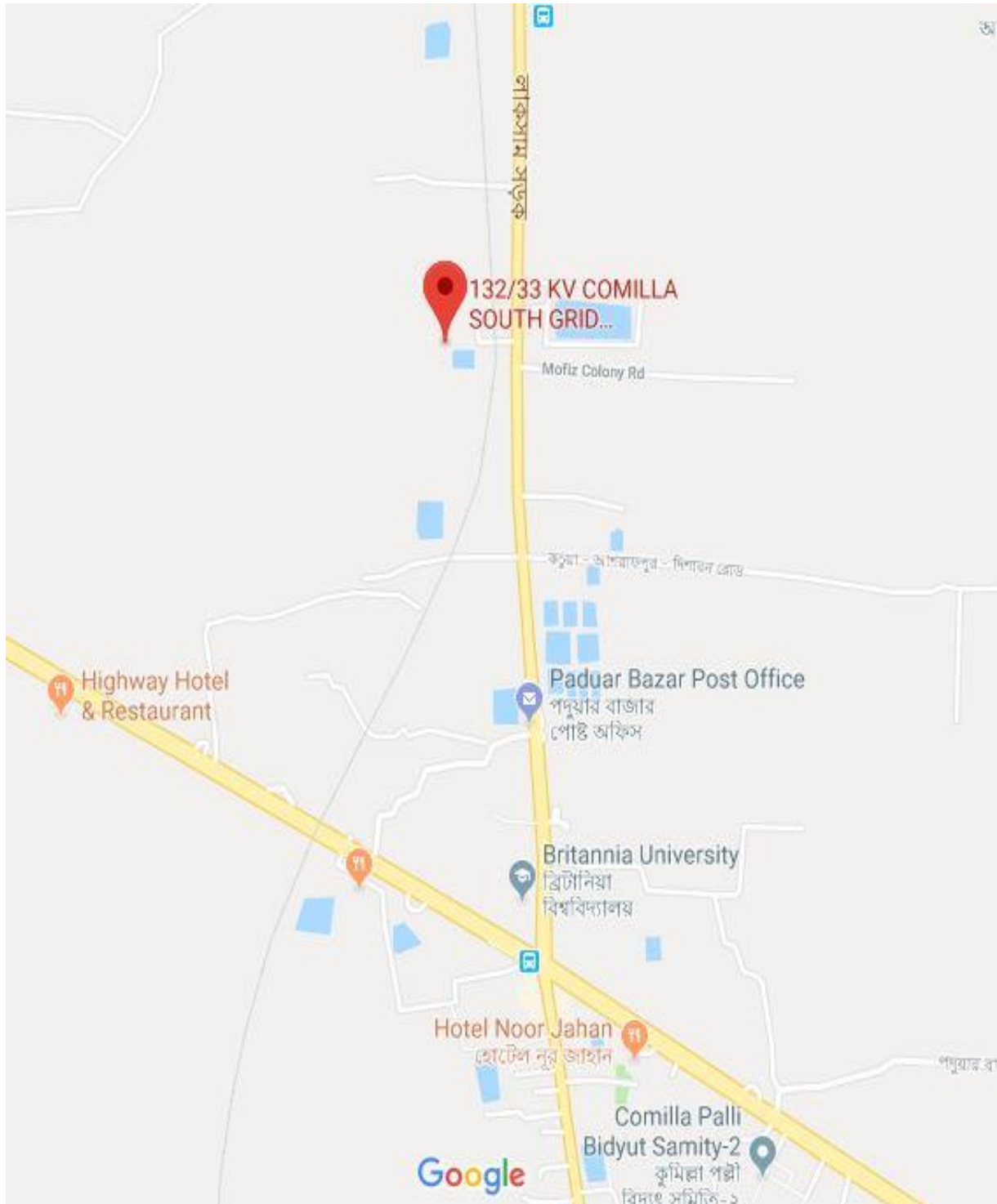
Fig: Site Location of 132/33 kV GIS Grid Substation at Cumilla (South).