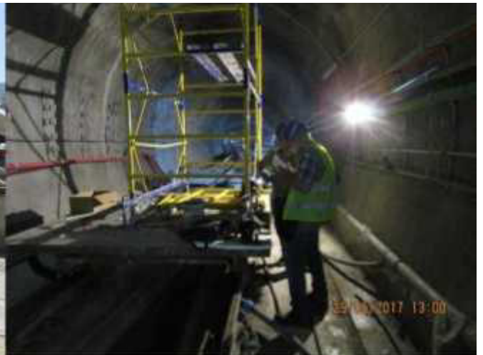
Two specialists of Environmental Agency of Georgia took the samples of noise and air outside and inside the tunnel on 29.05.2017