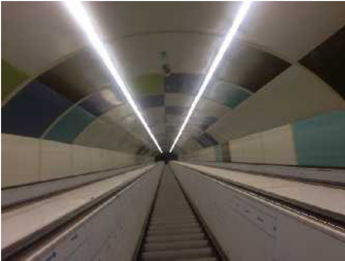
Escalator is installed