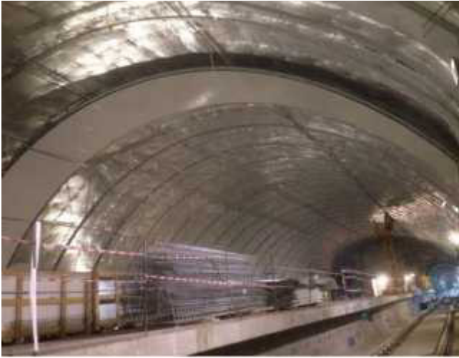
Installation of superstructure steel panel in platform