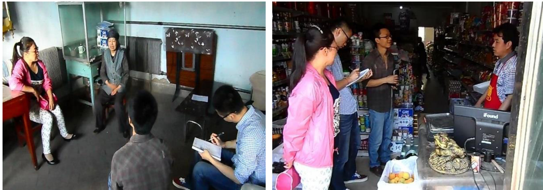
Attached Picture 4 Interview photos