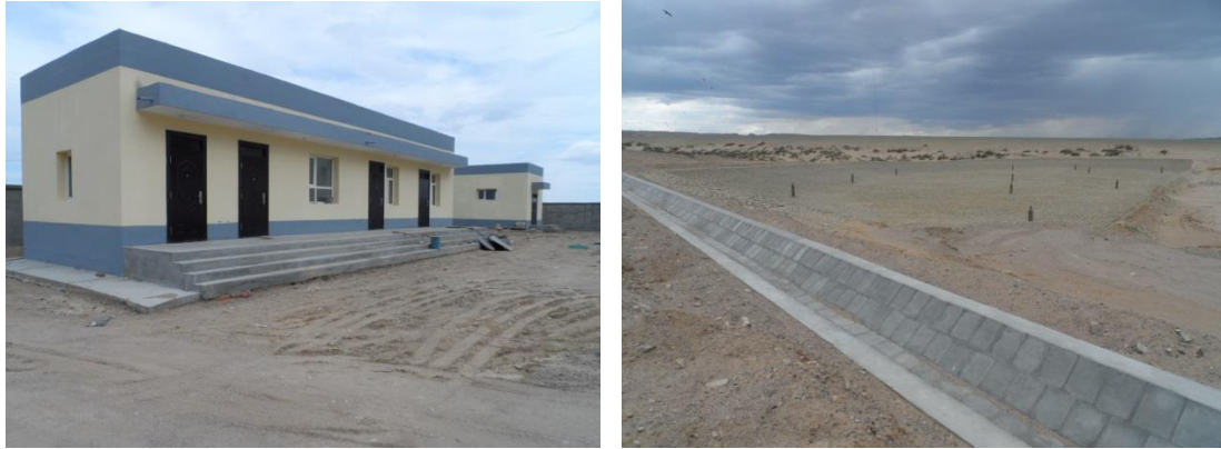
Attached Picture 1 Current Situation of County refuses disposal plant