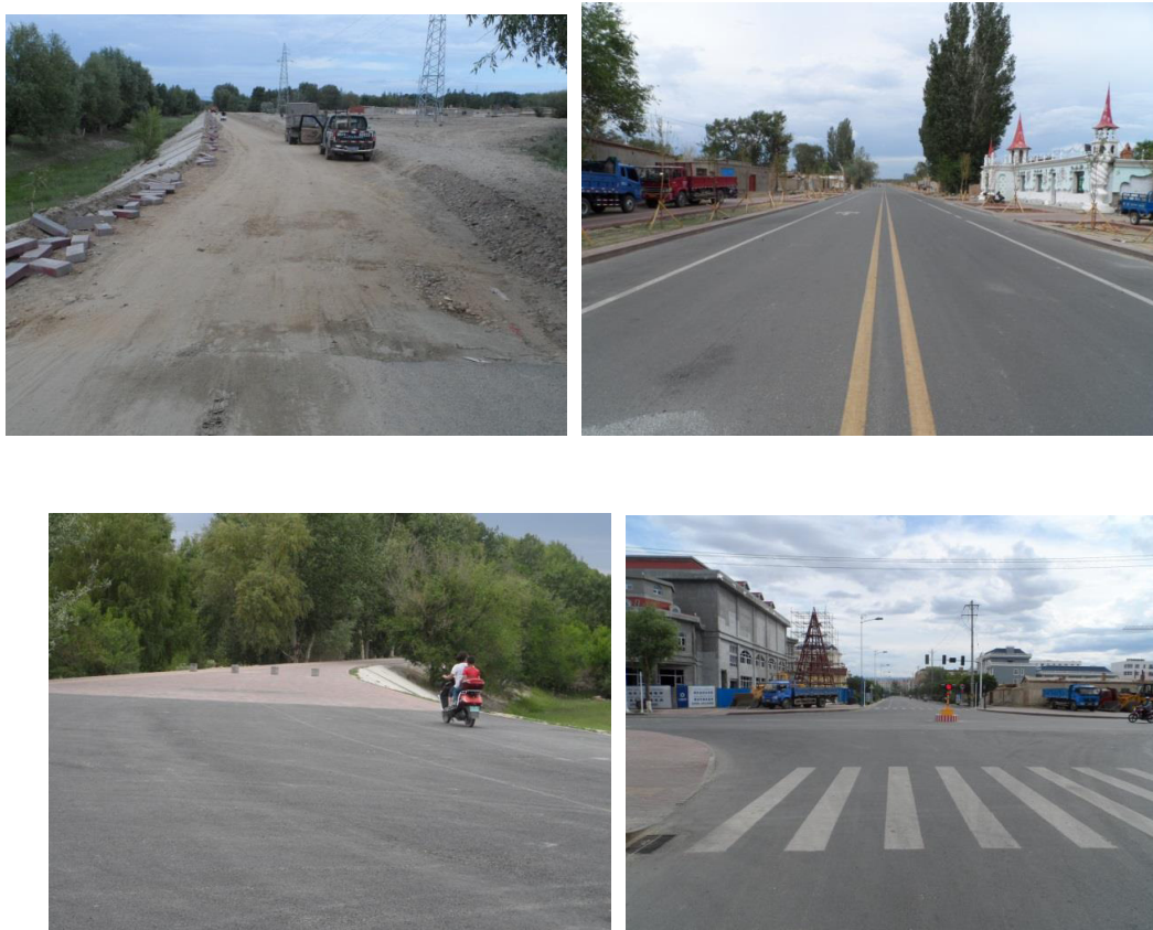
Attached Picture 2 Current Situation of road construction