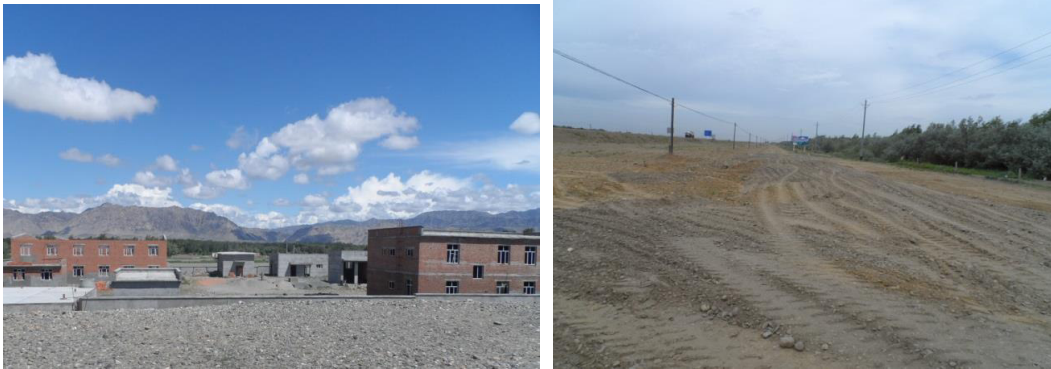
Attached Picture 3 Current Situation of water purify plant