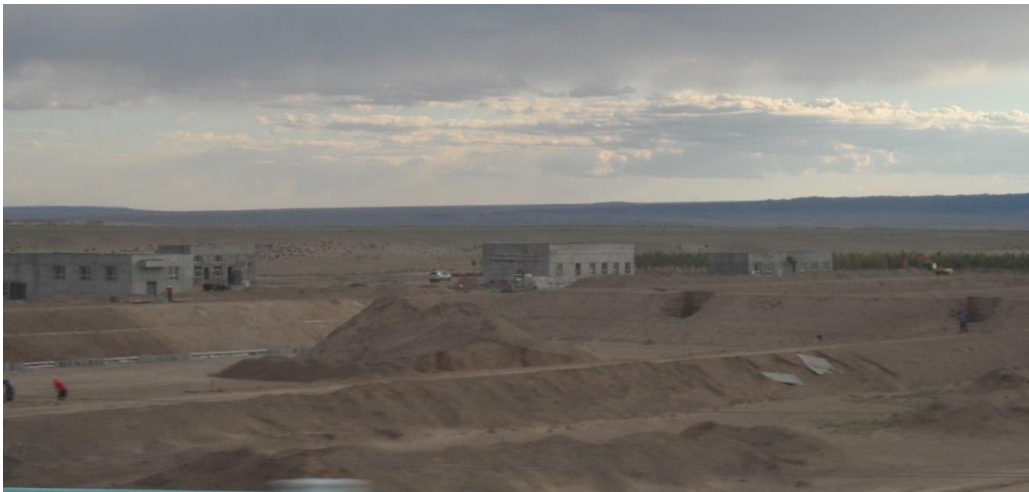
Figure2: Sewage Treatment Plant Construction Site