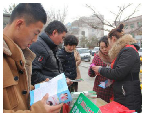
Figure 5-4 Propaganda on Prevention of AIDS in the construction site