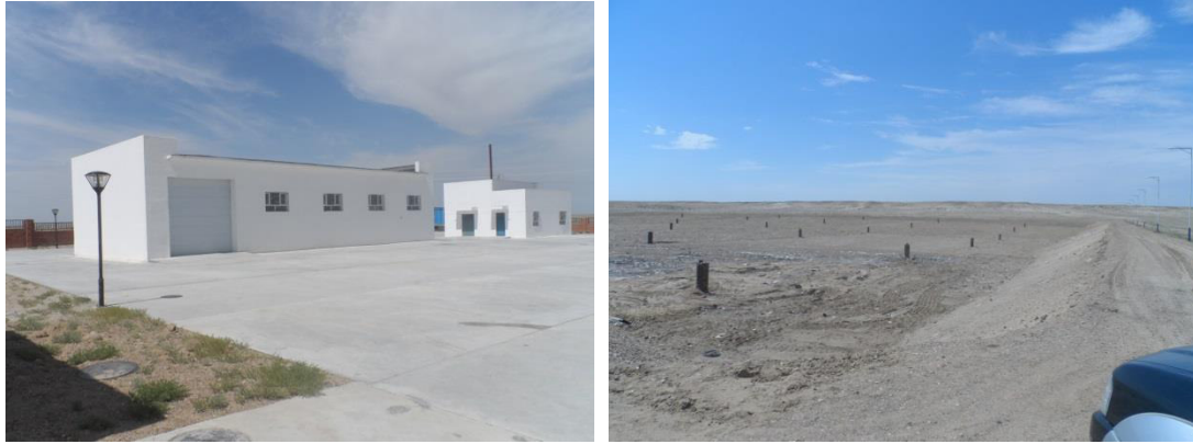
Figure1: Current status of Landfill and Office Area