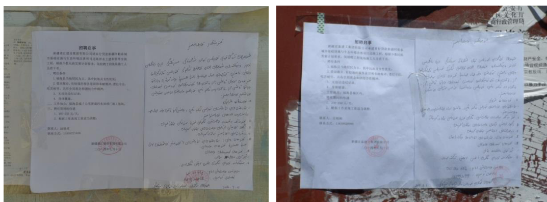
Figure 5-1 Bilingual Recruitment Information (Kazakh Language and Chinese)

According to this monitoring, after the refuse disposal component getting into operation, PMO promulgated the recruitment information in the bulletin board with bilingual words, and ensure that the local residents can get benefit from the project. During the implementation of this project, Fuhai County PMO carried out the survey on public comments and suggestions from affected people and relevant units via community meetings and put up the bulletin to make the residents know the implementation and progress of this project. Under the construction of the project PMO publicized the propaganda on prevention of AIDS in the construction site.