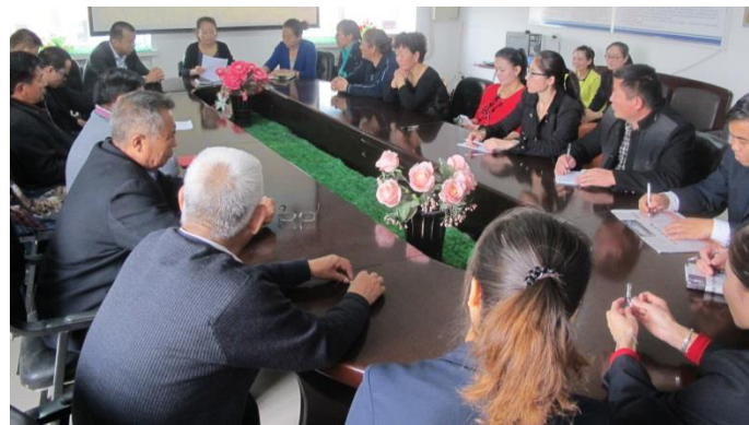
Figure 5-3 Public Participation Meeting in Community