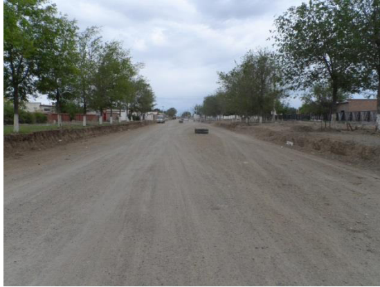
Figure3: Current situation of Xingfudong road