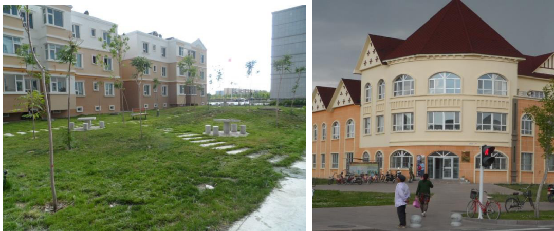
Attached Picture2: Photos of Resettlement Estate