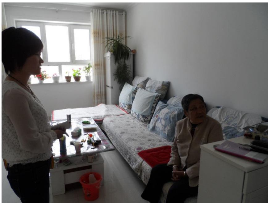
Attached Picture 5: The typical household interview