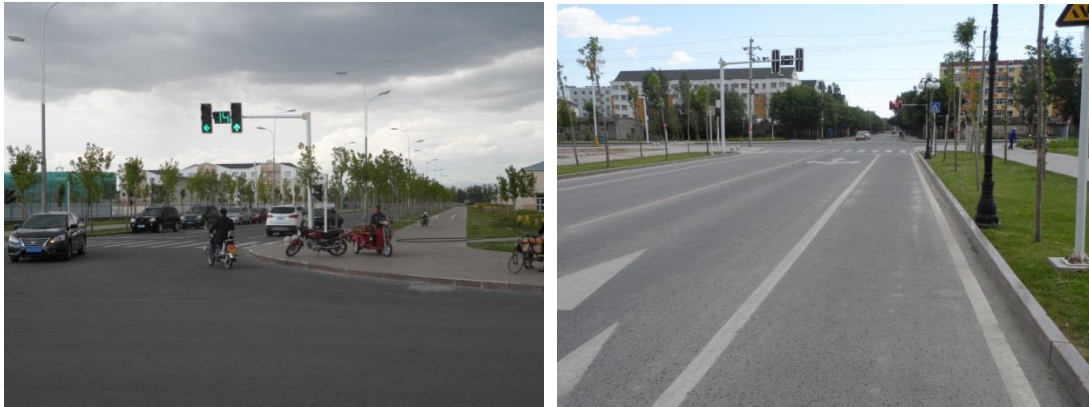
Attached Picture 1: Current Situation of Roads