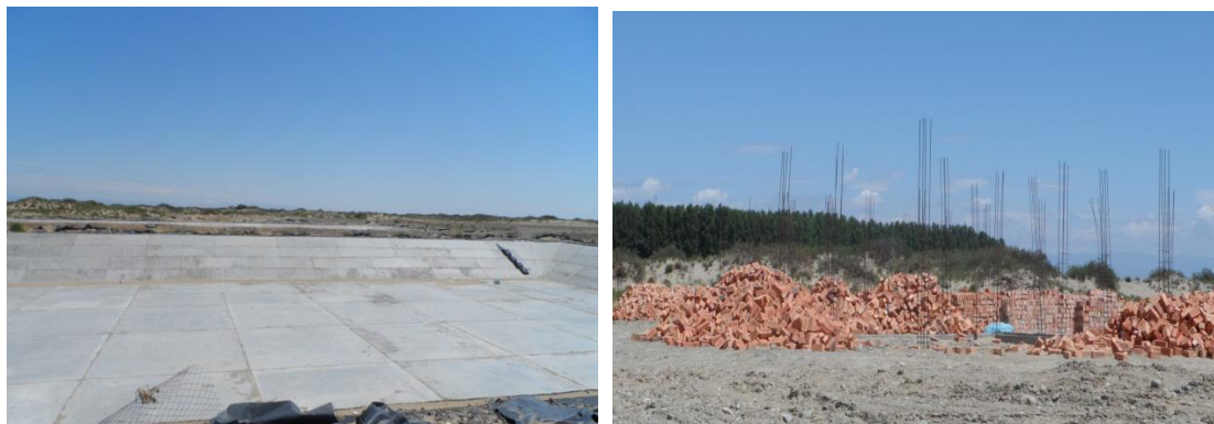
Attached picture 4: Photos of Current Situation of Sewage Disposal Plant