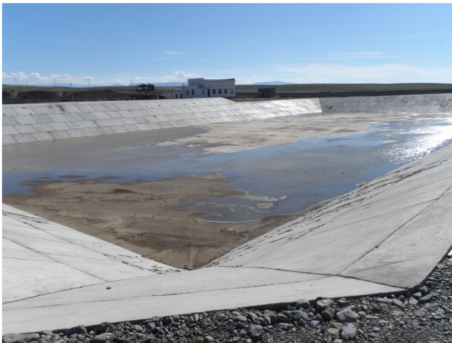
Attached picture 2 Status of waste treatment plant