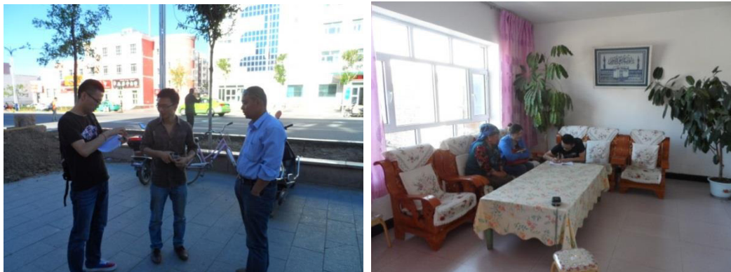
Attached picture 4 Typical Household Interview