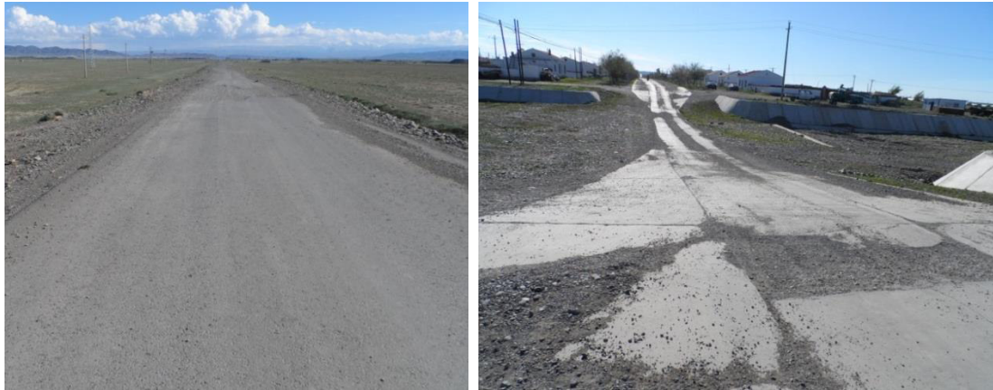
Attached picture 3 Status of Guanghui Road extension part and Caigang Street