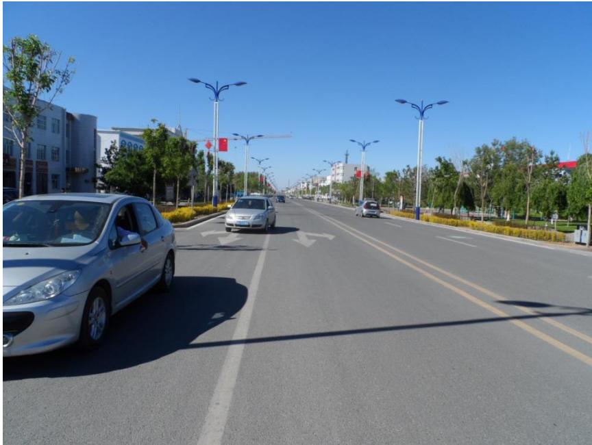
Attached picture 1 Tuanjie Road status has been built