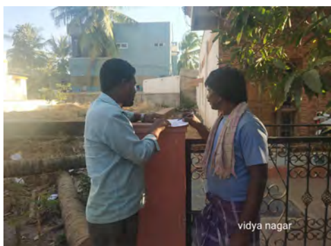
Consultation with stakeholder at Nehru Nagar Distribution WS