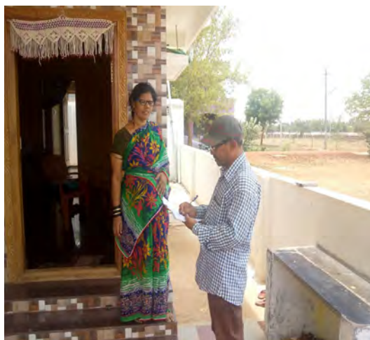
Consultation with stakeholder at Ahsrya badavane UGD