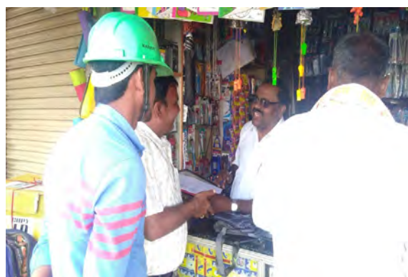
Consultation with stakeholder at Guttur area UGD