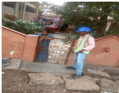
Consultation with stakeholder with Shimoga Road Harihara Bulk WS