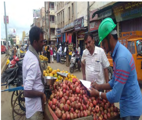
Consultation with stakeholder At Vidhya Nagar Road UGD