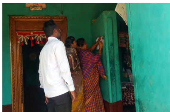
Consultation with stakeholder at shivapura Distribution WS