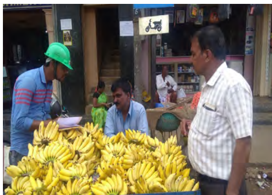
Consultation with stakeholder at Harapanahalli Main Road, Guttur UGD