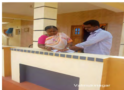
Consultation with stakeholder at Valmukinagar Distribution WS