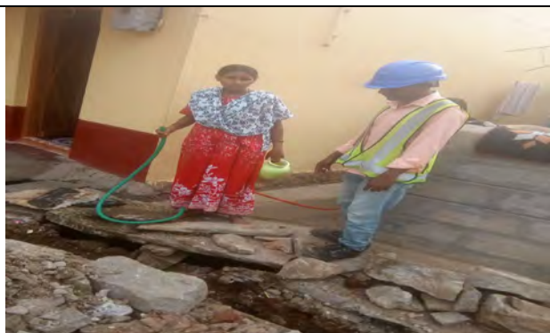
Consultation with stakeholder with Bus stand road Harihara Bulk WS