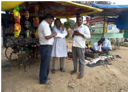
Consultation with stakeholder in P.V.Road, Harihara, Distribution Water supply