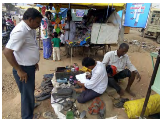
Consultation with stakeholder in P.V.Road, Harihara, Distribution Water supply