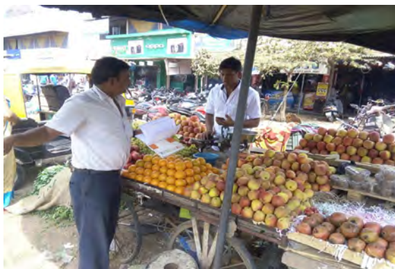
Consultation with stakeholder in P.V.Road, Harihara, Distribution Water supply