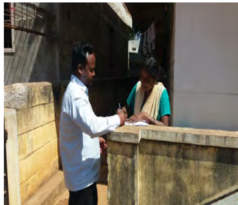
Consultation with stakeholder At Benki Nagar 3rd Cross UGD