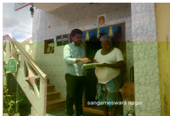
Consultation with stakeholder at Byadgi UGD works