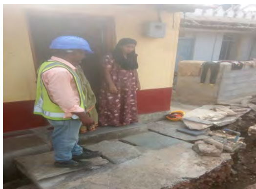
Consultation with stakeholder with Harpanahalli circle Harihara Bulk WS