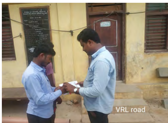
Consultation with stakeholder at Byadgi UGD works