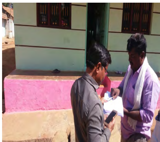
Consultation with stakeholder at Basaweswara nagar UGD