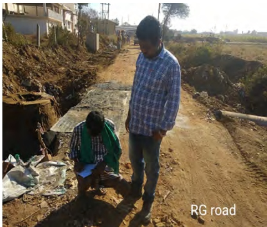
Consultation with stakeholder at RG Road