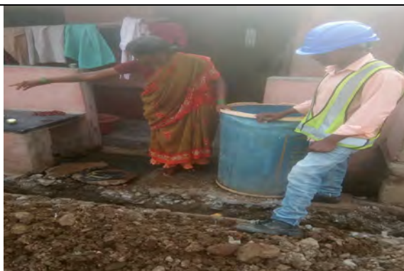
Consultation with stakeholder with PB Road Harihara Bulk WS