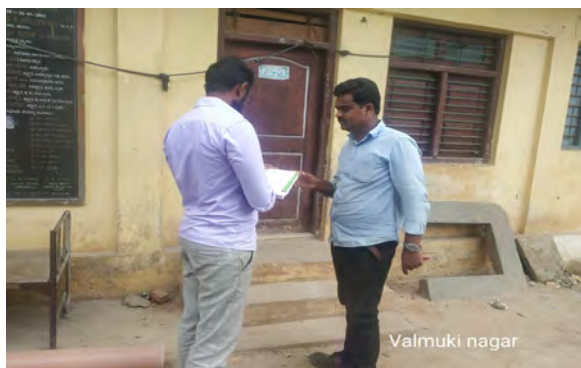
Consultation with stakeholder at Byadgi UGD works