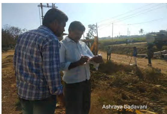
Consultation with stakeholder at Ashraya badavane Distribution WS