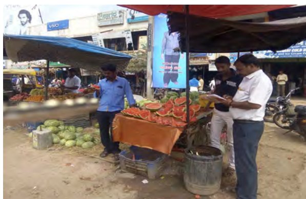
Consultation with stakeholder in P.V.Road, Harihara, Distribution Water supply