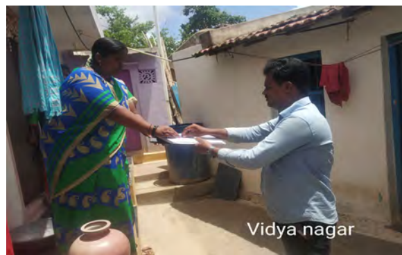
Consultation with stakeholder at Byadgi UGD works