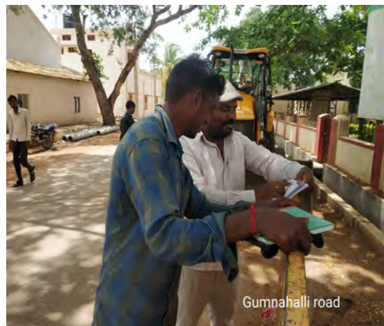
Consultation with stakeholder Consultation at Gumnahalli Road