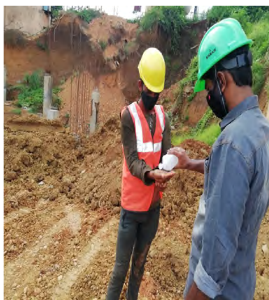
Providing Sanitizer at jack well