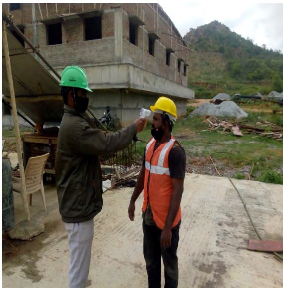
Thermal scanning at WTP