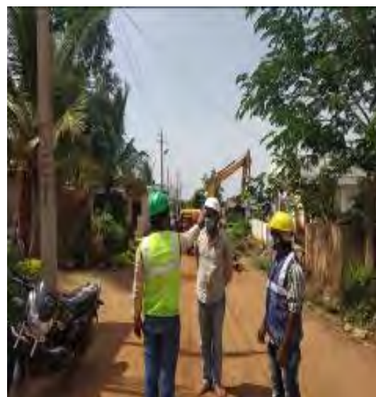
Awareness Program conducted