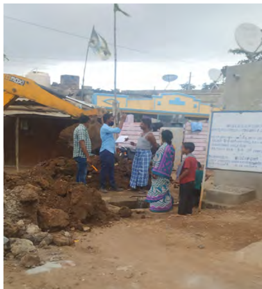
Consultation with stakeholder at SSM nagara