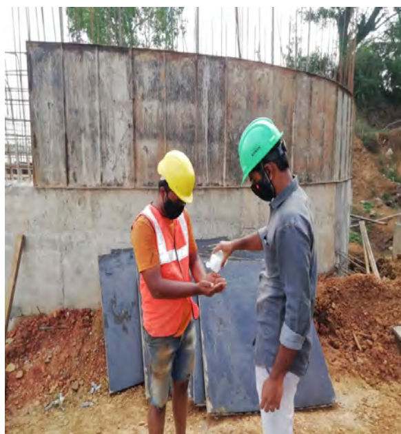
providing Sanitizer at Jackwell