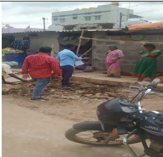
Consultation with stakeholder at Shivanagara