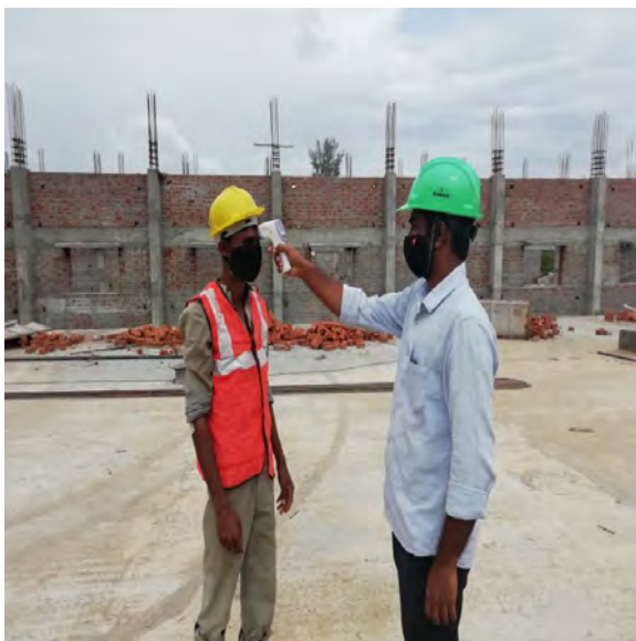
Thermal scanning at WTP