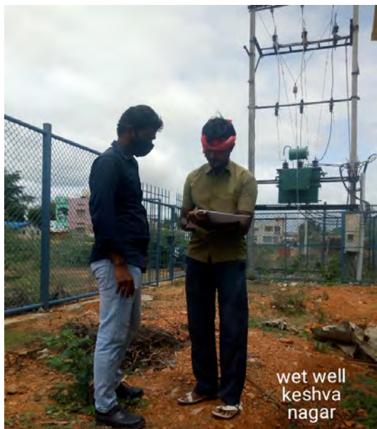
Consultation with stakeholder At Keshva nagar