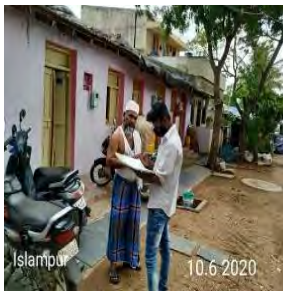
Consultation with stakeholder at Islampur