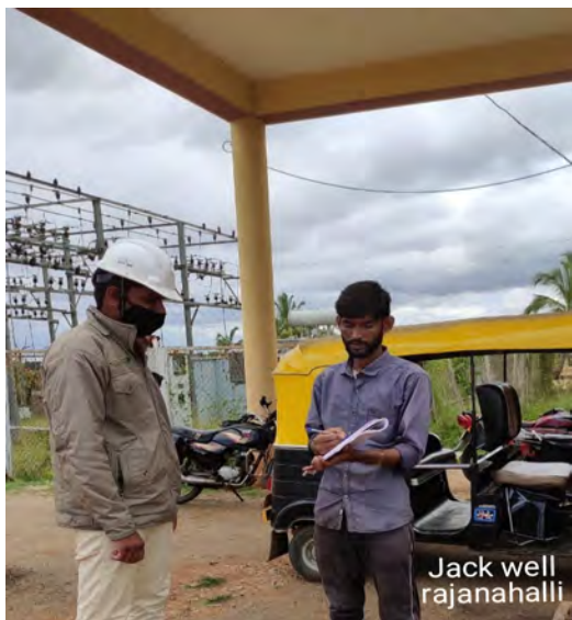
Consultation with stakeholder Rajanahalli Village