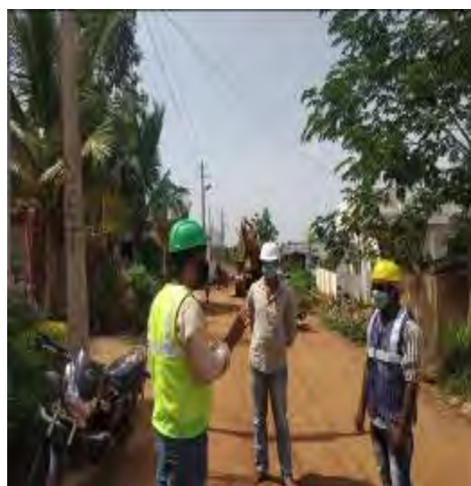
Awareness Program conducted