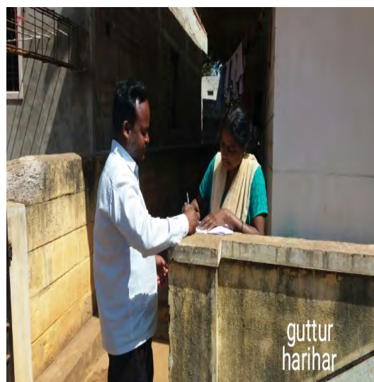
Consultation with stakeholder At Guttur colony