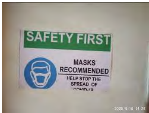
safety posters Displayed at site and office