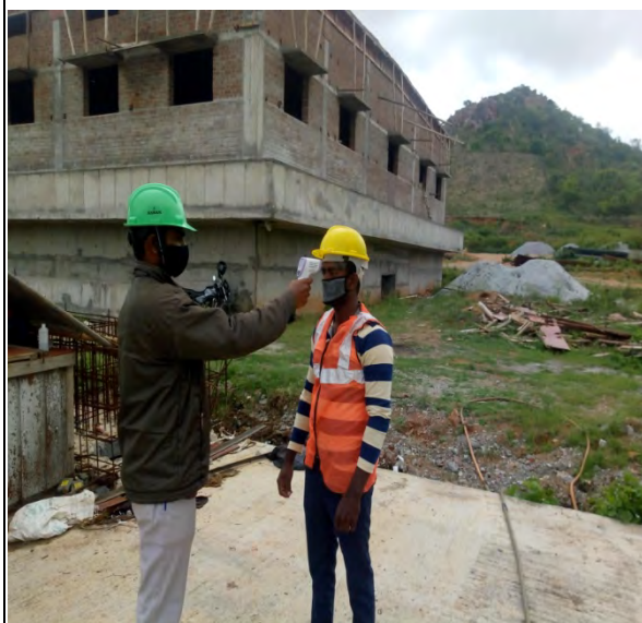
Thermal scanning at WTP