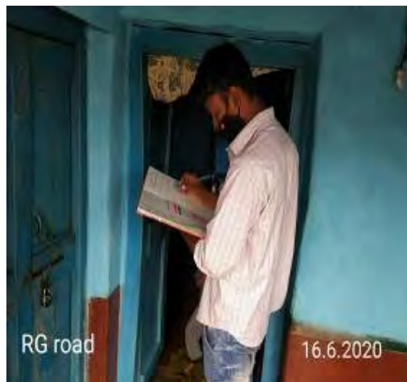
Consultation with stakeholder at RG road