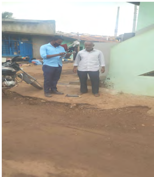
Consultation with stakeholder at SSM nagara