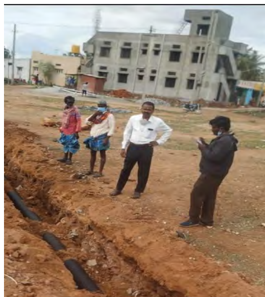
Consultation with stakeholder At Basapura