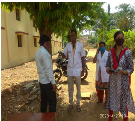
Awareness performance by CMC Harihara