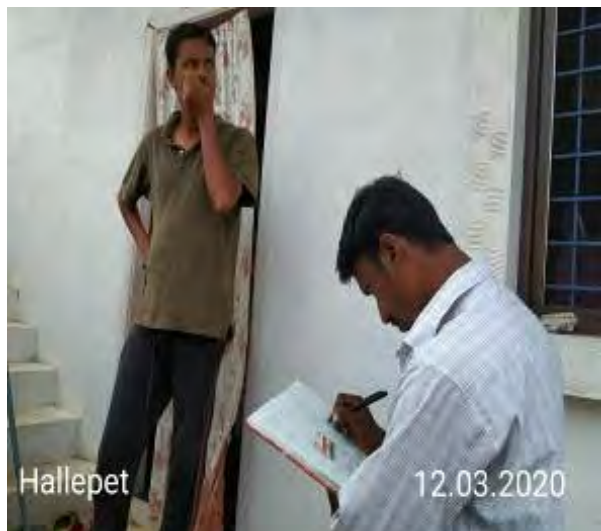
Consultation with stakeholder at Hallepet