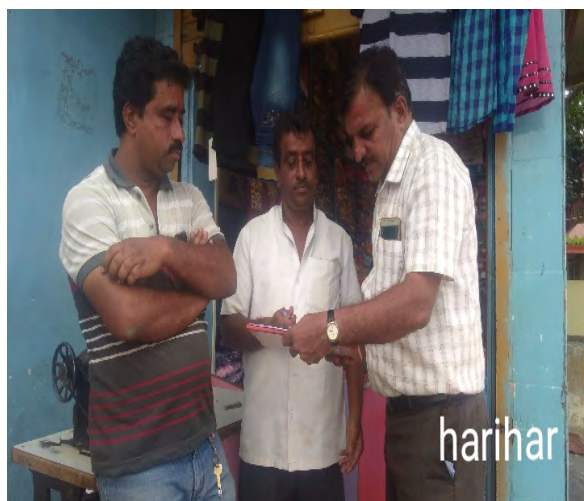
Consultation with stakeholder At Amaravathi colony