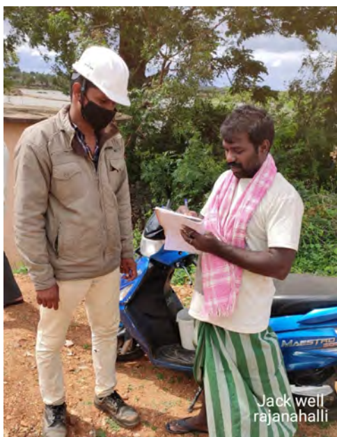
Consultation with stakeholder Rajanahalli Village