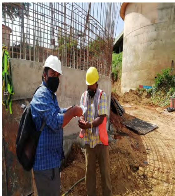
Providing sanitizer at jack well