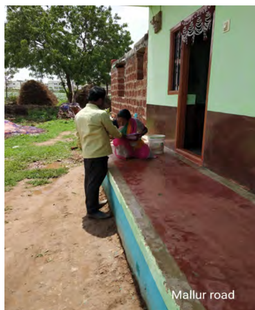
Consultation with stakeholder at Gandhi Mallur road

Emergency contact numbers displayed on the barricades