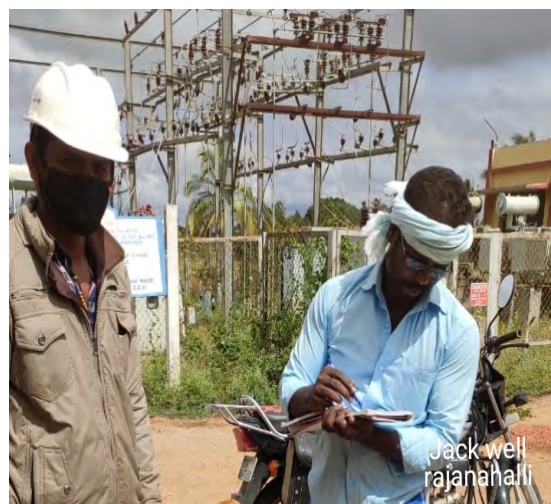
Consultation with stakeholder Rajanahalli Village