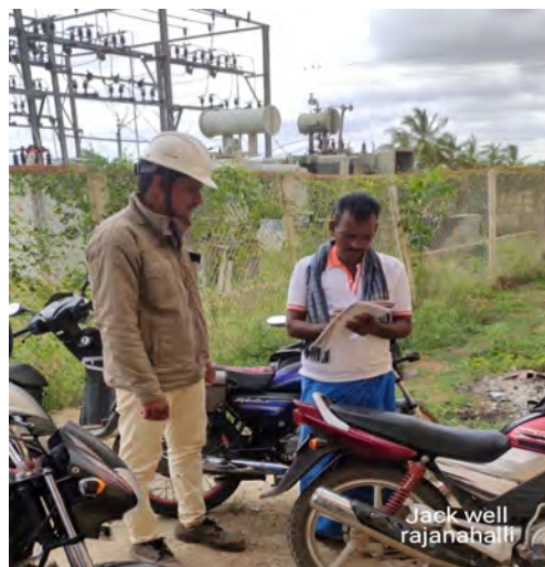
Consultation with stakeholder Rajanahalli Village