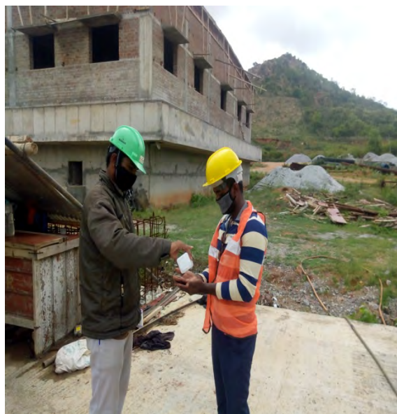
Providing Sanitizer at WTP