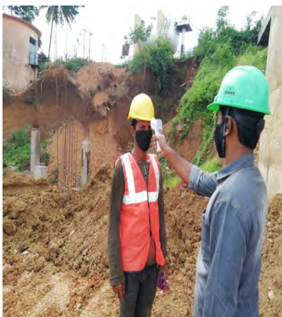
Thermal scanning at WTP