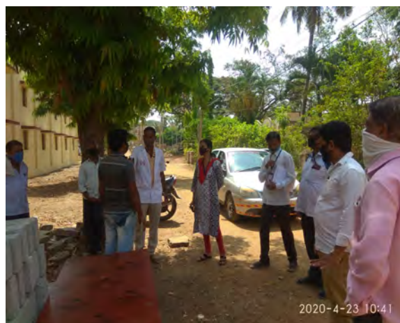
Awareness performance by CMC Harihara