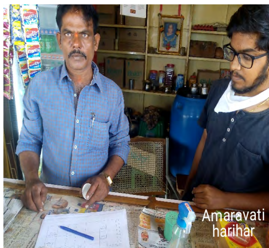
Consultation with stakeholder At Amravathi colony