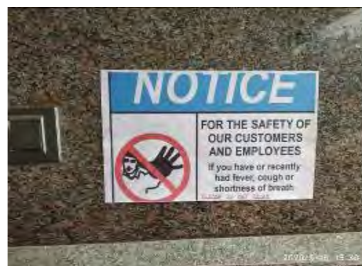
safety posters Displayed at site and office