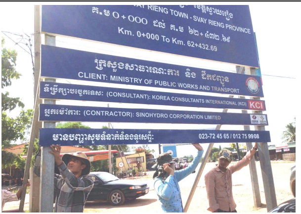
NR13 Information Board (4 places)