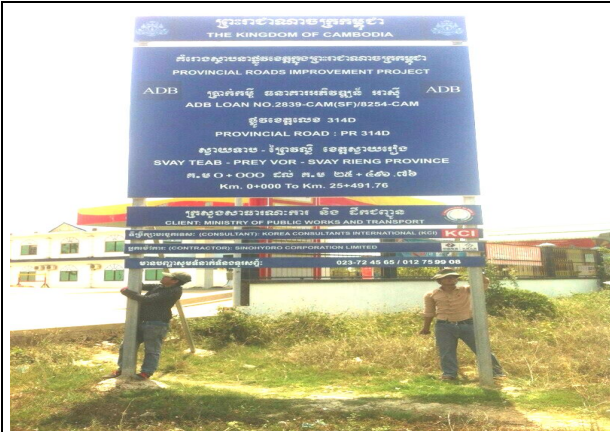
PR314D Information Board (3 places)