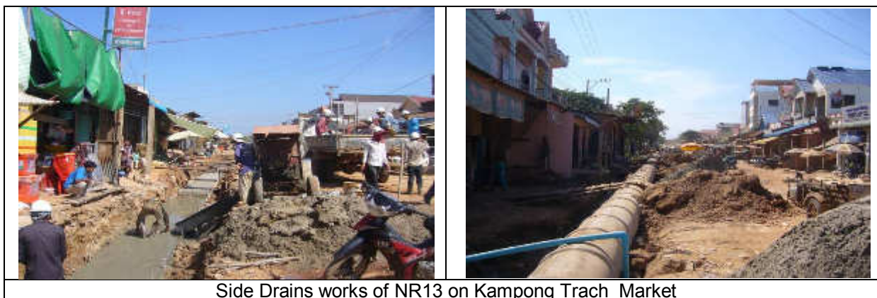
Side Drains works of NR13 on Kampong Trach Market

43. Air and Noise Emission: some sections of the project area as well as NR13 are located in the rural area, so the air quality is still good and not industries are near the project site, most of along the road areas are covered by rice field, agricultural farm, and rural resident. The contractor did not conduct air and noise monitoring because air and noise on the project area were very little emission. Air and noise would be affected short-time during construction. However, the contractors should be regularly implemented plan for checking and maintaining of construction machines/equipment to reduce negative impacts. There was no major air and noise issue during the monitoring.