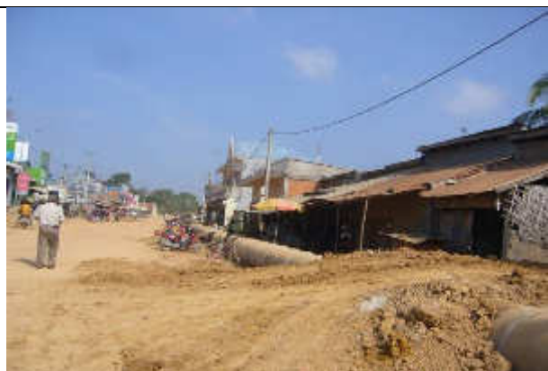
Local business activities on the NR13