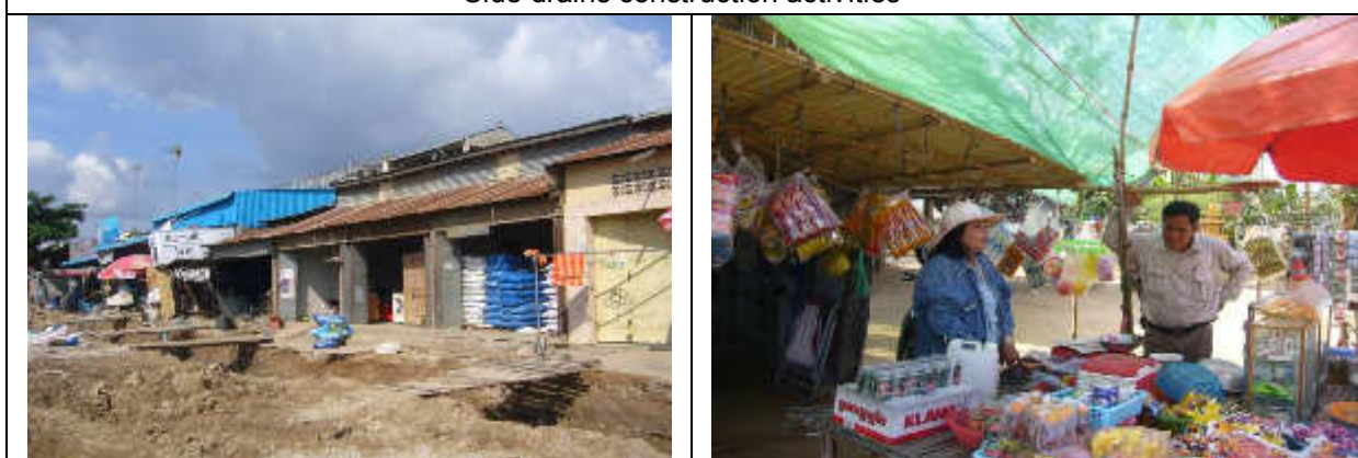
Local business activities on PR314D

54. Water quality: During field observation, no signed of water laden into the rice field or water body nearby the embankment of the construction road, due to suspended work during rainy season.