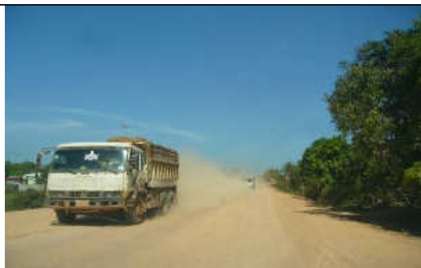
Dust generation on NR13