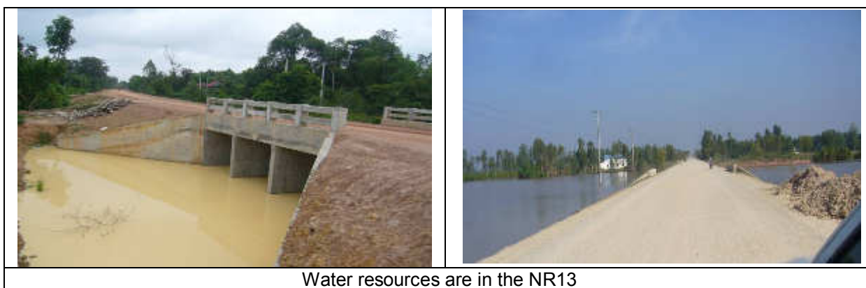
Water resources are in the NR13

45. Borrow pits/quarries: In this period 1 borrow pit and 2 quarries samples were tested for the base course material. The 1 quarry and 1 borrow pit have been approved. But the activities of quarry and borrow pits was limited due to raining and high water level.