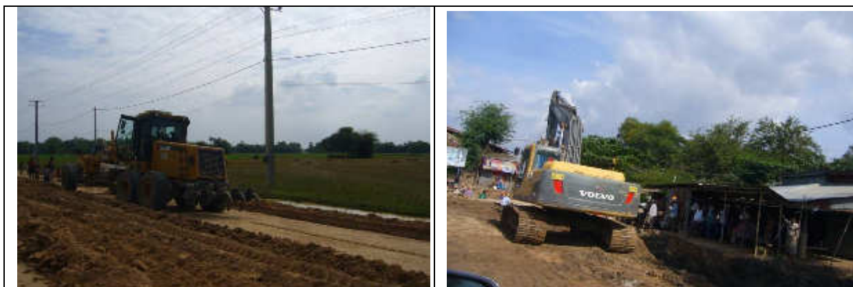
Starting construction activities of PR314D