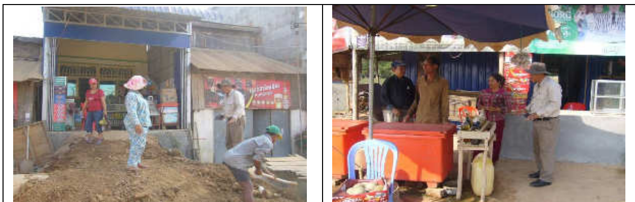
Consultation with affected communities

46. Leaks and Spills Hazardous material and Non-Hazardous Waste: The spills or generating of hazardous material waste (fuel waste from construction machine) storage facilities in safety bins or containers at SINOHYDRO's site camp are well managed. Both fuel storage facilities had an in charged person for daily operation and maintained with security and safety.