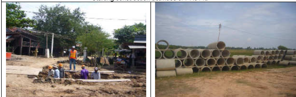
Side drains construction activities