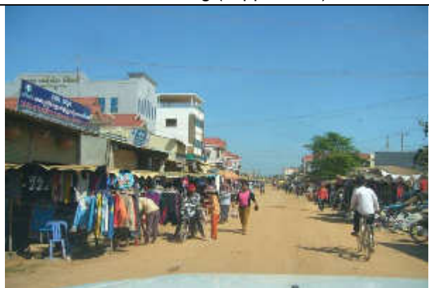
Local business activities on the NR13