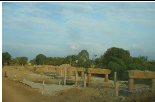
The construction activities of culvert and bridge section of NR53