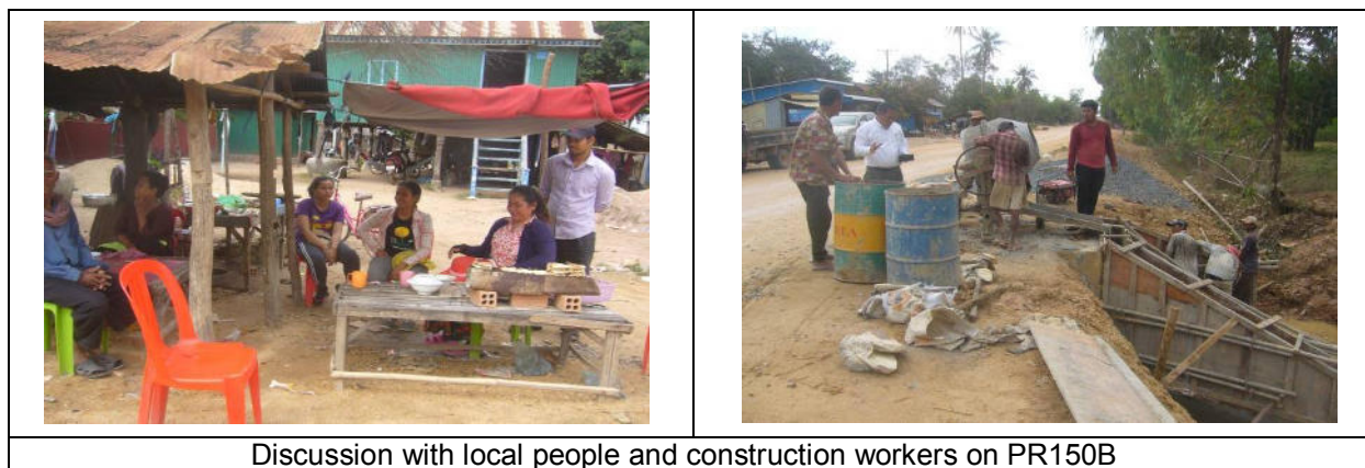
Discussion with local people and construction workers on PR150B