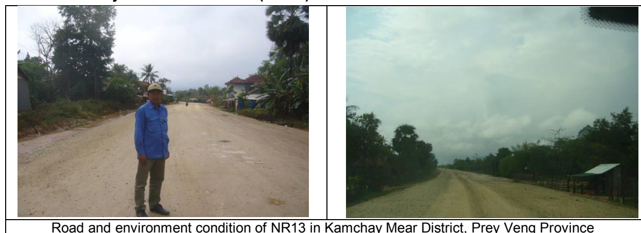
Road and environment condition of NR13 in Kamchay Mear District, Prey Veng Province