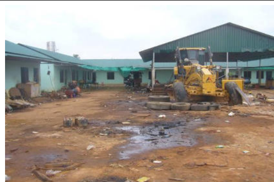
Petroleum storage container and oil waste leaching at camp of Gumkang-Visvakam JV