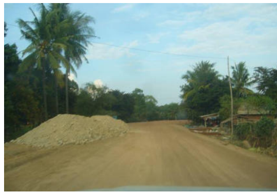
The present condition of PR53 during construction stage