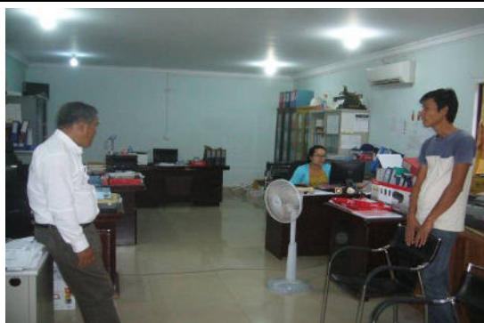
Discussion with project consultants and Gumkang-Visvakam JV staffs