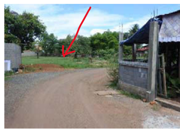
Mr. Bounthan donated his rainfed rice land 228 m 2 for the construction of new access road.