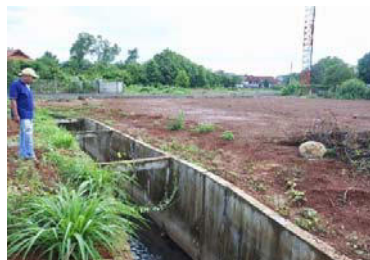
Drainage at Sanamxay village. Villagers requested to put cover on drainage for safety reason. PUEIP-2