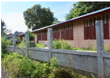
School fence and land affected. Use compensation monty built new fence for school