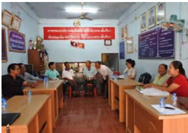
Meeting with village authorities at Thahinneua village and interviewed 2 AHs