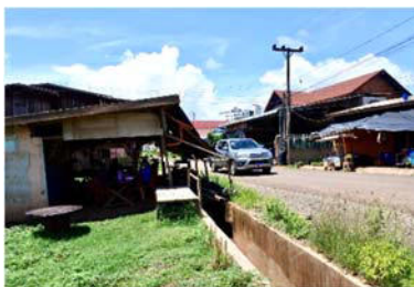
New noodle shop of AH relocated to new place close to main road. PUEIP-2