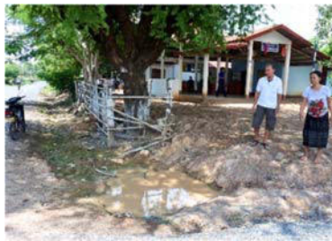
Villagers complaint on quality of contractor work at Thalunag village, they requested to fix before handover to community. CEI