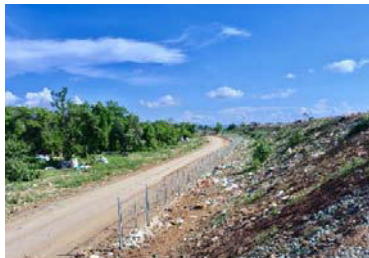
Visited existing landfill (Cell A) at Yom village. PUEIP-1