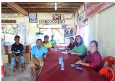
Meeting village authoritis at Houaypheck village and interviewed 3 beneficiaries households, CEI