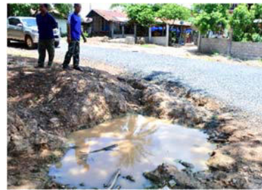
Villagers complaint on quality of contractor work at Thalunag village, they requested to fix before handover to community. CEI