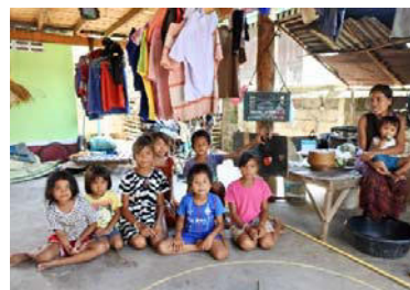
Interviewed poor household received free toilet under CEI.