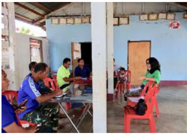
Meeting with village authorities at Thalunag village and interviewed 2 beneficiaries households. CEI