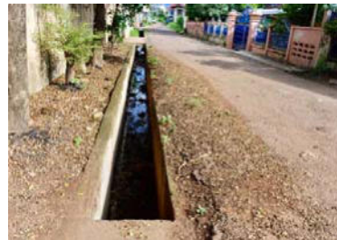
Drainage canal in used at Thahineua