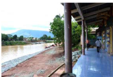
Vietnamese Temple at Thaluang village, affected land and structure. PUEIP-4