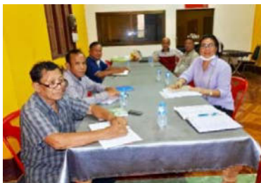
Meeting with village authorities at Sanamxay village and interview 2 AHs. PUEIP-2