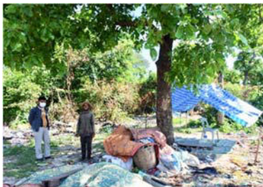
Waste picker livelihood and income source at exiting landfill (Cell A)