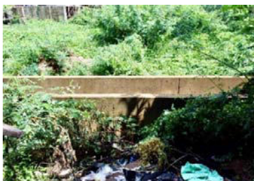
Drainage canal at Kea village, villagers request to backfill the soil, PUEIP-2