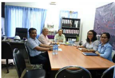
Kick-off meeting with Head of PMIU