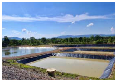
New upgraidng sanitary landfill (Cell B). PUEIP-1