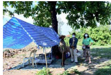
Interviewed waste picker livelihood and income source at exiting landfill (Cell A)