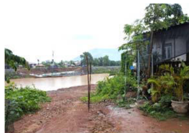
Private access road to riverbank of Mr. Khamfong was affected by the construction activities. PUEIP-4