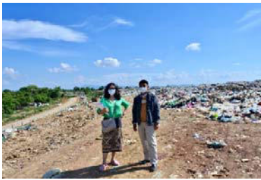
Visited existing landfill (Cell A) at Yom village. PUEIP-1