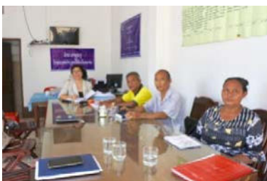
Meeting with village authorities at Thaluang village and interview 3 AHs, PUEIP-4