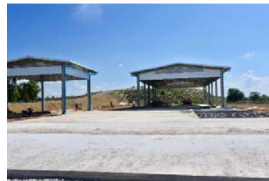
New facilities of upgraidng landfill (Cell B). PUEIP-1