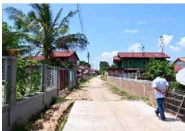
New access community road (CEI) at Houaypheck village