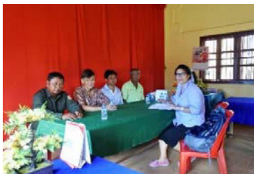
Meeting village authorities of Kea village- PUEIP-2