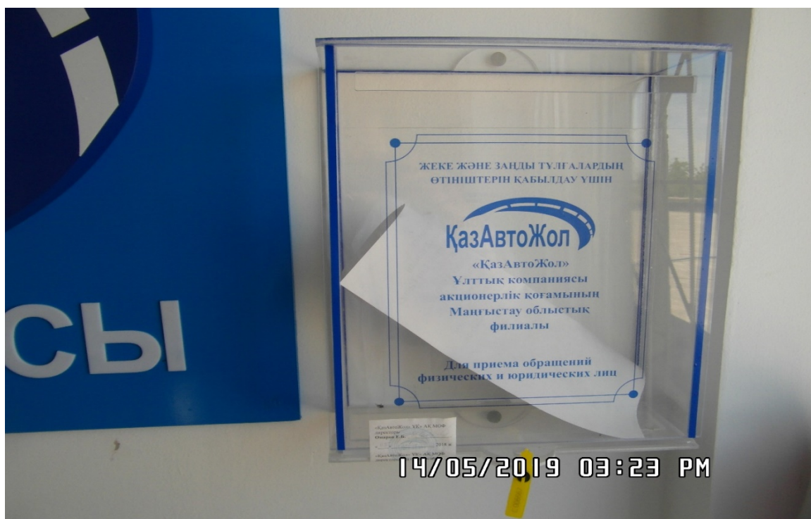
Complaint boxes installed in office of MB of "NC "KazAutoZhol" JSC