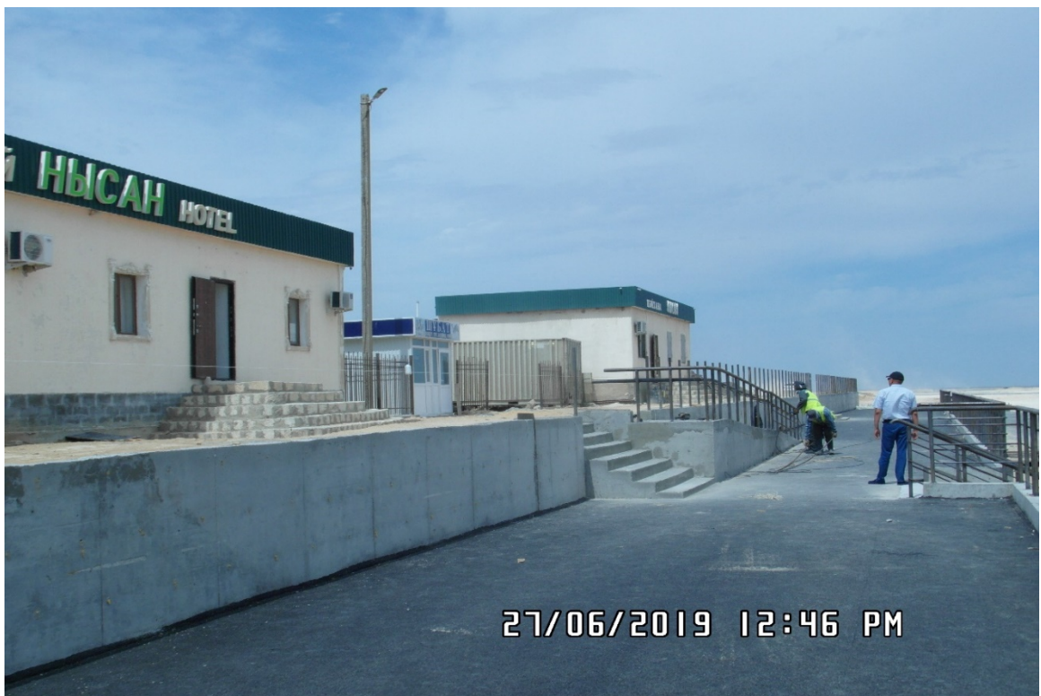
Construction of retaining wall at cafe "Nysan" on Pk314