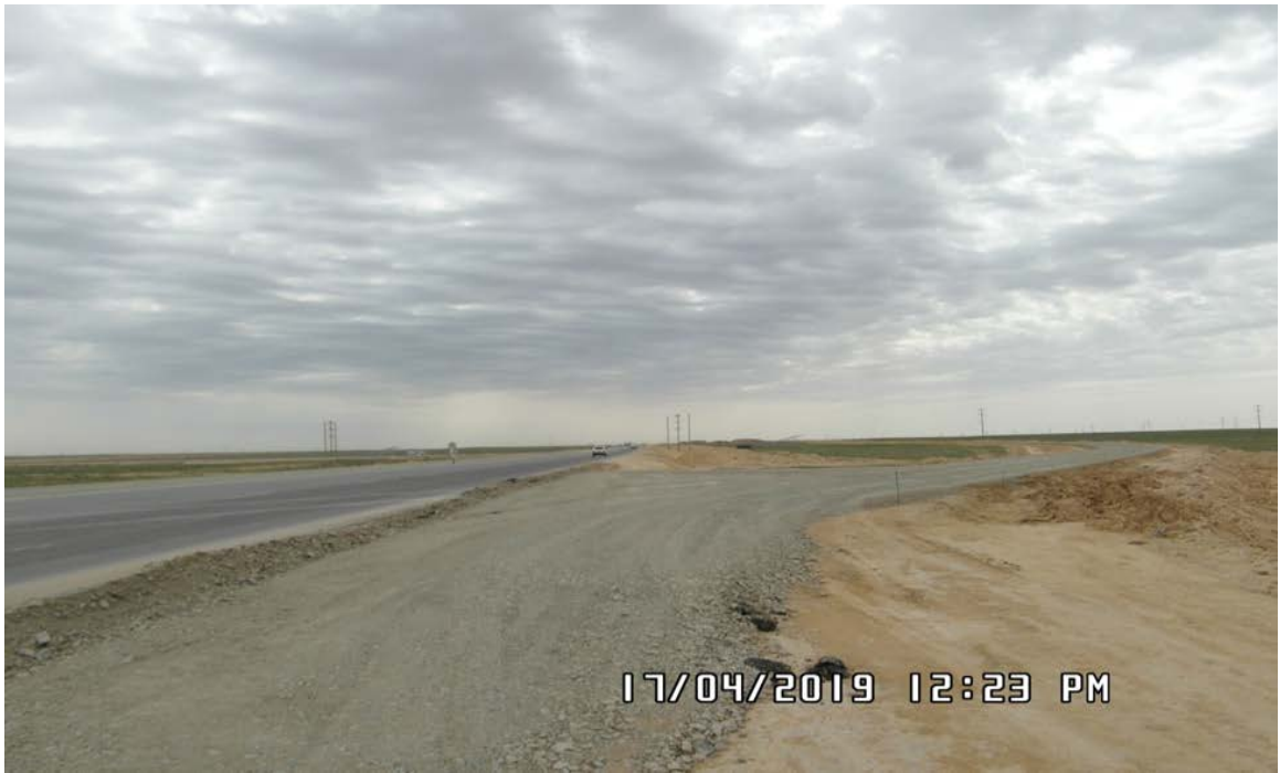
Beginning of bypass road on Pk260