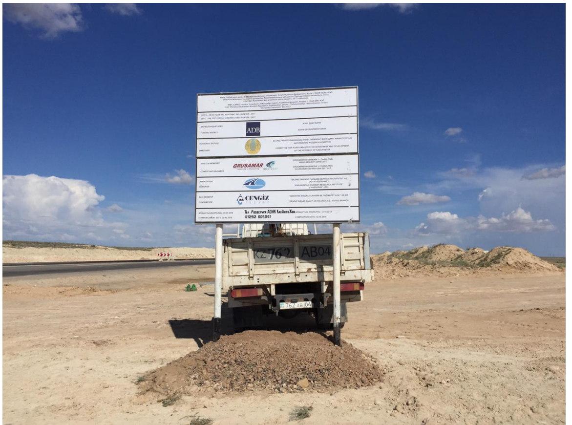
Information board Lot 2