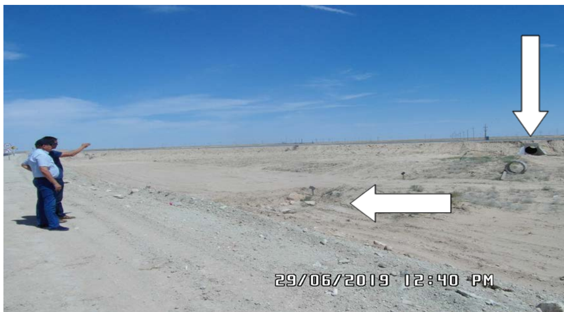
Site visit of infrastructure location on project road (upper line) and bypass (center line)