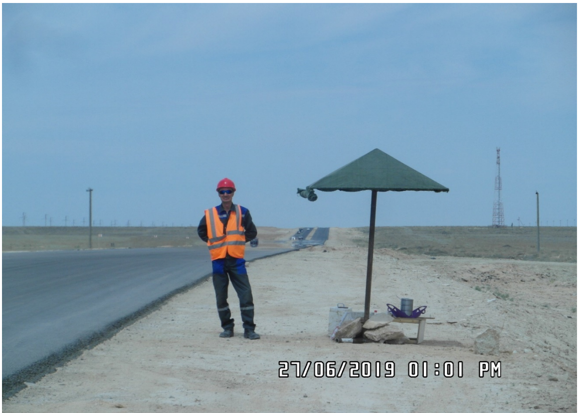
Flagman on ramp